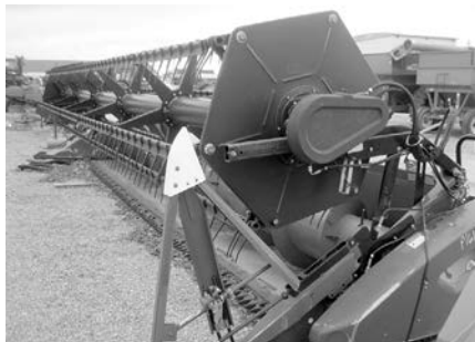
'09 Case IH 2020, 25' header, 3" knife, $5,900.