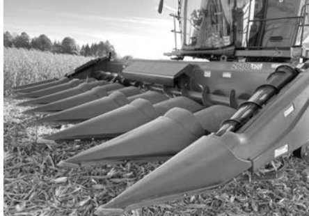
'11 Case IH 2608, 8R30" chopping corn head, AHHC height control, hyd. powered end augers, very good, low acres, $34,500.