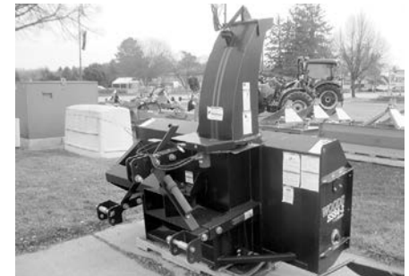
New Woods SS84, 7' 3-pt. heavy duty snowblower, hyd. chute control, $6,500; carry over $5,650.