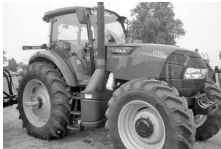
New Case IH Farmall 140A, 140 eng. hp, MFD, pwr. shuttle, 0% financing!