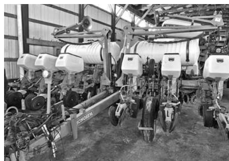
'09 Monosem NG Plus 3, 12R28", frt. fold, 400-gal. liq. fert., Yetter 2x2 out the back, floating row cleaners, $29,500.