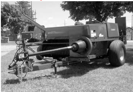
New Case IH SB541C square baler, in stock! 0%/60 Month financing.