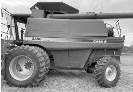
'99 Case IH 2388, 20.8x38 duals, 2900 sep. hrs., chopper, topper, $42,500.