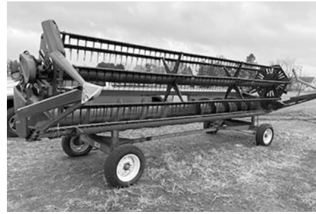
'95 Case IH 1020, 22-1/2' flex head, SCH knife, good, $8,600.