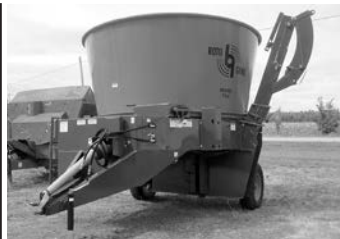
New Roto Grind 760 tub grinder in stock. (CC)

J&D Manufacturing In Stock Galvanized panel fans, 36", 50", 55" & 60" (Best lab certifie ). Order Your Fans Today!