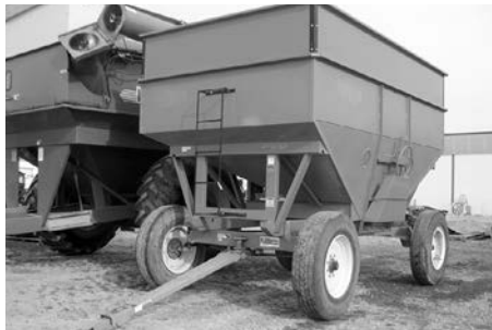
Killbros 385 gravity box, w/12-ton gear & side boards, truck tires, $6,450.