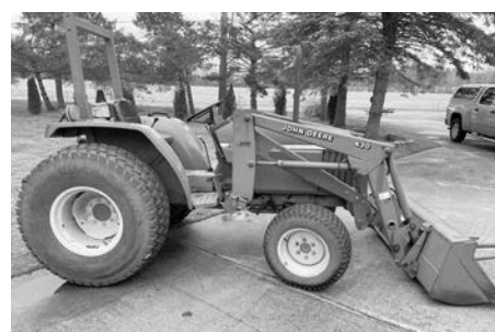
'01 JD 990 compact tractor, 4WD gear drive, w/430 ldr. & bucket & forks, $16,500.