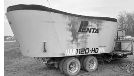
'14 Penta 1120HD vertical mixer , 1100 cu. ft., frt. dual conveyor, 2 spd., $18,000. (CC)

USED MIXERS & MISC. • New H&S hay tedders , 24', 19', 17' & 10', in stock & ready to go, (CC) . . . Call • H&S 5126 , TopShot, side discharge manure spreader, (CC) . . . . $12,000 • '20 H&S RT5800 , 19' hay tedder, stk. #8461, (CC) . . . . . $6,350 • Lucknow 2350 vertical mixer , dual conveyor, scale, stk. #8459 (CC) . . . . . $13,000