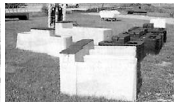
MiraFont waterers , energy-free, over (50) in stock.