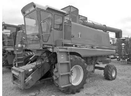
IH 1480, 2WD, 30.5x32, chopper, rock trap, eng. o'haul, good, $16,500.