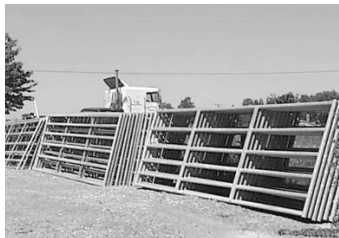
Over (200) heavy duty gates in stock.