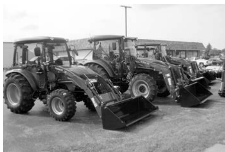
Just arriving! New Farmalls, 35-140 hp, 0%-60 month financing.