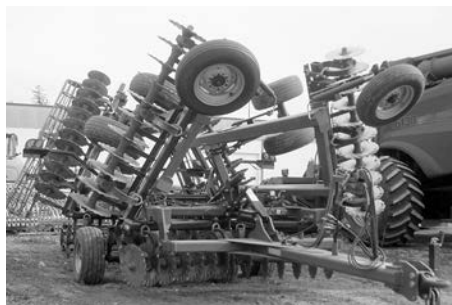
Case IH 330, 22' Turbo Till vertical tillage, rolling basket, leveler, $34,500.