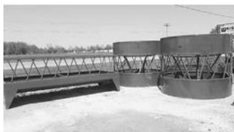
Many types & sizes of hay feeders in stock! (CC)