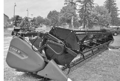
New Case IH 3020 25' grain head, in stock.