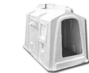
Agri-Plastics hutches in stock.