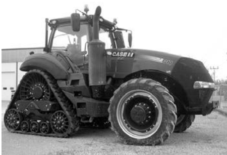
'15 Case IH Magnum 310 row trac, powershift, 1780 hrs., 6-rem., like new 16" tracks, 88" centers, $195,500.