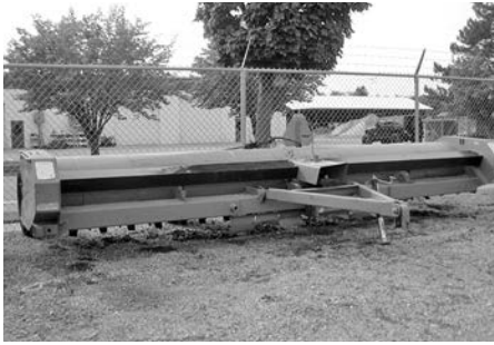
Hiniker 15' stalk chopper, $3,900.