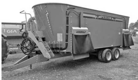
New Peecon VME-360 , 1150 cu. ft., triple screw mixer, in stock. (CC)