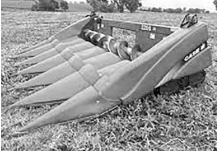
'07 Case IH 2206, 6R28", $18,000.