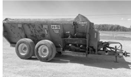
H&S 5126 , TopShot, side discharge manure spreader, $12,000.

USED MIXERS & MISC. • New H&S hay tedders , 24', 19', 17' & 10', in stock & ready to go, (CC) . . . Call • H&S 5126 , TopShot, side discharge manure spreader, (CC) . . . . $12,000 • '20 H&S RT5800 , 19' hay tedder, stk. #8461, (CC) . . . . . $6,350 • Lucknow 2350 vertical mixer , dual conveyor, scale, stk. #8459 (CC) . . . . . $13,000