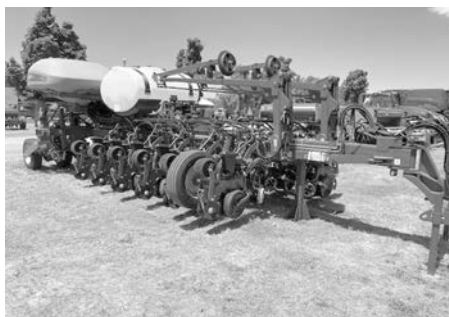
New Case IH 2150, 16R30" planter, liq. fert. & more, call for details.