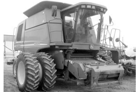
'04 JD STS 9660, 520x38 duals, 2WD, chop, topper, 3300 sep. hrs., $35,000; JD 635 35' head w/wind sys., $18,500.