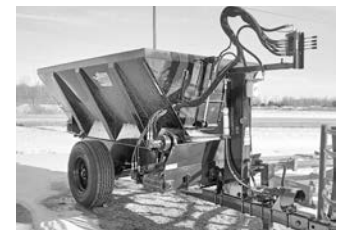
New Mensch W3350 trlr. sand shooter , in stock! (CC)