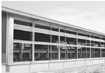
We stock curtain systems for all your applications.