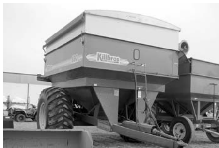
Killbros 690 grain cart, 650-bu., roll tarp, 30.5x32, $15,900.