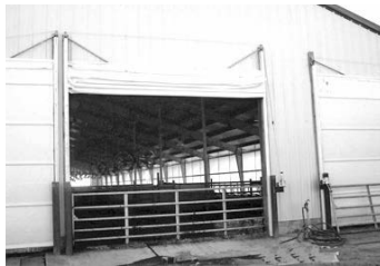
Canvas roll-up door for your opening sizes.