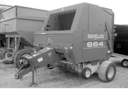
'98 NH 664, 4x6 round baler, $8,900.