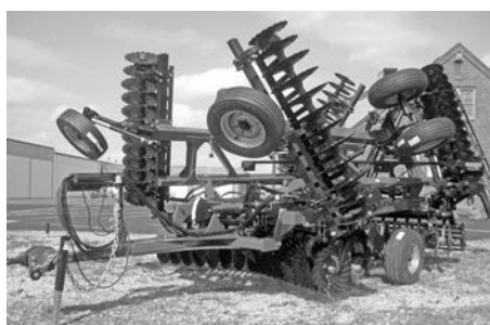
New Case IH 335 vertical till, Barracuda blade, 22' & 25' in stock, $Call.