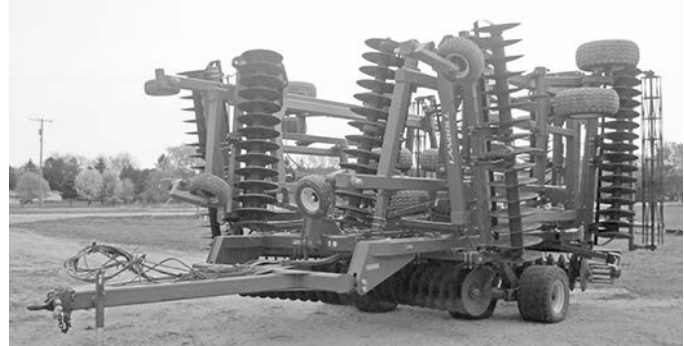
'12 Landoll 7450-49, 49' VT Plus w/Chevron conditioning reel.