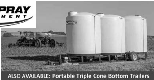
ALSO AVAILABLE: Portable Triple Cone Bottom Trailers