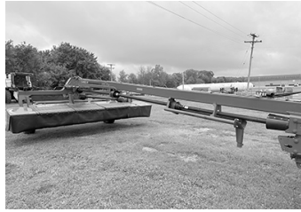
'20 Case IH DC163 disc mower, 16' cut width, drawbar swivel hitch, rotary disc, impeller conditioner, mechanical cutterbar tilt adjust, $29,900. (I)