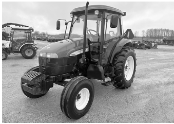
'07 NH TD80D, approx. 3,000 hrs, 72 hp, powershift, 2 mid-mount lines, 540 PTO, 2 remotes, $24,900. (M)