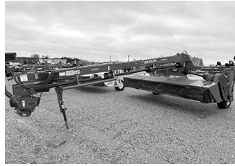
'21 NH 313 discbine, 13' cut width, drawbar swivel hitch, rotary disc, cutterbar protection, $39,900. (M)