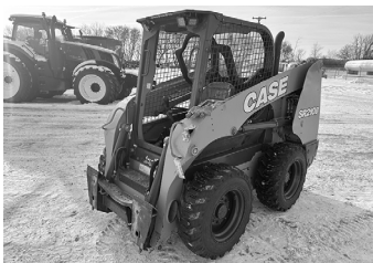
'24 Case SR210B, 3,798 hrs, 74 hp, H-pattern controls, 2 speed, quick attach, open cab, $24,900. (I)