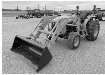
'24 Kubota L5460 & LA1055 loader, 129 hrs, 60 hp, hydrostatic, 540 PTO, $37,900. (M)