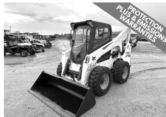
'23 Bobcat S770, 2,074 hrs, 92 hp, joystick controls, two speed, HVAC cab, air ride seat, standard flow, 84" bucket, $43,900. (I)