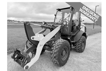
'22 NH W80C, 2,116 hrs, 80 hp, joystick controls, power quick attach, 2 speed, auto ride control, attachment control, $69,495. (BC)