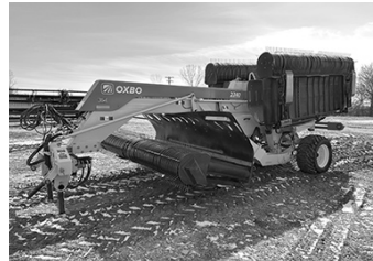
'22 Oxbo 2340 triple merger, 40' working width, 2-point hitch, $159,900. (I)