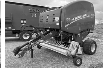
'21 NH Roll-Belt 450 CropCutter round baler, 335 bales, net only, endless belt, silage, wide pick-up, moisture sensor, $46,900. (I)