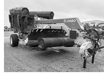
'20 Oxbo 2334 triple merger, 34' working width, 2-point hitch, flexible conveyors, $129,900. (M) - 3 AVAILABLE