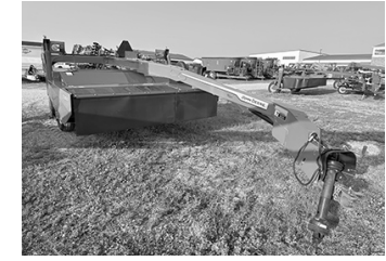
'21 JD S300 discbine, 9' cut width, flail conditioner, rotary disc, impeller conditioner, $26,900. (M)