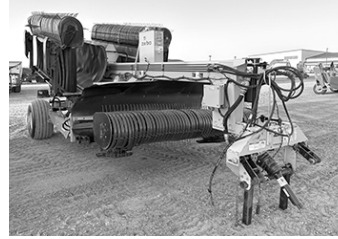
'12 Oxbo 334, 34' working width, 2-point hitch, $64,900. (M)