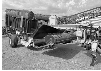
'14 Oxbo 334, 34' working width, 2-point hitch, $59,900. (I)