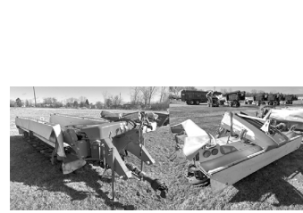
23 Pottinger Novacat 351 Alpha Motion Pro & Novacat S12 triple mowers, front mower: 11'4" cut width, rear mowers: 36' 30" cut width, $42,900. (I)