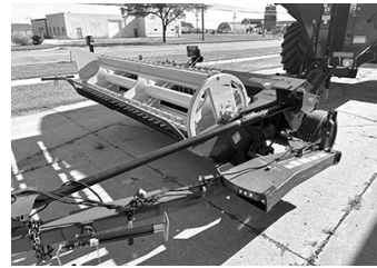
'15 NH 488 haybine, 9' cut width, sickle cutterbar, drawbar hitch, rubber conditioner, $14,900. (I)