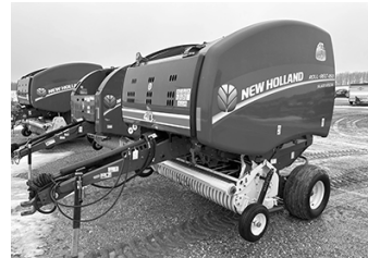
'25 NH Roll-Belt 450 Silage Special round baler, 9,315 bales, net & twine, laced belts, feed rotor, $25,900. (M)