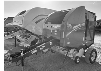
'21 & '22 NH Roll-Belt 450 utility round baler, 100 & 500 bales, twine only, hay, bale ramp, laced belts, $25,900. (M)