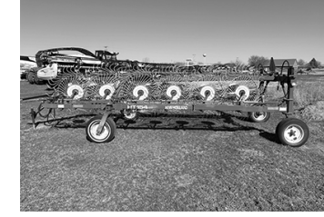
'14 NH HT154 Rake, 25" working width, 12 wheel, $7,900. (I)