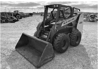
'22 NH L321, 3,688 hrs, 74 hp, hand & foot controls, quick attach, 2 speed, open cab with rear window, $21,900. (M)