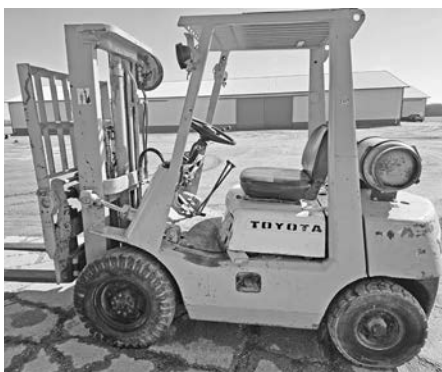
Toyota 5000 lb., 2-stage, 12' height, air tires, propane, runs great, $9,750.