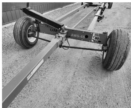
Unverferth AWS 48 header cart, all whl. steer, radial tires, light pkg., $12,500.