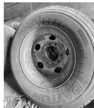
(8) Dayton D6100, 295/17R22.5, $100 ea.