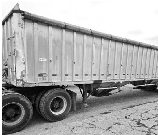
'81 Dorsey 40' hopper, 11x24.5 tires, $12,500.