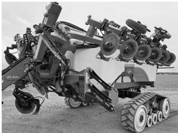
'23 JD 2530L liq. applicator, 60', 25-shank, tracks $105,000.