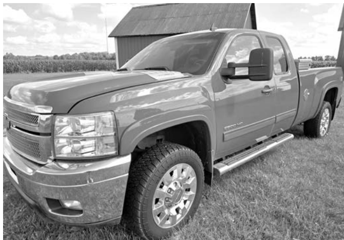
'13 Chevy 2500 HD, 4WD, cab + 1/2, 214,000 miles, Duramax dsl., $23,500.