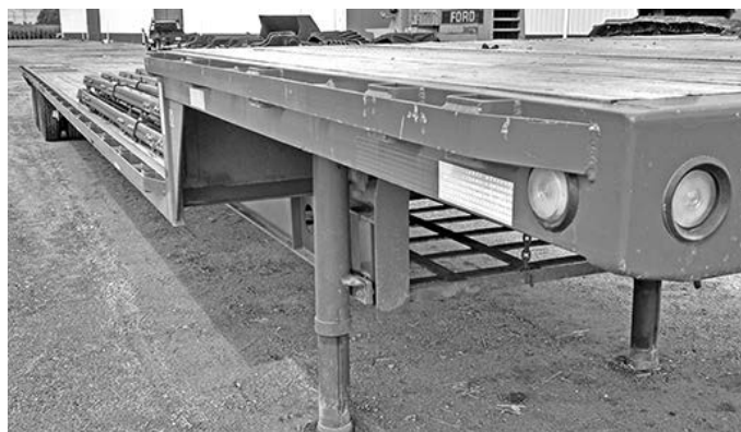
'98 Transcraft 51', new flooring, new paint, 17.5 tires, $17,500.