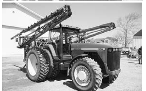
90' Fast 3-ph. mtd. hyd. spray boom, 15" centers, 3-nozzle heads, 5-valves, exc. field ready cond., $9,500, tractor also for sale. (810) 655-4859