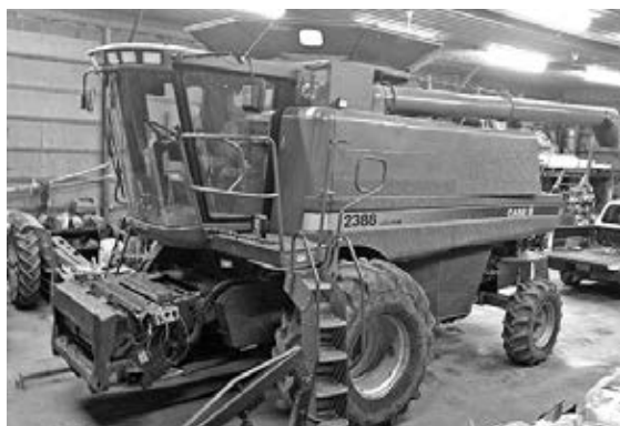
'98 Case IH 2388 combine, 30.5x32, 14.9x24, rock trap, field tracker, spec. rotor, chopper, yield mon., 2WD, 4348E/3267 rotor, 2 spd. hydro, nice cond., $42,500. (989) 565-0106 or (989) 762-5287