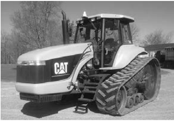
'97 CH 55, 225 hp, 2716 hrs., 25" tracks (50%), Raven cruiser, nav., exc. cond., no issues, $59,000. (586) 531-7870