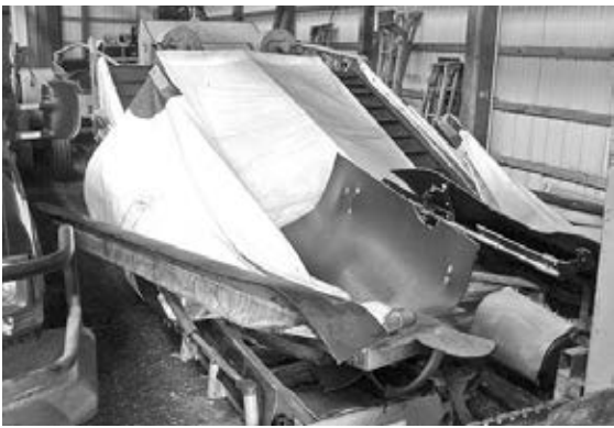
OMC 1-man cherry shaker, great runner, works great, well maintained, lots of upgrades; no texts. (231) 329-2379