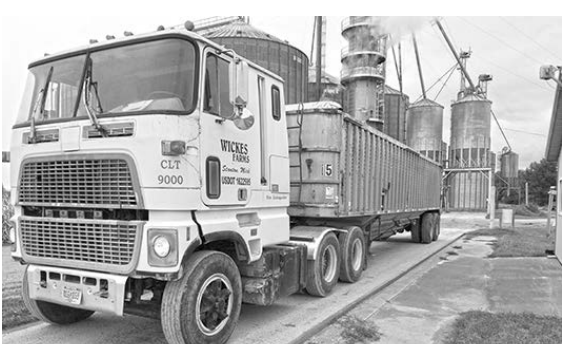
'78 Ford CO V871, Detroit Dsl., 2-line wet kit, runs good, $5,000.