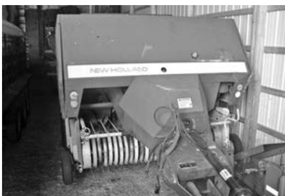
NH D1000 big square baler, works great, makes very nice tight square bales, $17,500; no texts. (231) 329-2379