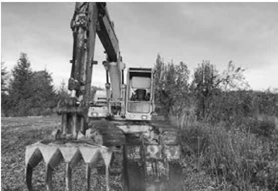
'85 Liebherr 912LC, 42,000 lbs., Deutz, air cooled, (5) bkts., $22,000. (810) 310-0320