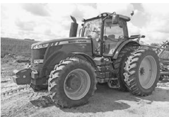
'12 MF 8650, CVT, 2250 hrs., 18.4x50 w/ duals & whl. wts., 16.9x34, frt. wts., 540/1000 PTO, very nice cond., $109,000. (989) 565-0106 or (989) 762-5287

WANTED Buying older farm trucks or semi trucks, any cond., prefer '60s to '70s GMC Astros, Titans, Transtars, Int'l. or any older truck. Cash paid. (989) 823-4043