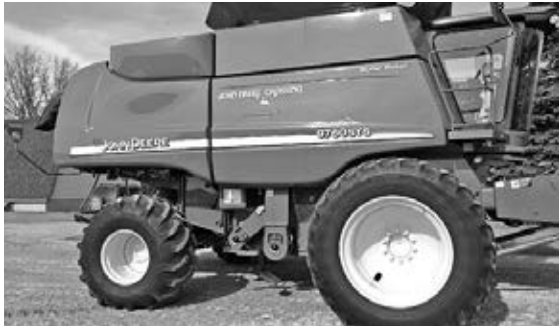
'07 JD 9760, 1241S/1895E hrs., 2WD, duals, high cap. unload, bullet rotor, exc. machine, clean, always housed. (989) 615-2296