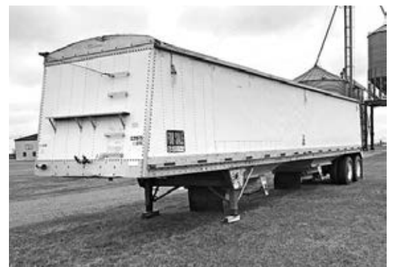
'90 Chamberlin hopper btm., newer tarp, no holes, $8,500. Lake Odessa (616) 862-2916