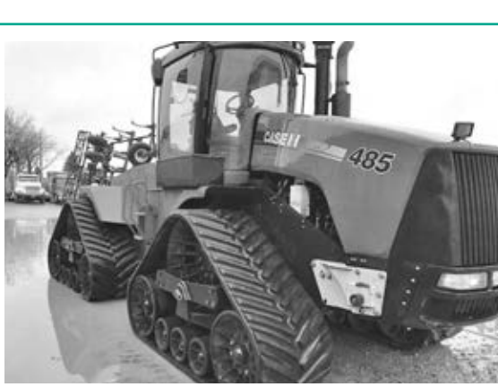
'10 Case IH 485 quad trac, 4960 hrs., 3-pt. hitch, new tracks, auto steer ready, 4-outlets, $125,000. (989) 545-9335