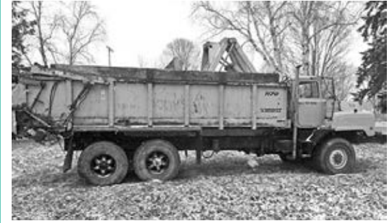
Knight manure spreader, has hydro push in the frt. & apron chains in the back, new tires, AWD, $12,000 or best offer. (616) 893-0139