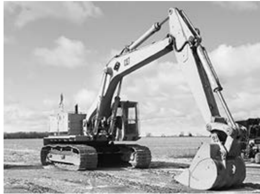
Cat 245 excavator, tight machine, very good cond., runs exc., tight pins, good U/C, mid '80's machine, $30,000 or best offer.

30'-44' Flex coil packer JD 714-17 chisel 20' Flat fold packer Westco rock picker JD frt. wts. for 8000 plus JD 450 & 165 wts. 21' Woods 3240 rotary mower (574) 633-4852