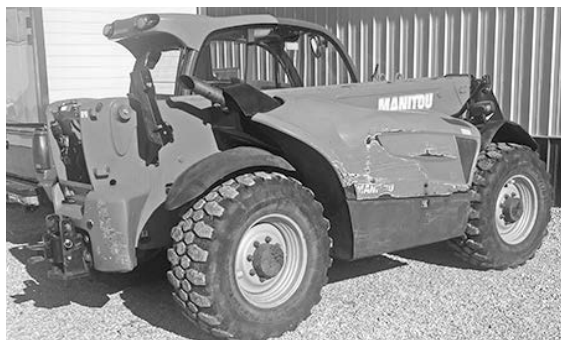
'17 Manitou 840-145 cab, 4530 hrs., $52,500 AC 6000# 3-stage, hyd. fork, tall tires, $5,500 (810) 404-7677