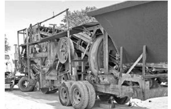
Commander crusher, 10x24 jaw/roll comb., very good cond., working when removed from site, good belts, 45% jaw, needs pwr. unit, has screen deck, $25,000. No Advertisers. (989) 330-6628