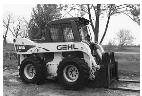
'06 Gehl 7810E, Cum. 99 hp, 2 spd., 4000h, full cab w/heat, 3850 lift, includes bkt., forks, logging tracks. (517) 852-4756