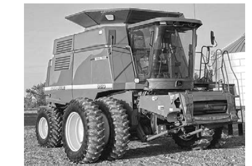
PACKAGE DEAL — JD 9510 Maximizer, 4WD, 4665E/3118S hrs., contour master, dual chaffe spreaders, chopper, fore/aft reel w/auto. spd. control, 18.4x38 duals, Maurer bin extensions, Also 925F flex head, good cond., field ready, $50,000 or best offer.

RETIRED FROM FARMING JD 9770 combine, 4WD, low hrs. JD 712 coultter chisel, 9-shank Kewanee 20' disc Sugar beet topper, all rubber belt drive, field ready, 4R (2) JD plows, 18" btm., (1) 5-btm., (1) 6-btm. Bean rod puller, 6R 32' Van trlr., hub pilot whls. Stone box & pusher bar for JD 8000 tractor JD 20' chisel plow, 3-pt. Remlinger PTO driven ditcher Small V-ditcher JD 2600 guidance screen JD single shank 8R cultivator Top Air trlr. ultra lite sprayer, 60' boom Navigator quick hitch (989) 573-0096