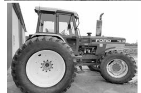
'89 Ford TW35, MFWD, 187 hp, 540/1000 PTO, cab, heat, R134A, (3) outlets, frt. & rear wts., rear diff., block heater, like new 16.9R28 frts., good 20.8R38 rears, 6500 hrs., solid tractor, $22,500. (248) 761-6510