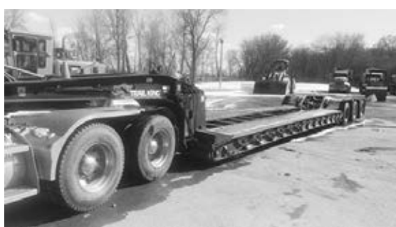
'02 Trail King TK110 50-ton lowboy, fully functioning, load bearing whl. covers, 70% brakes, 70% tires, well maintained, $44,500. (517) 521-3478