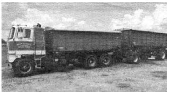
'71 Transtar 290 Cum. w/turbo, 25,000 miles on major eng., DOT, only 2300 miles on tires, truck & pup, $7,500. (517) 281-8014