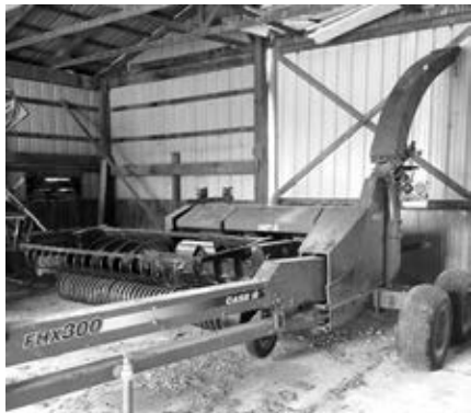
FHX300 Forage harvester, new knives, exc. cond., $25,000.

3-Pt. post hole digger, $200 White 252 disc, 10', $1,500 JD 210 disc, 15', $1,500 30' North Country camper trlr., quad bunk, super wide, elec. pwr. awning & outdoor kitchen, $16,900 (810) 304-0559