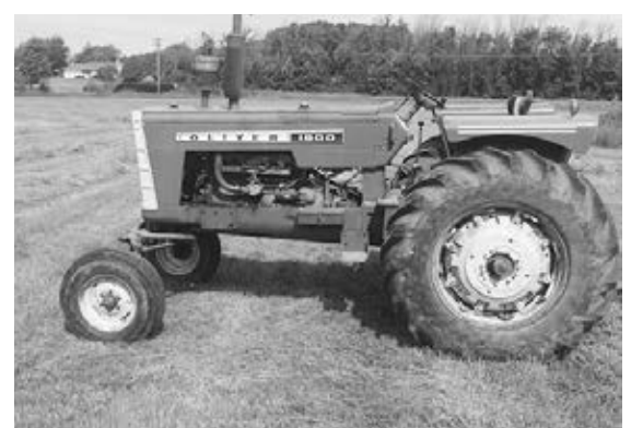
Oliver 1800G tractor, 3-pt., (2) rear hyd. outlets, PTO, exc. cond., stored inside, rblt. upper eng., $4,250. (989) 450-6157