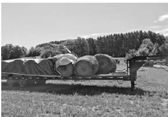
'10 Kaufman 40' 10-ton gooseneck, (3) ramps, new heavy duty tires, trlr. like new, used very little, $8,000 firm. (231) 539-8394 or (231) 838-3014

Semi loads of 8' hardwood, 12" logs, dry or green, picked up processed or delivered, 8' lengths, call for delivered location rate. (231) 846-0346