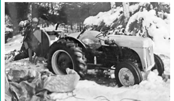
'50 Ford 8N, same owner 35 yrs., side distributor, complete rbilt. eng., hyd., radiator & clutch, new rims & tires, 3 spd. Sherman trans., (2) low, (1) high; PTO driven Buzz rig, (2) 29" replacement blades; 6' Frt. end mount tire chains snowblower; 6' Scraper blade; Rbilt. 3-pt. hitch to pull trlr.; Recond. gas tank; Extra carburetor; Reduced price, $4,500 for all (3) or will separate. Must sell, best offer. (231) 377-7169