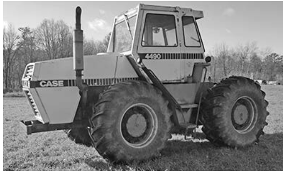
Case 4490, good strong runner, 3-pt. & PTO, 5900 hrs., ready to work, $6,500.