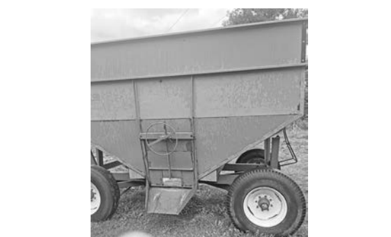
(2) Killbros 385 gravity wagons, H.D. running gear, exc. cond., $3,250 ea. (269) 944-8500

Sunflower 5035 32-1/2' field cultivator, H.D. 4-bar tine leveler 34' UM 1245D rolling harrow '20 JD 1590 15' planter, extended wear pkg., less than 500 acres All equipment housed & used on small acreage, like new (989) 550-3357