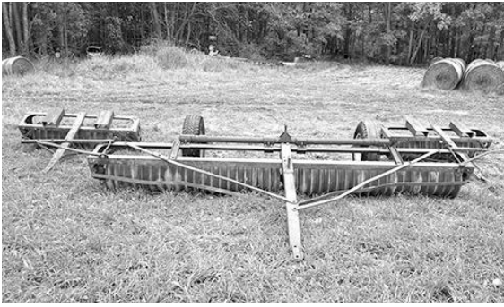
Brillion packer w/(2) pull-behind pups, 25' total, good cond., 4" axle, $1,600.