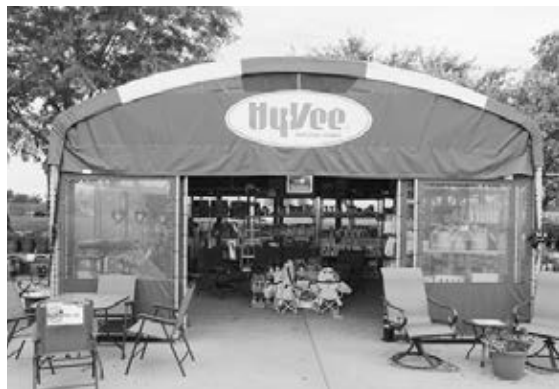
(6) Greenhouse kits, galv. H.D., commercial grade, 20 feet wide x 20 feet long x 8 feet tall, self supporting trusses, sldg. doors all (4) sides, $2,500 ea. delivered. (231) 846-0346

'04 Dodge Ram 3500 dually, 4WD, quad cab, 168,000 miles, all new tires, 6 spd., newer clutch & undercarriage, goose-neck & many more options '05 Arctic Fox 11' camper w/slide-out May separate, motivated to sell, $24,000 (616) 477-2039