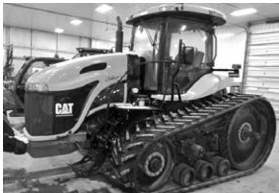
'02 MT765, 4800 hrs., 300 hp, 3-pt. hitch, frt. wts., 1000 PTO, 20% tracks, $80,000. (989) 545-9335

(2) Meyer kicker wagons w/running gear, flotation tires, $2,000 ea. (2) 500-Gal. sprayer tanks, (1) S.S., (1) alum., $700 ea. AC 7' sickle mower, hyd. on whls., $700 (231) 218-4301