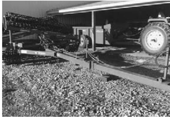
34' Brillion Optimizer, field ready. (574) 633-4852