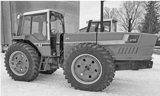
Case IH 3788 2+2, very good radial tires, new clutch, new cab seat, good TA, runs strong, ready to work, $15,000.