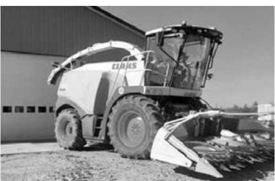
'08 Claas 940, come w/8R corn head, hay pickup, 2550 eng./1560 cutter hrs., $235,000. (989) 909-0029