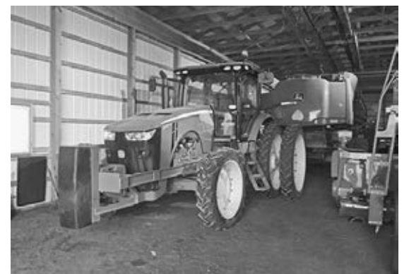
'11 JD 8235 or 5-hyd. big pump & pwr. beyond wt. bracket, quick hitch, 320/90R54 w/duals, 320R34 frts., 1824 hrs., exc. cond., $135,000 or best offer. (989) 233-9571