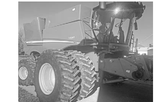
'14 S690, 4WD, 1804S hrs., $129,000 '16 JD 640FD draper head, $45,000 (810) 404-7677