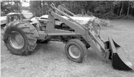
'65 Case 530 tractor w/great tires, rblt. eng. 500 hrs. ago w/preheat, new frt. load bucket w/counter weight, includes 2-btm. plow w/3-pt. hitch, nice paint, asking $6,500. Sparta, MI.