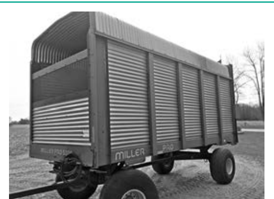
(2) Miller Pro 5200 forage wagons, 18' rear unload, $7,000 ea., deal on both. (989) 330-0325