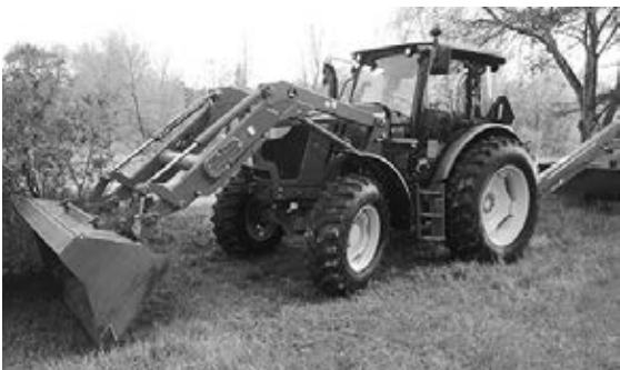
'13 JD 6115D tractor w/H310 ldr., bkt., bale spear, 118 hp, 9 fwd./9 rev. trans., 800 hrs., buddy seat & fenders, $55,000 '10 JD 830 mower conditioner discbine, $19,500