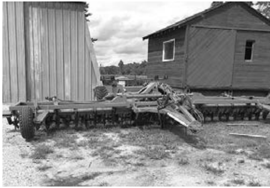
'12 Joker 8RT compact disc, 24' wide, frt. discs 40%, rear discs 60%, spg. rolling baskets, works great, $27,000. (810) 691-0168