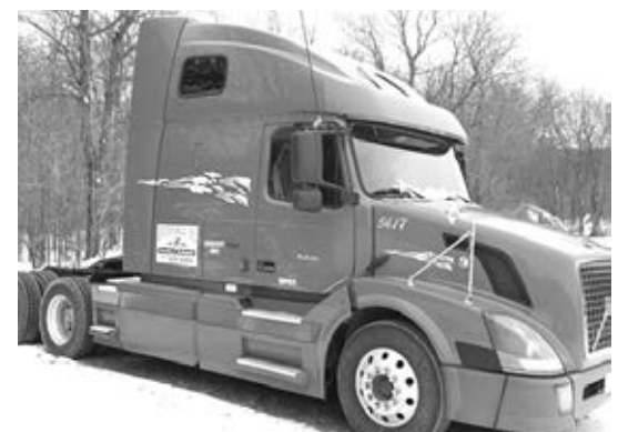
'04 Volvo VNL, 400 hp ISX Cum., 10 spd., 2-line wet kit for lowboy, 12.5F, 40R, brand new tires, newer 5th whl., alum. rims, little use last 3 yrs., $13,000, consider trade Michigan Special. (231) 539-8394 or (231) 838-3014