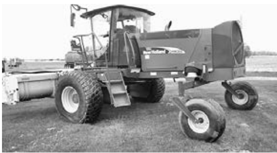
'07 NH HW365 w/a '12 419 head, has susp. & deluxe cab, 1850 hrs., very nice, $69,500.