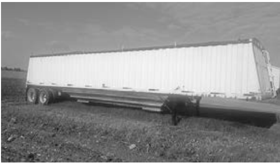
'97 Jetco 42' hopper, roll tarp, brakes 70%, tires 50%, 11x24.5 tires, new landing gear, $7,500 or best offer. (989) 565-0106 or (989) 762-5287