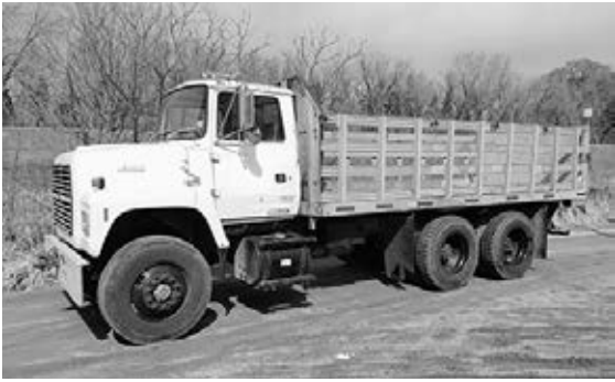
'92 Ford LNT9000, 3176 Cat, Allison auto., Hend. susp., 18' frame, will sell w/o flatbed, $12,500. (616) 836-5691