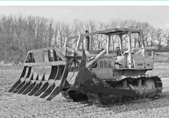
Komatsu D65E dozer, 8158 hrs. w/brush rake, $25,000. (269) 208-3446

Ford 6600 dsl. w/cab & A/C, $7,900 Case 430 gas, WF, $4,500 Ford 3000 gas, $4,200 Case 995 w/ldr., $4,900 Several Universal quick tach bkts. & pallet forks (231) 878-0495