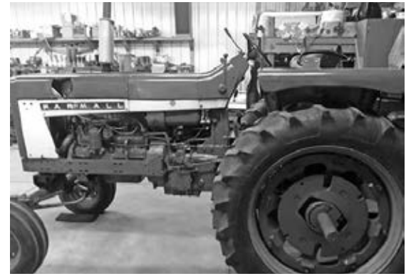
IH 706, good cond., runs great, lots of work done on it, $3,700. Call or text (616) 255-6199