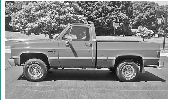
'87 Chevy Silverado, short box, 4x4, original owner, 107,000 original miles, very solid body, 350 TBI eng., 3.73 limited slip diff., all avail. options, red, $17,500. (269) 204-8269