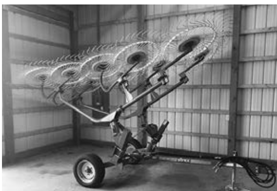
Sitrex (10) whl. rake, very little use on 27 acres, barn kept, like new cond., $3,750; no texts. (231) 329-2379

All you hobby farmers, a '65 Farmall 706 w/4-outlets, just finished rblt. motor, new air intake exhaust, muffler rblt., generator, steering whl., new battery & cover, (2) new steps, all new paint, ready to go to work, $7,500 or make offer. (616) 984-6348