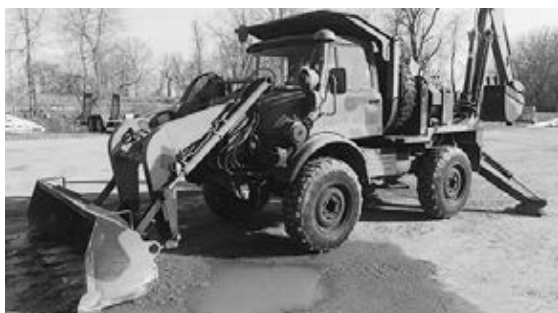
'89 Unimog SEE, FTL truck w/removeable backhoe & ldr. bkt., Daimler Benz eng., 4x4, 16 spd., new clutch, 7,050 miles, complete w/hyd. chain saw, hammer drill, jack hammer, w/orig. tools, spare tire, all in good working order/cond., $17,500. (517) 521-3478