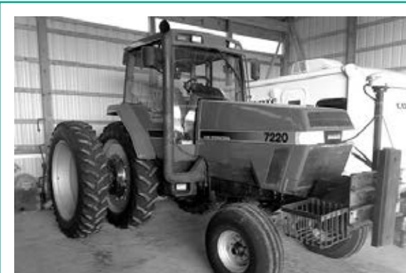
Case IH 7220, 4106 hrs., super clean, very well maintained, shiny paint & great cab, OnTrac II GPS, nicest you will find, $48,000. (989) 284-7979

Affordable (old school) fuel injection pump repair. Pay for the parts & labor that it (really) costs to repair your pump. Money is tight, don't spend more than you should have to. All work 100% warranted for 1 year. AI (231) 757-0064