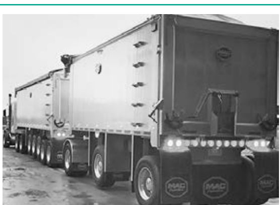
'16 MAC 5n 3s, 80x102, Alumacleared, 75% brakes & tires, 385s on lifts, dual down axles, Cramaro elec. tarps, asking $143,000. (989) 450-9417