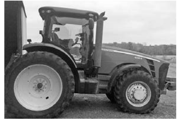
JD 8225R tractor, 4030 hrs., 480/80R46 rears, $93,000 '10 Brent 1082 grain cart w/tracks, $43,000 Case IH 8230, 1330 hrs., 4x4, loaded $190,000 '12 Geringhoff folding rota disc, 1230F, elite XL, JD hookup, $54,000 '13 Case IH 500 quad trac, 36" tracks, 1700 hrs., $205,000 JD 635F 35' platform, great shape, $15,000 JD 2210 field cult., 43-1/2', good shape, $20,000 Dalton 12-16R Nh3 toolbar, Raven super cooler, flow meter & control valves, $9,000 JD 4440, 18.4x38 tires, quad range, runs good, $18,000 Randolph PTO drive line shaft well gear head, Model 640h, 40 hp, 1:1 ratio Drobny Farms - Kalamazoo, MI (269) 760-5856