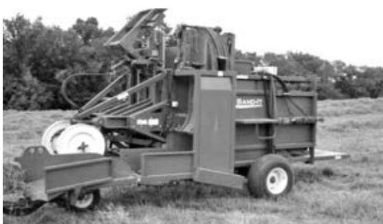
GFC Bale bandit, exc. shape, bales 21 bales in a bundle, always shedded, requires 25-gals./min. to operate, $35,000 or best offer. (616) 893-0139