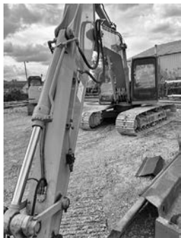
Hitachi EX150-5LC excavator, new frt. & hyd. quick changer, fleet maintained, aux. hyd., 10,000 hrs., 48" bucket, tight machine.