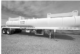
'08 Dragon, steel barrel, 130 BBL, self-contained unit, air ride, $45,000.