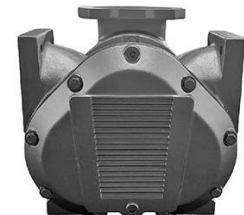
Liquid Controls Meter.