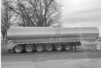
'81 Almont, 10,000-gal. cap. FPU, rblt. in '17, air ride, alum. whls., $110,000.