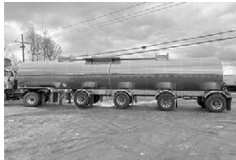
'99 Polar, DOT 407, S.S. barrel/sub., 10,200-gal. cap., quad w/spread, air ride, alum. whls.