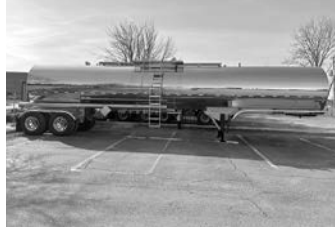
'24 STE, DOT 407, 7000-gal. cap., S.S. barrel, insulated, in-transit heat, sanitary finish, air ride susp., tire inflation, $119,500 + F.E.T.