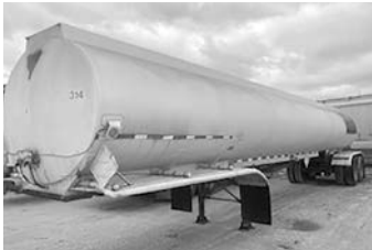
'86 Custom, 9000-gal. cap., 4-compt., spg. susp., CALL CHAD OR GARY.