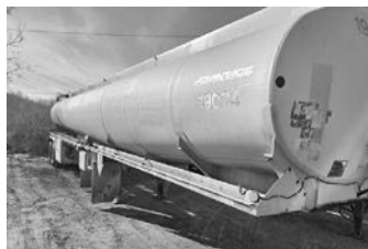
'95 Frue., alum. barrel, taper btm., 4-compt., spg. ride susp., $23,500.