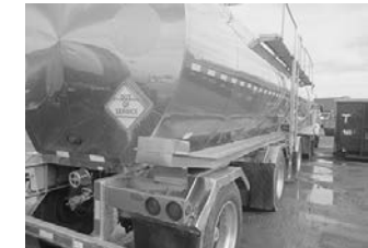
'95 Tremcar, S.S. barrel/sub., DOT 407, 10,200-gal. cap., 3-9' spread, air ride, alum. whls., $65,000.