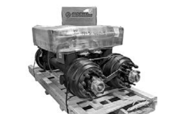
New Ridewell 23K axles in stock. Call Now! We have lifts & downs.