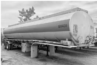
'88 Frue., alum. barrel, DOT 306, 5-compt., 12,000-gal. cap., tdm., alum. whls., $25,900.