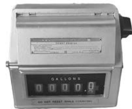
Veeder Root Register & Printer.