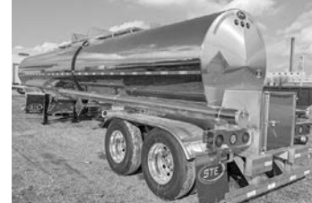
'24 STE, DOT 407, 5000-gal. cap., intransit heat, air ride, Tire Max, alum. whls., $124,900 + F.E.T.