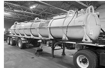
'95 Presvac, steel barrel/frame, vac. non-code, 6000-gal. cap., newer NVE 607 pump, tri-axle, $39,500.