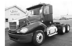
#3273 - '07 Columbia, 531,000 miles, 14L Det., 455 hp, 12F, 40R, air ride, 10 spd., 3.73 ratio, 169" WB, Ryder maintained, $32,000.