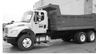
#3278 - '08 FTL M2, 341,000 miles, Cum. ISC, 330 hp, 16F, 315R22.5 frt. @ 75%, 40R, air ride, FROF12210C 10 spd., 4.33 ratio, new American 15' gravel box, all hi-tensile steel, 3/16 floor, 1-pc. 50,000 PSI, 44" sides, Ryder maintained, call.