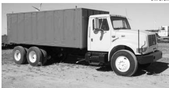
#3271 - '00 Int'l. 4900, 86,592 miles, DT466, 225 hp, new brakes & drums, 14.6F, 40R, Hend. beam, Allison auto. 653, 5.38 ratio, 156" C.T., 18" used box, frt. post hoist, from Tennessee, no rust, $41,000.