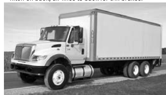
#3195 - '06 Int'l. 7600, 416,000 miles, ISM 305 hp, 10 spd. FRO11210C O.D., all new brakes, 24"x102"x91" van, 11x22.5 tires, 12F, 40R, 4.30 ratio, 260" WB, 191" C.T., call.