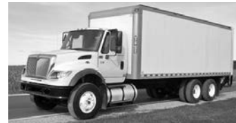
#3195 - '06 Int'l. 7600, 416,000 miles, ISM 305 hp, 10 spd. FRO11210C O.D., all new brakes, 24"x102"x91" van, 11x22.5 tires, 12F, 40R, 4.30 ratio, 260" WB, 191" C.T., call.