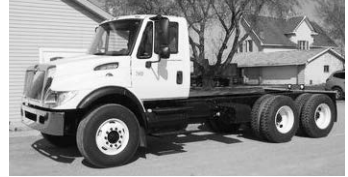
#3284 - '06 IH 7400, 57,275 (ECM) miles, DT466, 260 hp, air brakes like new, 11x22.5 drives 75% caps, 12F, 34R Hend. beam, 315/80R22.5 tires 80%, Auro 5 spd. 3060P/PTO gear, 6.17 ratio, 189" WB, 15" frame, CT 122, pintle hitch on back, air lines to back for trlr. brakes.