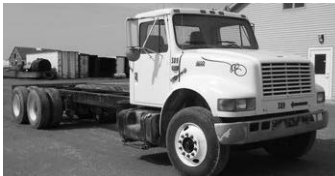
#3282 - '00 Int'l. 4900, DT466, 240 hp, runs good, 14F, 40R, air ride, dump valve, Allison auto. 5 spd. 3060P/PTO creeper, 5.38 ratio, 25" of frame, project truck, call for details, $6,500 or best offer.