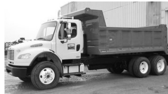
#3278 - '08 FTL M2, 341,000 miles, Cum. ISC, 330 hp, 16F, 315R22.5 frt. @ 75%, 40R, air ride, FROF12210C 10 spd., 4.33 ratio, new American 15' gravel box, all hi-tensile steel, 3/16 floor, 1-pc. 50,000 PSI, 44" sides, Ryder maintained, call.