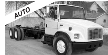
#3200 - '03 FTL FL80, 231,000 miles, Cat 3126, 250 hp, Allison auto., 14F, 40R, air ride, 5.29 ratio, 25' of dbl. frame, call.