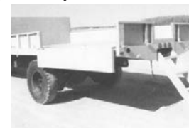
14' Flatbed - (2) New 14' steel contractors bodies, ladder on back, 26"x36" tool box, $3,500.