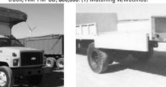
#3250 - '02 Chevy 8500, 3126 Cat, 300 hp, 8LL trans., 12F, 40R, Hend. beam, 3.90 ratio, 19"x96" MAC Alum box, 72" sides, plus 2x6 side boards, 78" high grain hole, air tailgate, slide & go tarp, GA truck, no rust, call.