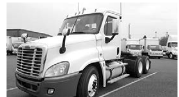
#3261 - '09 FTL Cascadia, 523,000 miles, 14L Det., 455 hp, 10 spd., 12F, 40R, air ride, 3.70 ratio, 180" WB, A/C, Jake, cruise, Penske maintained, $35,000.