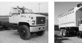
#3285 - '98 Chevy C8500, only 79,214 miles, Cat 3126 230 hp, brakes like new, 11x22.5 drives 80%, steering 80%, L40%, R75%, 14.6F, 34R Hend. beam, Allison auto 653 PTO gear, 4.33 ratio, CT 124, 15" frame, pintle hitch, air lines to back for trlr. brakes, driver's seat air ride, seats (3) people, $14,500.