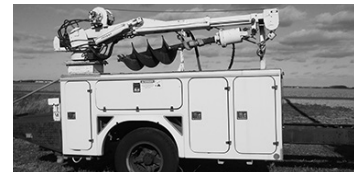
#3253A - 11' Fiberglass service body, 10' reach Pft-man, HY crane & winch, 12-volt-110 elec. converters, HY legs on back for crane, winch cap. 25000 lbs. to 7000 lbs., $5,500.