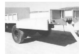
14' Flatbed - (2) New 14' steel contractors bodies, ladder on back, 26"x36" tool box, $3,500.