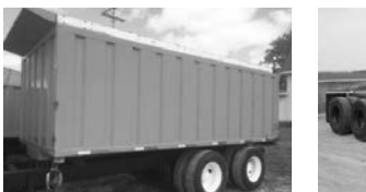
#3263A - Used 18-1/2' steel farm box, 64" sides, 2'x6" side boards, frt. post hoist, air tailgate, call.