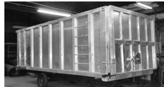
Used 20'6"x102" all alum. box, 72" sides, new frt. post hoist, new air latch tailgate, call.