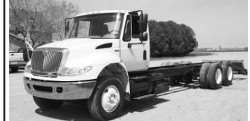
#3268 - '09 Int'l. 4400, DT466, 260 hp, 12F, 40R, air ride, Allison auto. XMSN 3000HS, 5.29 ratio, 272" WB, A/C & cruise, $30,000.