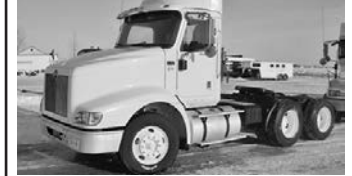
#3242 - '05 Int'l. 9200i, C13, 380 hp up to 470 hp, 10 spd., 12F, 40R, air ride tdm., air ride cab, $25,500.