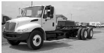
#3241 - '04 Int'l. 4400, DT466, 250 hp, 11x22.5 tires, (8) new recaps, 14F, 40R air ride, 5 spd. Allison w/ PTO gear, 5.29 ratio, 256" WB, 188" CT, A/C, cruise, tilt, AM/FM/CD, susp. dump valve, 3/8" single frame, 26" of frame, call.