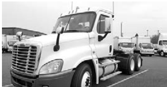
#3261 - '09 FTL Cascadia, 523,000 miles, 14L Det., 455 hp, 10 spd., 12F, 40R, air ride, 3.70 ratio, 180" WB, A/C, Jake, cruise, Penske maintained, $35,000.