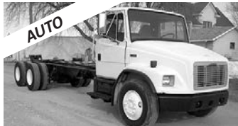
#3200 - '03 FTL FL80, 231,000 miles, Cat 3126, 250 hp, Allison auto., 14F, 40R, air ride, 5.29 ratio, 25' of dbl. frame, call.