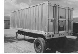
New all alum. Dakota 19"x96", 62" sides, ladder bolt on side of box over tires, 3/16 alum. extruded inner locking floor, C/M 4" channel on 15" centers, long beams 8" alum. channel, top rail 4x4x3/16 tubing, 3-pc. swg. tailgate, w/H.D. hinges, (3) latches, grain hole, $13,090 plus taxes & freight, your choice of hoist.