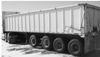
#3239 - '83 TTE dump, steel, (2) lift axles, 11x22.5, 75%, 75% brakes, ShurLok roll tarp, alum. tailgate, air tailgate latch, good trlr. for age, $17,500 reduced to $16,500.