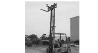
Toyota 2FG40, 16' lift, 7000# cap., runs good, works good.