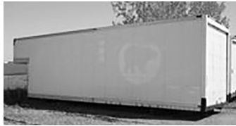
#3207A - (10) Used van bodies, call.