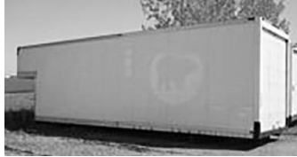
#3207A - (10) Used van bodies, call.