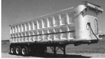
#3110 - '02 Benson 34"x96", 84" sides, tri-axle, alum. 10-hole pilot rims, 74B tri-axle, call.