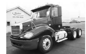
#3273 - '07 Columbia, 531,000 miles, 14L Det., 455 hp, 12F, 40R, air ride, 10 spd., 3.73 ratio, 169" WB, Ryder maintained, $32,000.