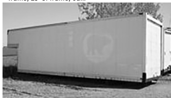
#3207A - (10) Used van bodies, call.