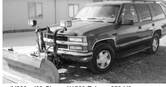
#V309 - '96 Chevy K1500 Tahoe, 350 V8 gas, auto., like new Firestone tires, 188,400 miles, good Curtis snowplow, $3,800.