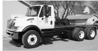
#3284 - '06 IH 7400, 57,275 (ECM) miles, DT466, 260 hp, air brakes like new, 11x22.5 drives 75% caps, 12F, 34R Hend. beam, 315/80R22.5 tires 80%, Auro 5 spd. 3060P/PTO gear, 6.17 ratio, 189" WB, 15" frame, CT 122, pintle hitch on back, air lines to back for trlr. brakes.