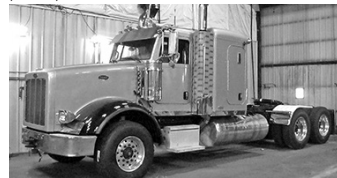
#3260 - '10 Pete 367, ISX, 525 hp, 18 spd., 324,000 miles, 20F, 46R, 4:10 ratio, 244" WB, 48" slpr, wet lines, all new paint, right tank 150-gal., left tank split fuel 80-gal., oil 70-gal., lockers, new tires, like new brakes, call.