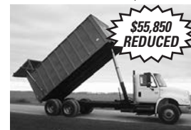
#3107 - '05 Int'l. 4400, DT466, 285 hp, 10 spd., 14F, 40R, air ride, new steel 20"x102", 72" sides, silage, grain, sugar beets, 190" frt. post hoist, 36" air hi-lift tailgate, 660,000 reduced to $55,850 + F.E.T. & sales tax.