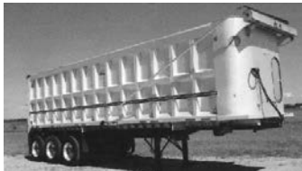
#3110 - '02 Benson 34"x96", 84" sides, tri-axle, alum. 10-hole pilot rims, 74B tri-axle, call.