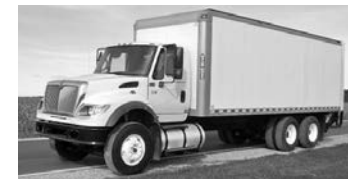
#3195 - '06 Int'l. 7600, 416,000 miles, ISM 305 hp, 10 spd. FRO11210C O.D., all new brakes, 24"x102"x91" van, 11x22.5 tires, 12F, 40R, 4.30 ratio, 260" WB, 191" C.T., call.