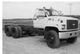
#3285 - '98 Chevy C8500, only 79,214 miles, Cat 3126 230 hp, brakes like new, 11x22.5 drives 80%, steering 80%, L40%, R75%, 14.6F, 34R Hend. beam, Allison auto 653 PTO gear, 4.33 ratio, CT 124, 15" frame, pintle hitch, air lines to back for trlr. brakes, driver's seat air ride, seats (3) people, $14,500.