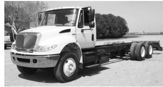
#3268 - '09 Int'l. 4400, DT466, 260 hp, 12F, 40R, air ride, Allison auto. XMSN 3000HS, 5.29 ratio, 272" WB, A/C & cruise, $32,000.