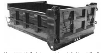
New 3000 10' Godwin gravel box, 24" sides, 30" tailgate & bulkhead, hoist kit dbl. arm under body, F.O.B. Pigeon, $6,950 plus tax & installation.