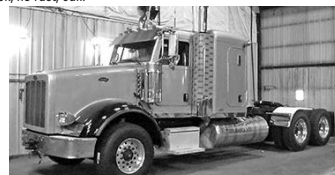
#3260 - '10 Pete 367, ISX, 525 hp, 18 spd., 324,000 miles, 20F, 46R, 4:10 ratio, 244" WB, 48" slpr, wet lines, all new paint, right tank 150-gal., left tank split fuel 80-gal., oil 70-gal., lockers, new tires, like new brakes, call.

SOME TRUCKS MUST GO! STOP IN OR CALL FOR DETAILS & REDUCED PRICES!