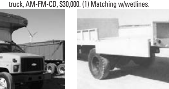
#3250 - '02 Chevy 8500, 3126 Cat, 300 hp, 8LL trans., 12F, 40R, Hend. beam, 3.90 ratio, 19"x96" MAC Alum box, 72" sides, plus 2x6 side boards, 78" high grain hole, air tailgate, slide & go tarp, GA truck, no rust, call.