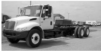
#3241 - '04 Int'l. 4400, DT466, 250 hp, 11x22.5 tires, (8) new recaps, 14F, 40R air ride, 5 spd. Allison w/ PTO gear, 5.29 ratio, 256" WB, 188" CT, A/C, cruise, tilt, AM/FM/CD, susp. dump valve, 3/8" single frame, 26" of frame, call.