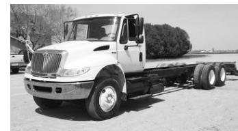
#3268 - '09 Int'l. 4400, DT466, 260 hp, 12F, 40R, air ride, Allison auto. XMSN 3000HS, 5.29 ratio, 272" WB, A/C & cruise, $32,000.