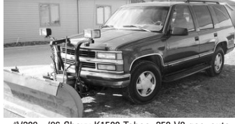
#V309 - '96 Chevy K1500 Tahoe, 350 V8 gas, auto., like new Firestone tires, 188,400 miles, good Curtis snowplow, $3,800.