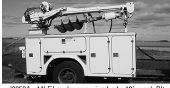
#3253A - 11' Fiberglass service body, 10' reach Pitman, HY crane & winch, 12-volt-110 elec. converters, HY legs on back for crane, winch cap. 25000 lbs. to 7000 lbs., $5,500.