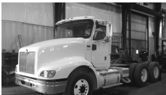
#3164 - '07 Int'l. 9200i, 415,027 miles, Cum. ISX 453 hp, 10 spd. Fuller trans., 11x22.5 tires, 12F, 40R air ride, 3.73 ratio, new paint on frame & cab, call.