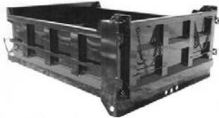
New 3000 10' Godwin gravel box, 24" sides, 30" tailgate & bulkhead, hoist kit dbl. arm under body, F.O.B. Pigeon, $6,950 plus tax & installation.

New & used farm bodies, (2) new 18' steel, (1) new 19' alum., used 18' steel, 8' alum. flat, 9' steel flat, 8' steel flat.