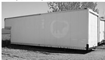
#3207A - (10) Used van bodies, call.