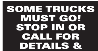
SOME TRUCKS MUST GO! STOP IN OR CALL FOR DETAILS & REDUCED PRICES!

Visit our website for several more units! Over 80 units in stock! www.ThumbTruck.com