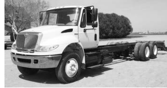
#3268 - '09 Int'l. 4400, DT466, 260 hp, 12F, 40R, air ride, Allison auto. XMSN 3000HS, 5.29 ratio, 272" WB, A/C & cruise, $32,000.