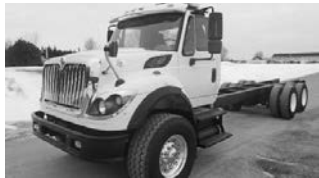
#V3281 - '09 Int'l. Workstar 7600, 296,800 miles, ISM Cum., 320 hp, 14F, new 425R22.5 tires, 40R, air ride, 10 spd. Ultrashift auto., 3.90 ratio, 259" WB, 189" C.T., alum. fuel tank, right side visor, $35,000.