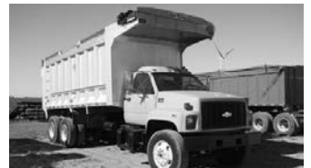
#3250 - '02 Chevy 8500, 3126 Cat, 300 hp, 8LL trans., 12F, 40R, Hend. beam, 3.90 ratio, 19"x96" MAC Alumi box, 72" sides, plus 2x6 side boards, 78" high grain hole, air tailgate, slide & go tarp, GA truck, no rust, call.