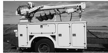
#3253A - 11' Fiberglass service body, 10' reach Pitman, HY crane & winch, 12-volt-110 elec. converters, HY legs on back for crane, winch cap. 25000 lbs. to 7000 lbs., $5,500.