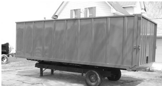
#3045A - (2) New 18' TTT steel farm box, 10-ga. floor, 62" sides, air tailgate, frt. post hoist, call.