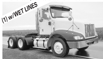
#3245 - (3) '05 Int'l. 9200i; 570,204 miles, C13, 380 hp, 10 spd., 80% brakes, 295R22 tires, 12F 40R, air ride tdm, 52,000 GVW, 3.73 ratio, 164" WB, 95" C.T., A/C, cruise, Jake, very clean truck, AM-FM-CD, $30,000. (1) Matching w/wetlines.