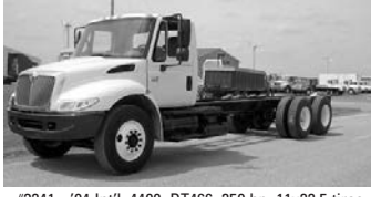
#3241 - '04 Int'l. 4400, DT466, 250 hp, 11x22.5 tires, (8) new recaps, 14F, 40R air ride, 5 spd. Allison w/PTO gear, 5.29 ratio, 256" WB, 188"CT, A/C, cruise, tilt, AM/FM/CD, susp. dump valve, 3/8 single frame, 26' of frame, call.