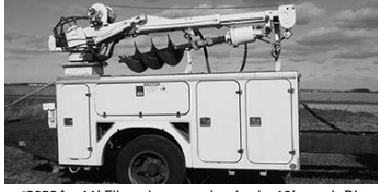
#3253A - '11' Fiberglass service body, 10' reach Pitman, HY crane & winch, 12-volt-110 elec. converters, HY legs on back for crane, winch cap. 25000 lbs. to 7000 lbs., $5,500.