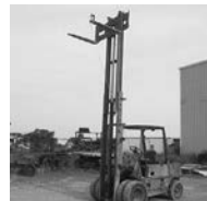
Toyota 2FG40, 16' lift, 7000# cap., runs good, works good.