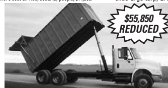
#3107 - '05 Int'l. 4400, DT466, 285 hp, 10 spd., 14F, 40R, air ride, new steel 20"x102", 72" sides, silage, grain, sugar beets, 190" frt. post hoist, 36" air hi-lift tailgate, $60,000 reduced to $55,850 + F.E.T. & sales tax.