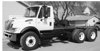
#3284 - '06 IH 7400, 57,275 (ECM) miles, DT466, 260 hp, air brakes like new, 11x22.5 drives 75% caps, 12F, 34R Hend. beam, 315/80R22.5 tires 80%, Auro 5 spd. 3060P/PTO gear, 6.17 ratio, 189" WB, 15" frame, CT 122, pinde hitch on back, air lines to back for trlr. brakes.