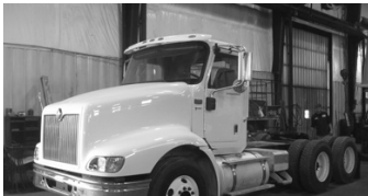
#3164 - '07 Int'l. 9200i, 415,027 miles, Cum. ISX 453 hp, 10 spd. Fuller trans., 11x22.5 tires, 12F, 40R air ride, 3.73 ratio, new paint on frame & cab, call.