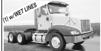
#3245 - (3) '05 Int'l. 9200i, 570,204 miles, C13, 380 hp, 10 spd., 80% brakes, 295R22 tires, 12F, 40R, air ride tdm., 52,000 GVW, 3.73 ratio, 164" WB, 95" C.T., A/C, cruise, Jake, very clean truck, AM-FM-CD, $30,000. (1) Matching w/wetlines.