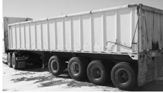
#3239 - '83 TTE dump, steel, (2) lift axles, 11x22.5, 75%, 75% brakes, ShurLok roll tarp, alum. tailgate, air tailgate latch, good trlr. for age, $17,500 reduced to $16,500.