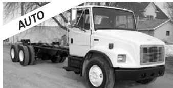
#3200 - '03 FTL FL90, 231,000 miles, Cat 3126, 250 hp, Allison auto., 14F, 40R, air ride, 5.29 ratio, 25' of dbl. frame, call.