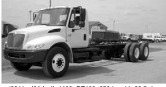
#3241 - '04 Int'l. 4400, DT466, 250 hp, 11x22.5 tires, (8) new recaps, 14F, 40R air ride, 5 spd. Allison w/PTO gear, 5.29 ratio, 256" WB, 188" CT, A/C, cruise, tilt, AM/FM/CD, susp. dump valve, 3/8 single frame, 26" of frame, call.