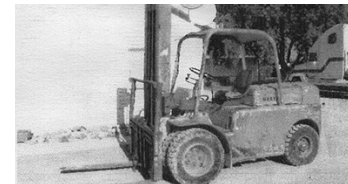
#Hyster Fork Lift - '69 Hyster H80C, 6-cyl. Continental F227, 3 spd. w/forward & rev., 12,150#, 46" forks, 6% back tilt, 8500# max. load at 18", 14' lift ht.

Visit our website for several more units! Over 80 units in stock! www.ThumbTruck.com