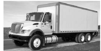
#3195 - '06 Int'l. 7600, 416,000 miles, ISM 305 hp, 10 spd. FRO11210C O.D., all new brakes, 24"x102"x91" van, 11x22.5 tires, 12F, 40R, 4.30 ratio, 260" WB, 191" C.T., call.