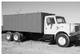
#3271 - '00 Int'l. 4900, 86,592 miles, DT466, 225 hp, new brakes & drums, 14.6F, 40R, Hend. beam, Allison auto. 653, 5.38 ratio, 156" C.T., 18" used box, frt. post hoist, from Tennessee, no rust, $41,000.