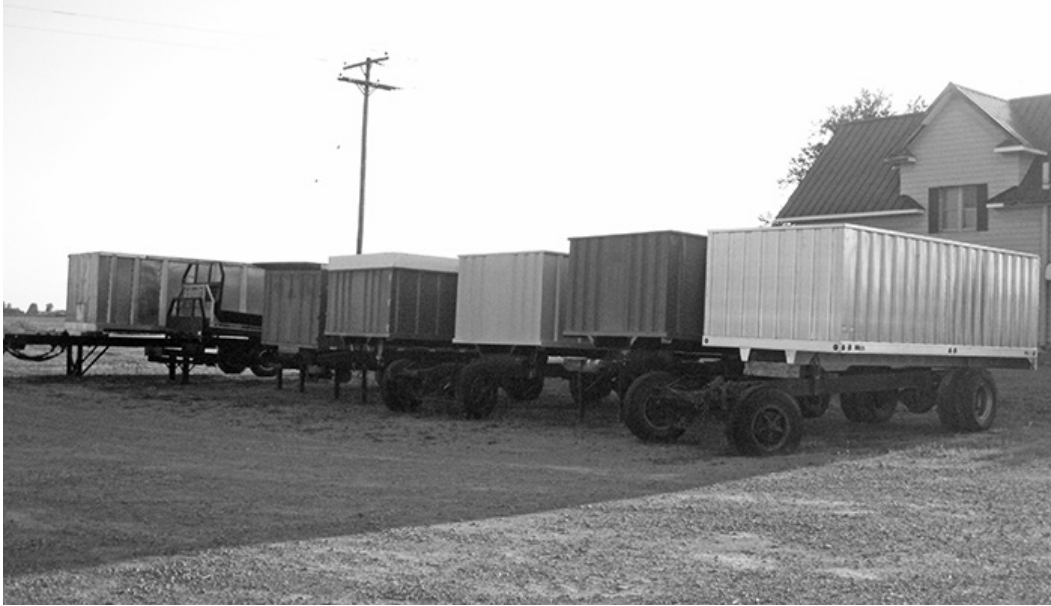
New & used farm bodies, (2) new 18' steel, (1) new 19' alum., used 18' steel, 8' alum. flat, 9' steel flat, 8' steel flat.