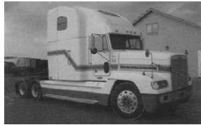
#2024 - '01 FTL FLD120, 12.7 Det., 430 hp, Super 10M w/Top 2 Autoshift, 95% air brakes, 12F, 40R, 236" WB, (4) super singles, $13,000.