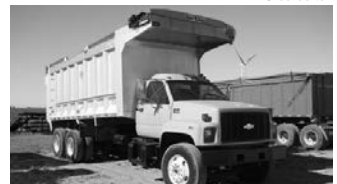
#3250 - '02 Chevy 8500, 3126 Cat, 300 hp, 8LL trans., 12F, 40R, Hend. beam, 3.90 ratio, 19"x96" MAC Alum box, 72" sides, plus 2x6 side boards, 78" high grain hole, air tailgate, slide & go tarp, GA truck, no rust, call.