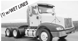
#3245 - (3) '05 Int'l. 9200i, 570,204 miles, C13, 380 hp, 10 spd., 80% brakes, 295R22 tires, 12F, 40R, air ride tdm., 52,000 GVW, 3.73 ratio, 164" WB, 95" C.T., A/C, cruise, Jake, very clean truck, AM-FM-CD, $30,000. (1) Matching w/wetlines.