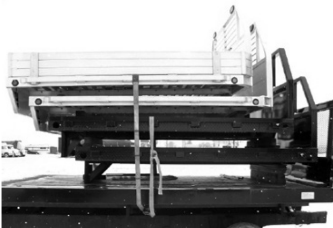
New & used flatbeds.