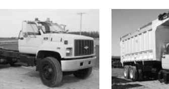
#3285 - '98 Chevy C8500, only 79,214 miles, Cat 3126 230 hp, brakes like new, 11x22.5 drives 80%, steering 80%, L40%, R75%, 14.6F, 34R Hend. beam, Allison auto 653 PTO gear, 4.33 ratio, CT 124, 15" frame, pintle hitch, air lines to back for trlr. brakes, driver's seat air ride, seats (3) people, $14,500.