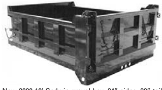
New 3000 10' Godwin gravel box, 24" sides, 30" tailgate & bulkhead, hoist kit dbl. arm under body, F.O.B. Pigeon, $6,950 plus tax & installation.