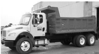
#3278 - '08 FTL M2, 341,000 miles, Cum. ISC, 330 hp, 16F, 315R22.5 frt. @ 75%, 40R, air ride, FROF12210C 10 spd., 4.33 ratio, new American 15' gravel box, all hi-tensile steel, 3/16 floor, 1-pc. 50,000 PSI, 44" sides, Ryder maintained, call.