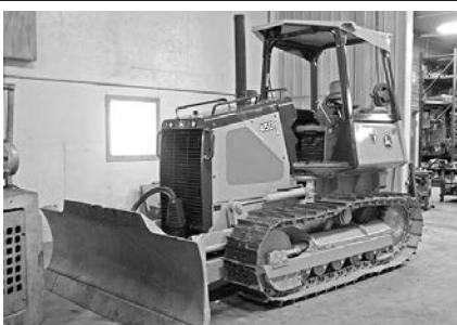
'05 Deere 450J LT 6-way dozer, open ROPS, new paint, 3300 hrs., new U/C, $43,000.

Heavy Equipment Rentals • Farm Drainage • Land Clearing Hubbardston, MI (989) 637-4731