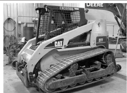
'03 Cat 277 track ldr., 2360 hrs., very good btm., hyd. quick tach, includes 80" bucket & aux. hyd., $19,500.