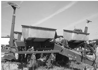
JD 7000, 4R30", dry, like new, $4,900.