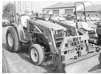
JD 4400 tractor/ldr. , 1496 hrs., $13,900.