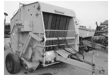
Vermeer 5051 round baler, 5'x5' bale, $3,900.