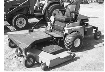
Woods 5250, zero turn, LC gas, 72" cut, $3,900.