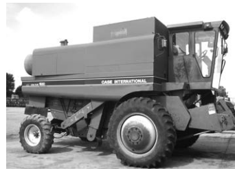
Case IH 1680 , duals, chopper, ran wheat this season, 3700 hrs., $29,500.