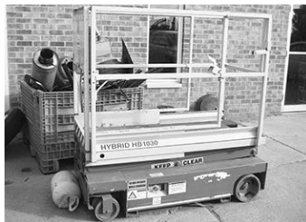
Hybrid HB1030 scissor lift , 16' working ht., $3,900.