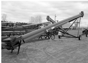
Easy-Vey 12"x51' belt conveyor, elec. motor, like new, $7,500.