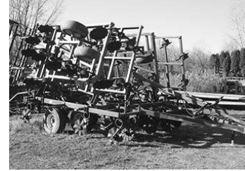
Salford 450 RTS, 24', $24,500.