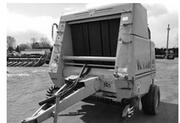
Vermeer 605K, 5x6 bale, 540 PTO, twine, crowder whls., $6,900.