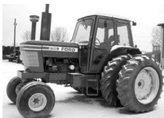
Ford 9700 , C/H/A, dual pwr., 3-pt., PTO, 2-rem., $10,900.