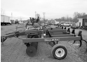
Glencoe 9-shank soil saver, #SS7200, $8,900.