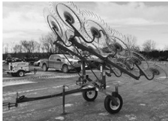
H&S CR10 whl. rake, very good cond., hyd. fold, $3,250.