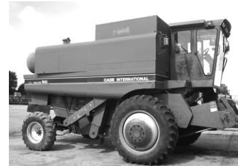
Case IH 1680, duals, chopper, ran wheat this season, 3700 hrs., $29,500.