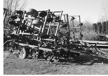
Salford 450 RTS, 24', $24,500.