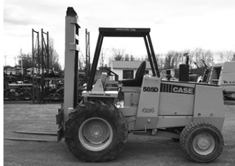
Case IH 585D, 4x4, 5000#, 21', $11,900.