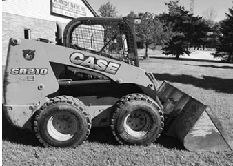
'14 Case SR210, $14,900.