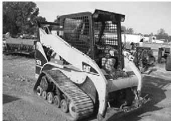
Cat 257B track skid steer, 3531 hrs., good runner, $16,500.