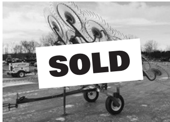
H&S CR10 whl. rake, very good cond., hyd. fold, $3,250.