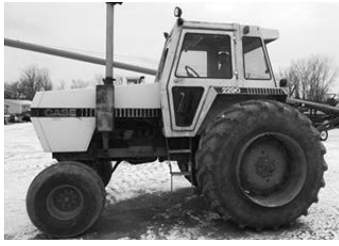
'80 Case 2290, 3-rem., 540-1000 PTO, new 20.8x38, 3832 hrs., $11,900.