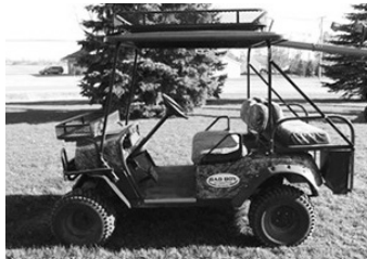
'06 Bad Boy BBAMS4, 4x4, winch, good cond., $5,900.