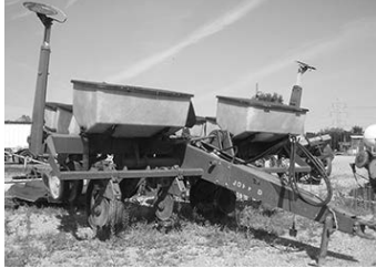
JD 7000, 4R30", dry, like new, $4,900.