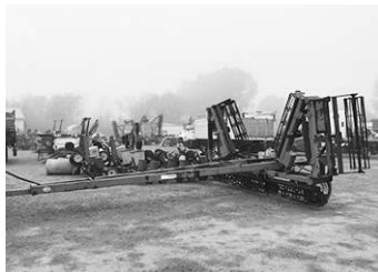
DMI 33' crumbler, $3,900.