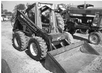
NH L785, $6,900.