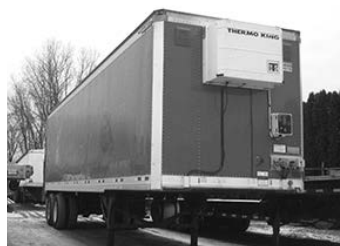
'10 G/Dane 33' reefer van, R.U., good cond., $4,900.