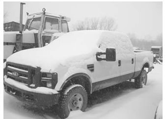
'08 Ford F350, 4-dr., 71,000 miles, $14,900.