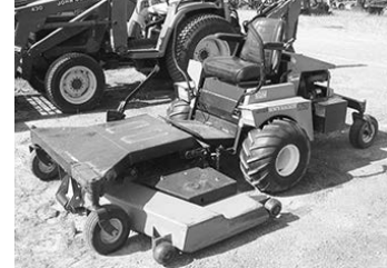
Woods 5250, zero turn, LC gas, 72" cut, $3,900.