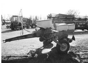
JD 7000 2R plateless, dry fert., very clean, $2,750.