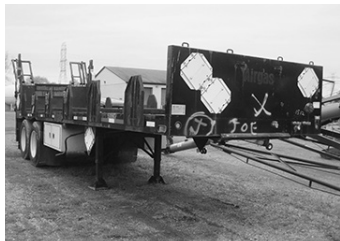
'92 J&B 28' flatbed, liftgate, alum. whls., 11R24.5, good trlr., $4,500.