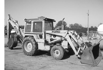
Ford 755B TLB, cab, runs great, $11,900.