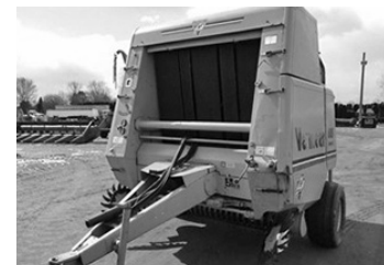
Vermeer 605K, 5x6 bale, 540 PTO, twine, crowder whls., $6,900.