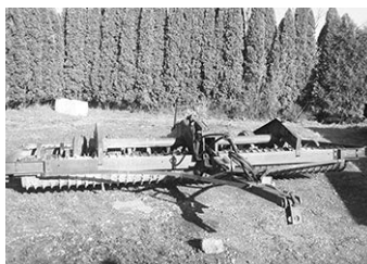
Brillion 15' cultimulcher, $2,750.

'10 Corn Husker 50' hopper btm., 4-axle, very clean, $29,500.