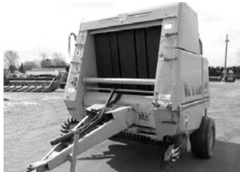
'94 Vermeer 605K, 5x6 bale, 540 PTO, twine, crowder whls., $6,900.