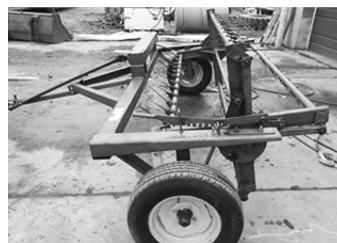
Pequea 710 tedder, works good, $1,750.