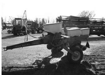
JD 7000 2R plateless, dry fert., very clean, $2,750.