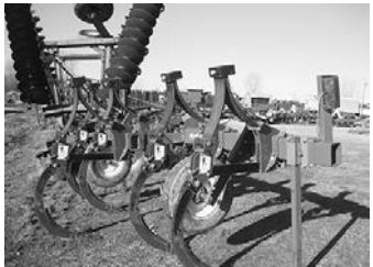
Brillion 5-shank compaction commander, like new, $4,900.