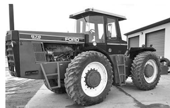
'91 Ford 876, 18.4x42 tires & duals, 4-rem., very clean, $24,500.