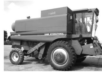
Case IH 1680, duals, chopper, ran wheat this season, 3700 hrs., $29,500.