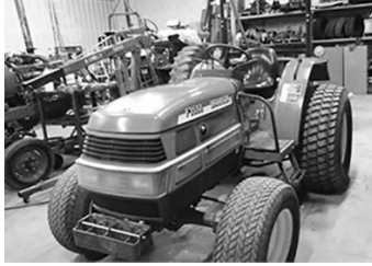
'99 Branson F3550, 4x4, turf tires, only 354 hrs., clean, $6,900.