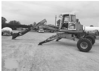
'02 Schaeff HS41 whl. excavator, 24" bucket, aux. hyd., $17,500.