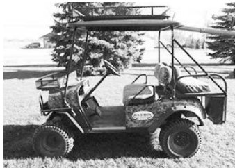
'06 Bad Boy BBAMS4, 4x4, winch, good cond., $5,900.