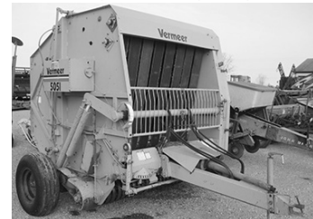
Vermeer 505I round baler, 5'x5' bale, $3,900.