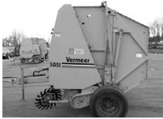
'88 Vermeer 5051 round baler, 5x5 bale, twine, crowder whls., $4,900.