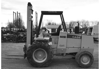
Case IH 585D, 4x4, 5000#, 21', $11,900.