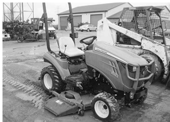
JD 1023E , 60D deck, hydro, 4x4, very clean, $8,900.