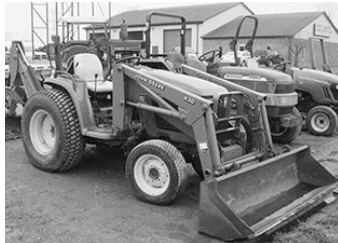
JD 4400, turf tires, 4x4, ldr., backhoe, 1490 hrs., $18,500.