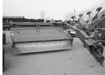
JD 920 discbine, 9'9" cut, $4,900.