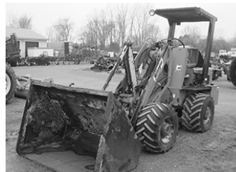
Wilmar Wrangler articulating ldr., JD dsl., runs great, $6,900.