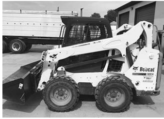
'14 Bobcat S590, 6100 hrs., exc. cond., $14,500.