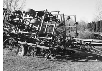
Salford 450 RTS, 24', $24,500.