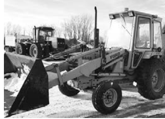
Ford 555B T/L/B, cab, 2800 hrs., ex-municipal machine, $11,900.