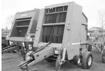
JD 430 baler, 4x6 bale, $4,900.