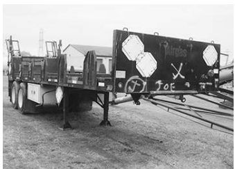
'92 J&B 28' flatbed, liftgate, alum. whls., 11R24.5, good trlr., $4,500.