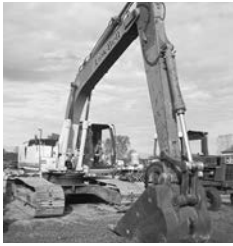
Linkbelt 3900 excavator, 70,000 lb., 13,000 hrs., runs & operates good, $19,500.