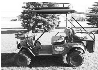
'06 Bad Boy BBAMS4, 4x4, winch, good cond., $5,900.