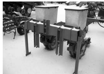
IH 800 2R planter , 3-pt., $1,200.