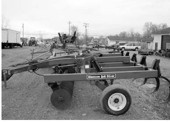
Glencoe 9-shank soil saver, #SS7200, $8,900.