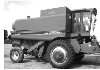
Case IH 1680, duals, chopper, ran wheat this season, 3700 hrs., $29,500.