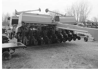
Great Plains 3N3020F, 30', 20" space, no-till, $29,500.