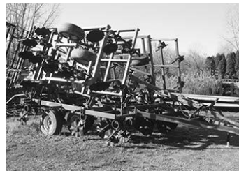
Salford 450 RTS , 24', $24,500.