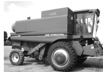
Case IH 1680, duals, chopper, ran wheat this season, 3700 hrs., $29,500.