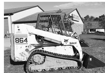
Bobcat 864 track skid steer, $11,900.

'10 Corn Husker 50' hopper btm., 4-axle, very clean, $29,500.