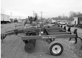
Glencoe 9-shank soil saver, #SS7200, $8,900.