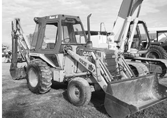
Case 580E T/L/B, cab, extend-a-hoe, 2WD, $9,500.