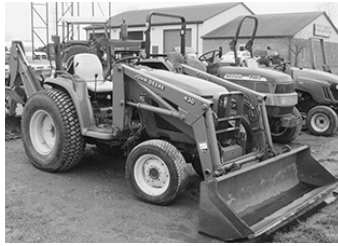
JD 4400, turf tires, 4x4, ldr., backhoe, 1490 hrs., $18,500.