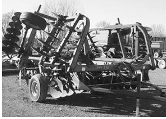
AC 18' rock flex disc, good blades, $5,900.