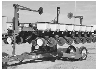
Kinze 3500 8R30" or 16R15", used (4) seasons, like new, $45,000.