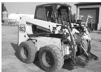
Bobcat 863, cab, A/C, heat, hi-flow hyd., 3360 hrs., $12,900.