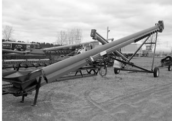
Easy-Vey 12"x51' belt conveyor, elec. motor, like new, $7,500.