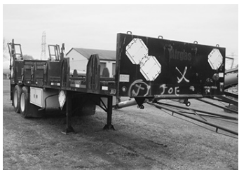
'92 J&B 28' flatbed, liftgate, alum. whls., 11R24.5, good trlr., $4,500.