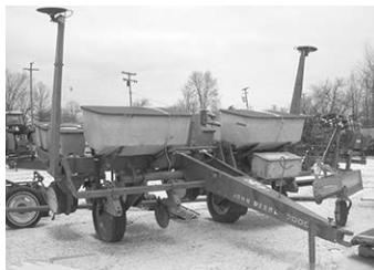
JD 7000 , 4R36", dry, very clean, $2,900.