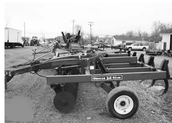
Glencoe SS7200 9-shank soil saver , very good, $8,900.