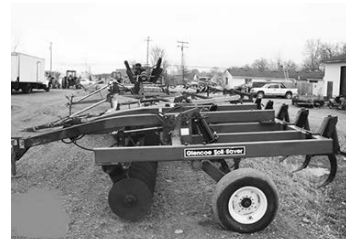
Glencoe SS7200 9-shank soil saver, very good, $8,900.