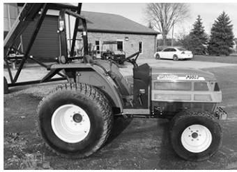
Branson F3550 , 4x4, 3-pt., PTO, 362 hrs., $6,900.