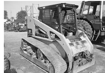
Cat 277 track skid steer, runs great, $13,500.