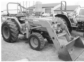
Kubota L4200 GST , 4x4, QA ldr., $9,500.