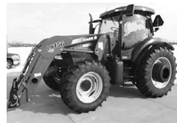
'05 Case IH MXU135, 18.4x38, ldr., bucket & forks, air seat, 4-rem., susp. cab, 565 hrs., like new, $89,500.