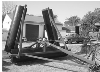
New Smyth 30' land roller, $15,900.