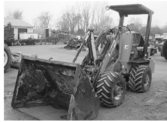
Wilmar Wrangler articulating ldr., JD dsl., runs great, $6,900.