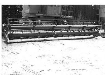
Harvest More 825 flex head, 25', fits Case IH combines, $9,500.