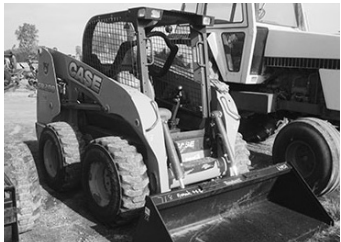
Case SR200, 8100 hrs., new bucket, $12,500.