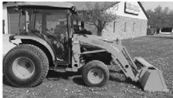
Kubota L3240, cab, A/C, heat, 500 hrs., ldr., 2-rem., like new, $23,500.