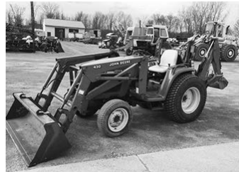
JD 4400 T/L/B, 1496 hrs., $18,000.