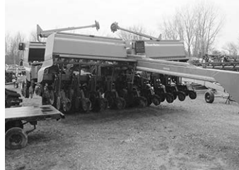
Great Plains 3N3020F, 30', 20" space, no-till, $29,500.