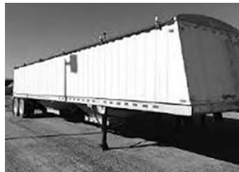
'96 Jet 40' hopper trlr., $9,500.