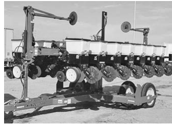
Kinze 3500 8R30" or 16R15", used (4) seasons, like new, $45,000.