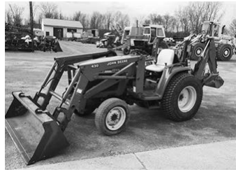
JD 4400 T/L/B, 1496 hrs., $18,000.