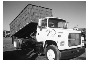
'95 Ford L8000, Cum. dsl., 6 spd., grain box, new hoist, $7,500.