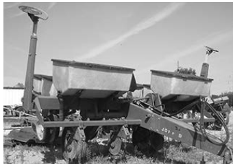
JD 7000, 4R30", dry, like new, $4,900.