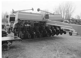
Great Plains 3N3020F , 30', 20" space, no-till, $29,500.