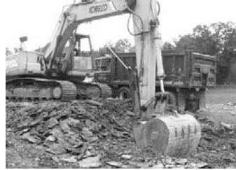
Kobelco SK150 excavator, 6700 hrs., hyd. thumb, runs great, $24,500.