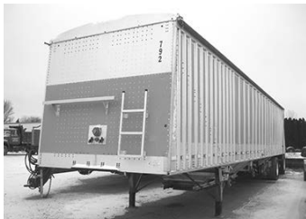
'10 Corn Husker 50' hopper btm., 4-axle, very clean, $29,500.