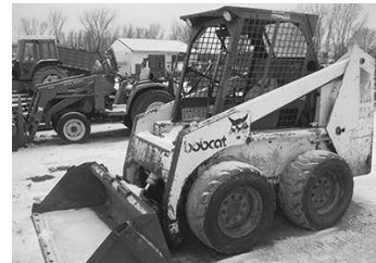
Bobcat 843, dsl., aux. hyd., runs & drives good, $7,500.