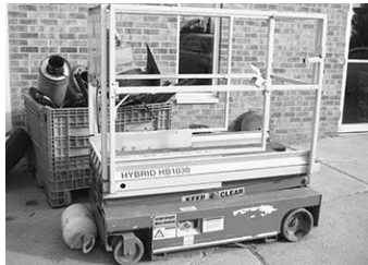
Hybrid HB1030 scissor lift, 16' working ht., $3,900.