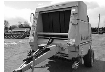
Vermeer 605K, 5x6 bale, 540 PTO, twine, crowder whls., $6,900.