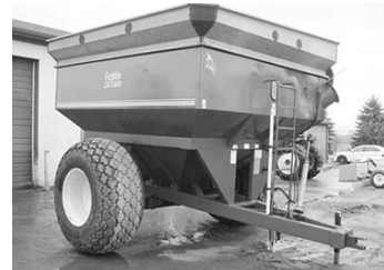
Ficklin CA15000 grain cart, 750-bu., corner auger, $7,900.