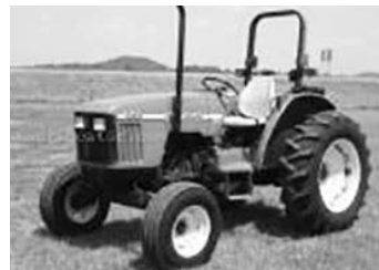
JD 5210 , 2-rem., $7,900.