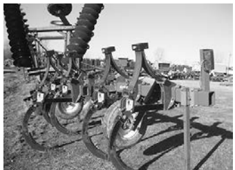
Brillion 5-shank compaction commander , like new, $4,900.