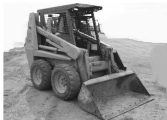
Case 1840 skid steer , Cum. dsl., runs & works good, $7,900.