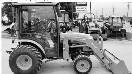
Kubota B3350, 4WD, hydro, 3-pt., PTO, $22,500.