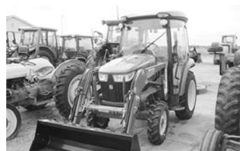
JD 3039R, 4x4, cab, A/C, heat, new Woods ldr., $19,500.