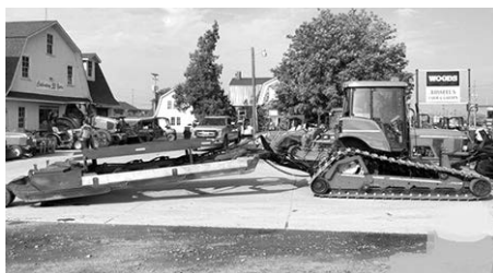
JD 6200 w/Gilbert trail grooming pkg., pwr. shift, 8' wide, 25" tracks, runs great, $19,500.