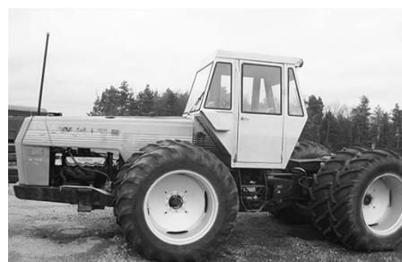
White 4-150, duals, 3-pt., PTO, $7,500.