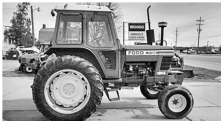
Ford 7700, cab, 93 hp, 540 PTO, 3-pt., 3-rem., $12,500.