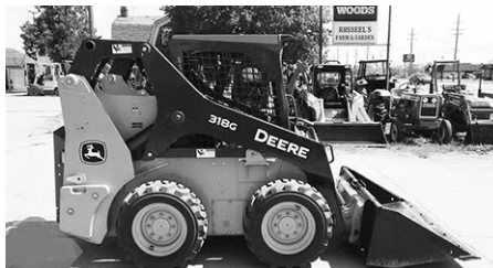
#5728 - '16 JD 318G skid steer, 66" bucket, 65 hrs., rear wts., $29,000.