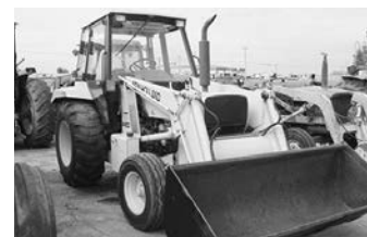
NH 445D, cab, ldr., $12,900.