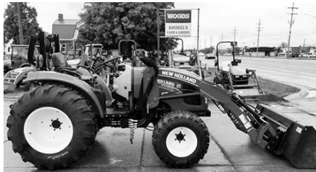
'16 NH Boomer 47, 4x4, w/NH 260TLA ldr., 8 hrs., $26,500.