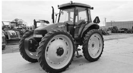
Case IH Farmall 95 tractor, 4-cyl. 90 hp dsl. eng., 4WD, 9.5R48, 540 PTO, 3-pt. hitch, manual trans., $35,000.