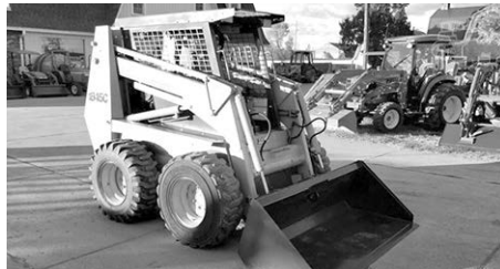
'00 Case 1845C skid steer, 904 hrs., original paint, Cum. eng., $19,500.