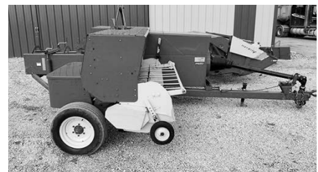
'14 NH BC 5060 square baler, 14x65 bale, 540 PTO, gauge whl., $12,900.