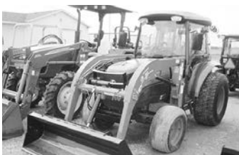
Kubota L4240, 4x4, cab, A/C, heat, new Woods ldr., 1203 hrs., $22,500.