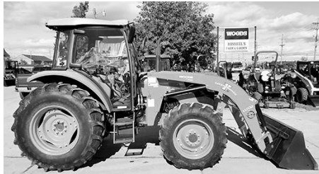
Kubota M9960, cab, A/C, heat, w/Woods LU132 ldr., 1832 hrs., hyd. shuttle, $38,000.