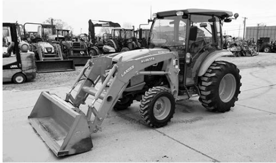
Kubota L4760, 4x4, cab, A/C, heat, hydro, w/Kubota LA1055 ldr., 230 hrs., $34,000.