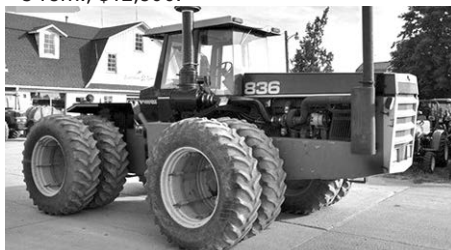
'85 Versatile 836, 210 hp, 18.4R38, 3-pt. duals, 4-rem., $19,500.