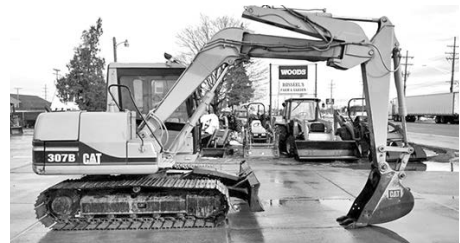
'99 Cat 307B excavator, 54 hp, dsl., 24" steel tracks, 2 spd. hydro, 5704 hrs., $27,500.