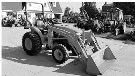
Kubota L3901, 4WD, hydro, 177 hrs., $19,000.