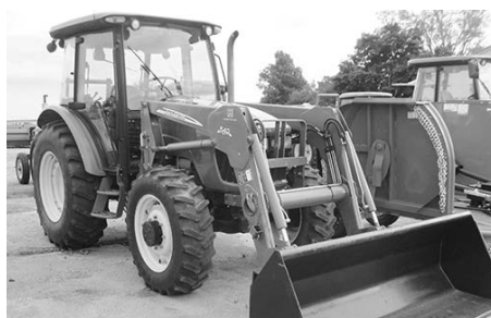
JD 5525, 4x4, cab, A/C, heat, ldr., 1388 hrs., shuttle, $45,000.

AgDirect. Simple. Fast. Flexible Financing.®