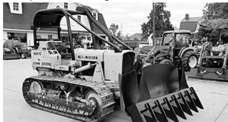
JD 450C crawler, 6-way blade, root rake, good unit, $15,000.