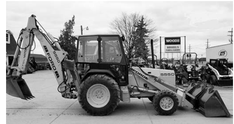
Ford 555D, cab, ldr., backhoe, 4x4, extend-a-hoe, $19,500.