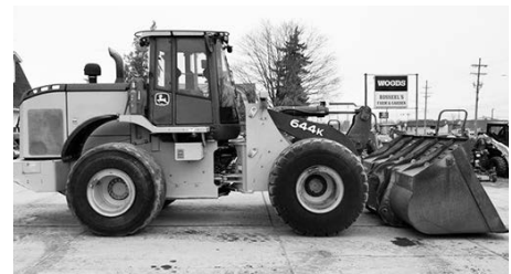
'14 JD 644K whl. ldr., 10' bucket, good unit, $75,000.