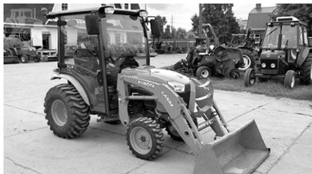
Kubota B3350, 4x4, cab, A/C, heat, hydro, 334 hrs., $22,500.