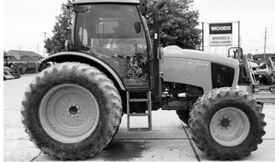
Kubota, 4WD, M135GX, 4197 hrs., pwr. shift, $37,500.