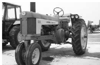
JD 530, NF, 3-pt., flat top fenders, new paint, $4,500.