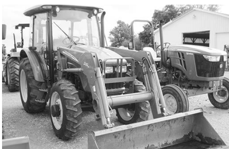
JD 5425, 4x4, cab, A/C, heat, ldr., shuttle, 2275 hrs., $35,000.