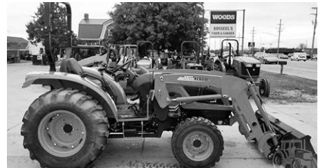
Kioti NX6010, 4x4, hydro, KL6010 ldr., 135 hrs., $25,500.