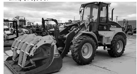
'10 JD 344J whl. ldr., $49,500.