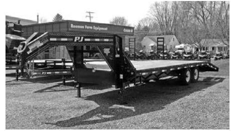
8-1/2'x26' Gooseneck, tool box, 14,000 GVW, 5' dovetail, (2) flip ramps, powder coat paint, sealed wire harness, $6,385.