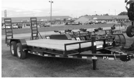
PJ trailer, 14,000 GVW, 83"x18, 2' dove w/(2) ramps.