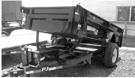
PJ Dump Trailer, 5K GVW, 6'x10'.