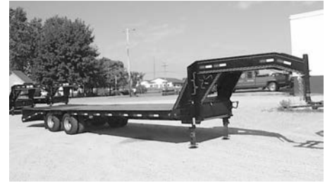
PJ trailer, 8-1/2'x32' gooseneck, toolbox, 25,000 GVW, 5' dove, Monster ramps.