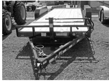
PJT6 tiltbed, 14,000 GVW, 20'x81"