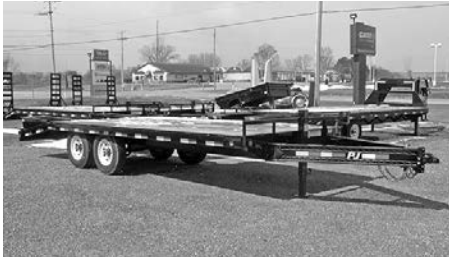
PJ trailer, deckover, 14,000 GVW, 8'x20', 4' dove w/(2) ramps.