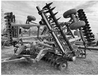
JD 2210, 32' field cultivator, $39,900.