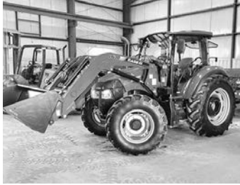
'16 Farmall 90C, cab, ldr., $62,900.