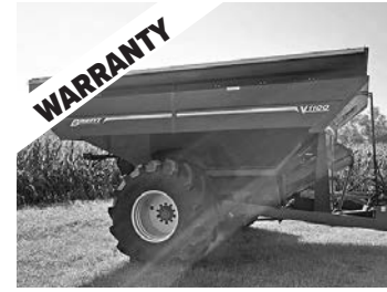
'20 Brent V-1100, tarp, scales, like new, $62,900.