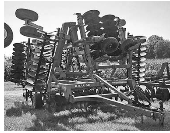
'08 Krause 8200, 38' w/ basket, $46,900.