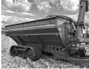
Brent Avalanche 1196, tracks, $69,900z