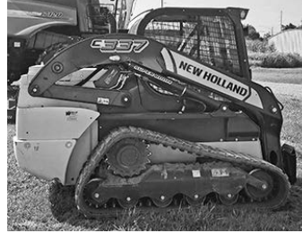
'21 NH C337, cab, EH, 3000# lift, $69,900.

JD 1775NT, 24R30", tracks, loaded, high speed, $229,900.