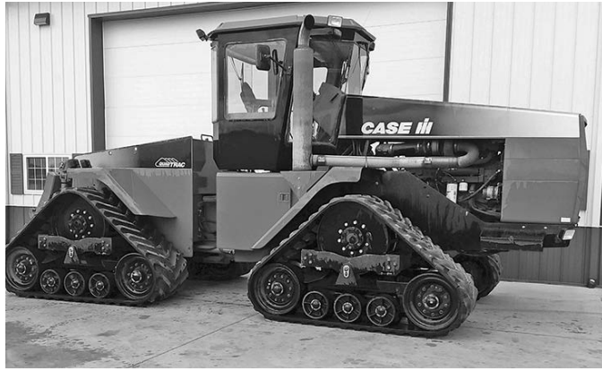
9380 Quadtrack , just came out of the field, completely loaded w/auto. steer, very good shape, 3-pt. hitch, 5303 hrs., serviced every year by Janson's Equipment.