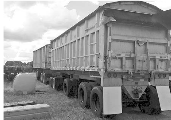
Doubles , (2) 28' alum. trlrs. w/roll tarps, Joe Dog/converter dolly, capable of hauling 2000-bu. of corn, RRR Supply Extra Super Slippery liner.