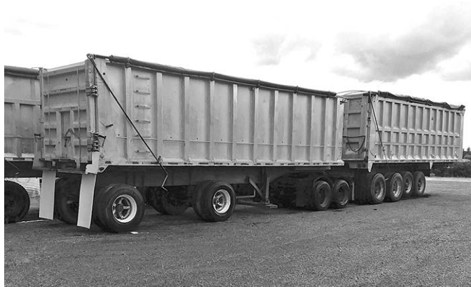
Doubles , (2) 28' alum. trlrs. w/roll tarps, Joe Dog/converter dolly lead & pup, capable of hauling 2000-bu. of corn, RRR Supply Extra Slippery liner.