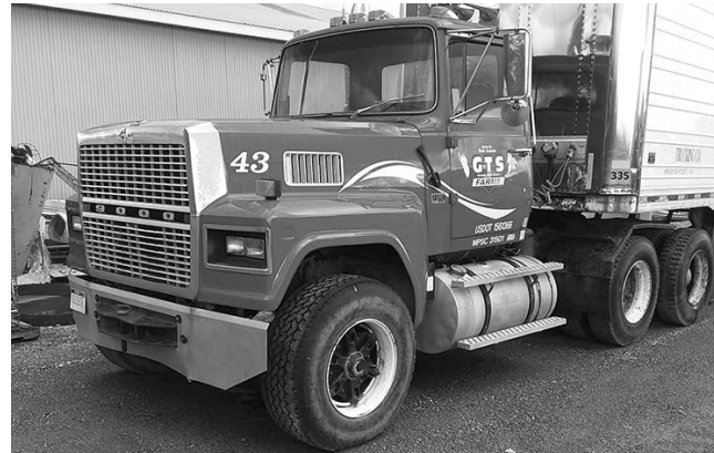
'89 Ford 9000 , less than 25,000 miles, reman. eng., 400 Cum., Michigan Special, 44R, wide frt. tires.