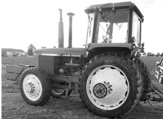
JD 4455 , FWA tractor w/duals, completely loaded, field ready, serviced every year by Tri County.