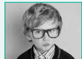
You know, you are right.