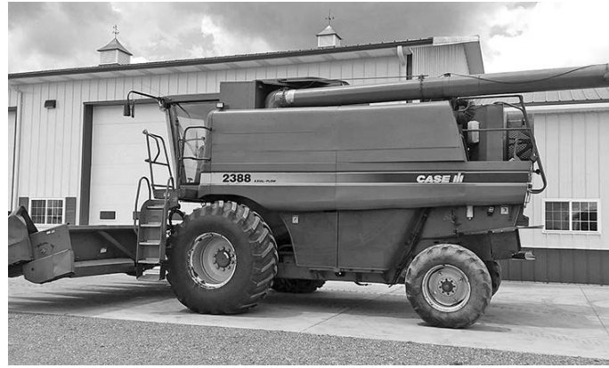
Case IH 2388 combine , completely loaded, brand new yield mon., rock trap, great shape, field ready, 2129 hrs., serviced every year by Janson's Equipment.