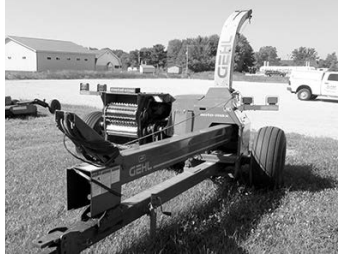
Gehl CB1285 chopper , 300 hp, rated w/corn processor, 1-owner, $10,500.