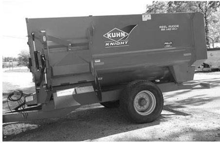
Kuhn Model RA 142 , 420 cu. ft., demo unit, w/scales & slide tray discharge.