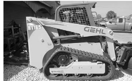
RT165, 68 hp, T-bar controls, rear wt., HXD tracks, 2 spd., self-leveling, $35,350.