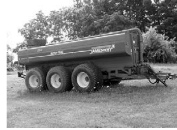
(2) Jamesway Ultra-Trac 7400-gal. tankers , w/in-tank agitation, both w/new tires under 1 year ago, auto. steering, huge industrial brakes, lift arms for injectors, less injectors, (1) $37,500, (1) $35,000.