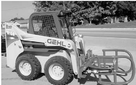
R150, 46 hp, T-bar controls, side windows & heat, self-leveling, rear wt., 10x15.5 tires, $30,425.