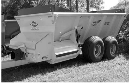
SLC126 , 2600-gal. V-btm., 19Lx16.1 tires, 1000 PTO, splash guards frt. & rear, $40,750.