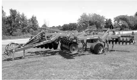
New 4511-11 Sunflower 11-shank disc ripper disc.