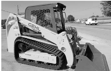
RT175 Gen 3, 68 hp, joystick control/dual hand, Deluxe air seat, self-leveling, rear wt., all season tracks, boom flat, $43,175.