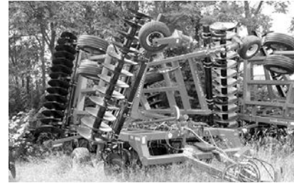
New 1436-27 (E) 25.5' Sunflower disc.

PELL'S FARM • LAWN • CONSTRUCTION "SERVICE IS OUR SALESMAN"