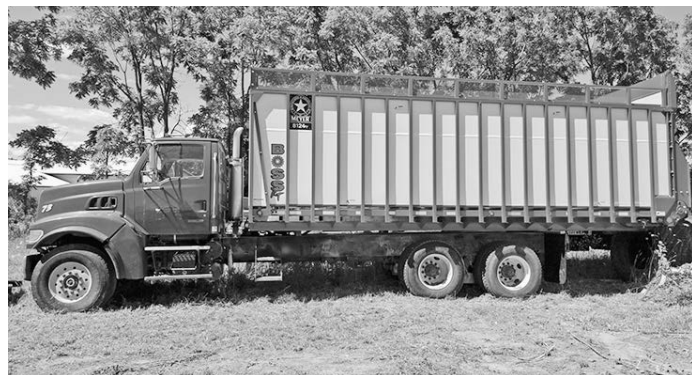
New Meyer 8124RT 24' box , w/RT drive, ext. extra road light pkg., being mtd. on '03 Sterling LT9500 truck, 6 cyl. Cat eng., auto., call.