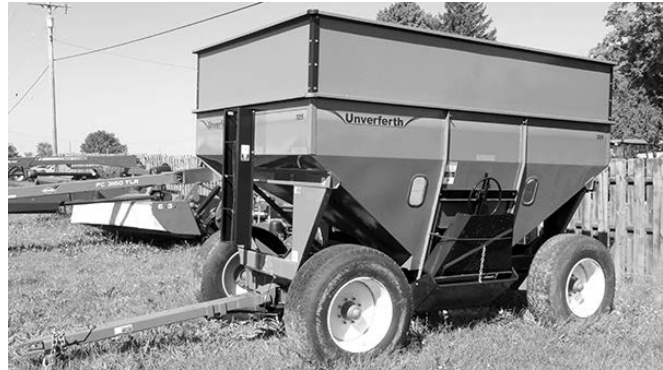
Unverferth 325 gravity wagon w/ext. on 385X, 22.5 tires, lights, $7,950.