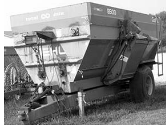
Gehl MF8500 , 500 cu. ft., (4) auger, very nice, $8,950.