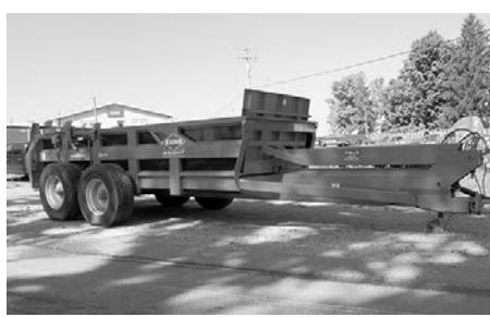
Pro Push model 2044 , 540 PTO, upper beater, sequences valve, $26,625.