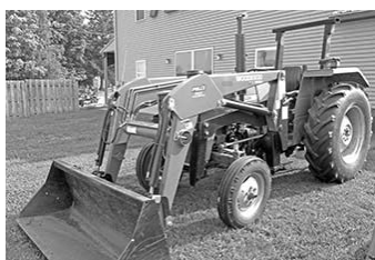
MF 231 , 1202 hrs., w/ldr., 38 eng. hp, $12,950.