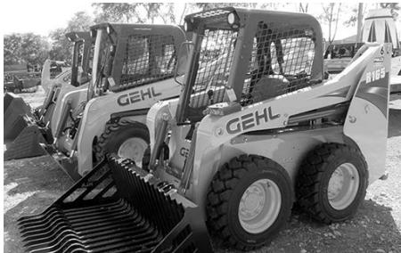
R165, 69 hp, T-bar control, 1 spd., susp. seat, rear wt., 10x16.5 tires, $30,500.