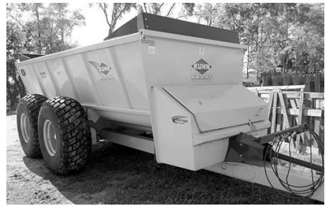
SLC141 , 4100-gal. V-btm., 23.1x26 flotation tires, 1000 CV PTO, splash frt. & rear, $55,000.

PELL'S FARM-LAWN-CONSTRUCTION "SERVICE IS OUR SALESMAN"