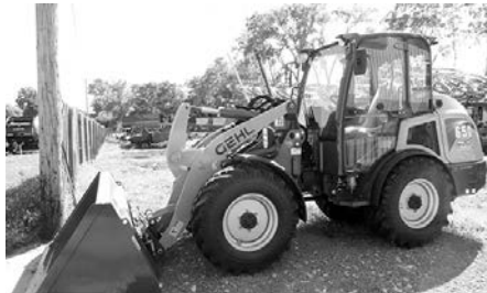
AL650, 64 hp, 3 spd., cab, A/C, heat, Deluxe air ride susp., radio, Powertach, $62,375.