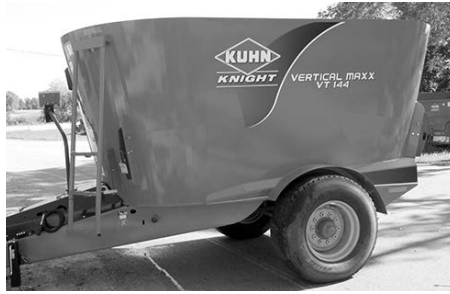
Kuhn Model VT 144 , 440 cu. ft., twin screw, scales, slide tray.