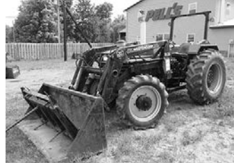
Long 2610 , 64 hp, w/bale spear, 1-owner, only 1125 hrs., $11,950.