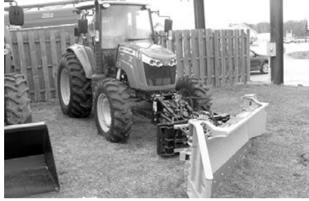
NEW MF 4610, 4WD, Cab, HLA Snow Wing.