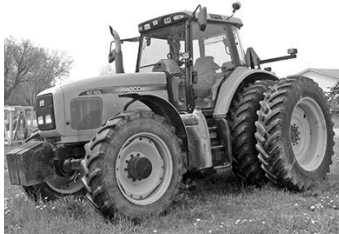
Agco RT165A , 180 hp, Dyna 6 trans., 1-owner, completely serviced, new rear tires, very nice, $49,000.