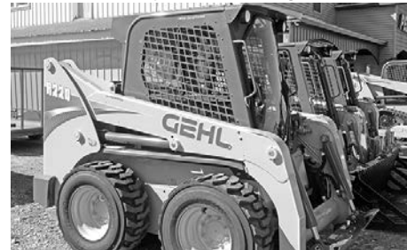
R220, 72 hp, cab w/heat & A/C, 2 spd., joystick controls, air seat, Powertach, radio, boom flot, 12x16.5 10-ply HD tires, $42,250.

PELL'S FARM • LAWN • CONSTRUCTION "SERVICE IS OUR SALESMAN"