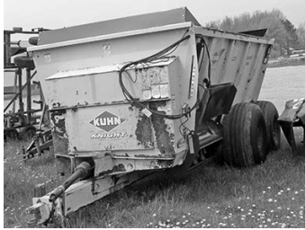
Kuhn/Knight 8132 , 3200-gal., V-btm., 1-owner, been through shop, flotation tires, $19,500.