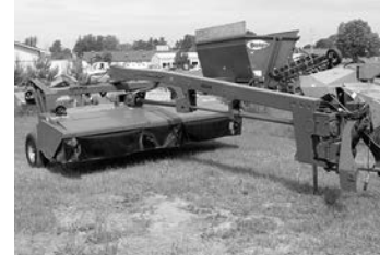
Agco Hesston model 3312 disc mower conditioner , 1-owner, low acres, $12,500.