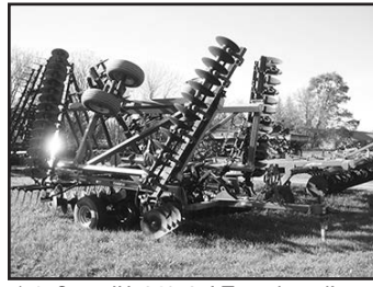
'12 Case IH 340 31' Tru tdm. disc., cushion gang, 22" 6.5 mm blades, hyd hitch, opt. gang brgs., 3-bar coil tine.