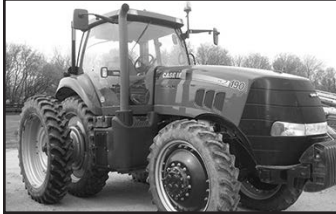
'14 Case IH Magnum 190, cab, A/C, heat, 320/85R38, 380/90R50 duals, 3-pt., 540-1000 PTO, MC pump, HCDB, 4-rem., MFD, fenders, 1865 hrs.