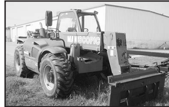
'04 Manitou 940L-120SU, 29'6" lift height, 8000# cap., 123 hp, 4F, 4R, 17.5LR24R4 tires, 4186 hrs.