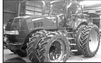
'10 Case IH Magnum 275, 380/85R38 duals, 480/80R50 duals, 3-pt., Q.H., 540 & 1000 PTO, 4-rem., 2440 hrs.