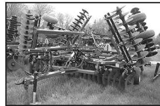
'12 Case IH 370 28' Tru tdm. disc, cushion gang, 24" 6.5mm blades, hyd. hitch.