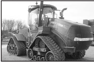
'13 Case IH 500QT, 30" tracks, diff. locks, HC pump, HC draw bar, 6-rem., semi-active seat, instruct. seat, HID light pkg., hyd. ret., radar, 970 hrs.