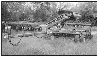
'12 Case IH 370 28' Tru tdm. disc, cushion gang, 22" 6.5 mm blades, hyd hitch, opt. gang brgs., 3-bar coil tine.