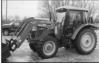
'10 MF 2660 HD, cab, A/C, heat, AWD, 12.4x24, 15.5x38, 3-pt., 540 PTO, 2-rem., 8x8 C/S, DL260 ldr., 84" Q.A. bucket, 1105 hrs.