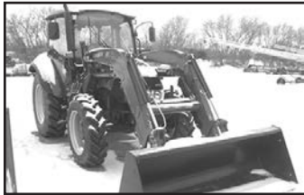
'15 Case IH Farmall 75C, cab, A/C, heat, AWD, 11.2R24, 16.9R30, air seat, 12x12 pwr. shuttle, 2-rem., L620 ldr., w/84" bucket, 625 hrs.