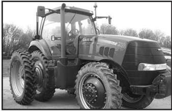
'11 Case IH Magnum 190PS, deluxe cab, MFD, 320/85R38, 380/90R50 duals, 3-pt., 540/1000, 4-rem., Auto Guide ready, FWF w/(10) wts., instructor seat, radar, AM-FM-CD, H.D. drawbar, beacon, HID center lamp, 1705 hrs.