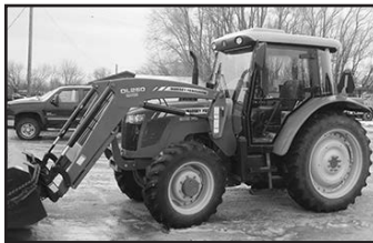
'10 MF 2660 HD, cab, A/C, heat, AWD, 12.4x24, 15.5x38, 3-pt., 540 PTO, 2-rem., 8x8 C/S, DL260 ldr., 84" Q.A. bucket, 1105 hrs.