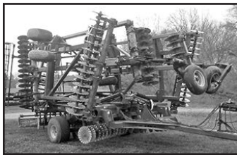
'12 Case IH 330 42' Tru-Tdm. turbo w/rear mtd. reel.