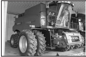
'14 Case IH 6140, cab, A/C, heat, AWD, 600/65R28, 520/85R42 duals, LT, ST, SC, tank covers, Auto Guide ready, 2 spd. hydro, AFS Pro 700 mon., Y&M logging, 720 eng. & 515 sep. hrs.