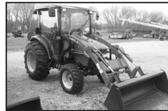
'14 Case IH Farmall 45B, CVT, w/L350 ldr., cab, A/C, heat, 10x16.5 R4, 17.5Lx24 R4, mid-PTO, 1-rem., AM-FM-WB, 72" bucket, 165 hrs.