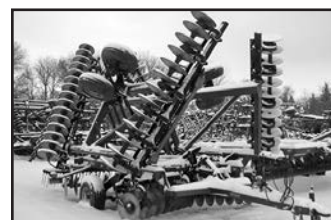
'12 Case IH 340 31' Tru tdm. disc, cushion gang, 22" 6.5 mm blades, hyd hitch, opt. gang brgs., 3-bar coil tine.