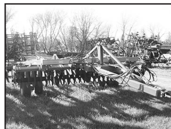
'08 Landoll 2110 13-shank coulter chisel, auto., Unverferth S-tine leveler w/buster bar.

BAD AXE, M-142 East • (989) 269-6449 Website: www.osentoskifarmequipment.com