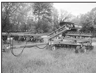
'07 Unverferth 220 26' dbl. basket w/spike attachment.