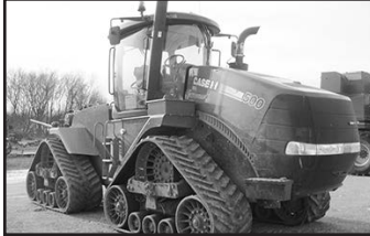
'13 Case IH 500QT, 30" tracks, diff. locks, HC pump, HC draw bar, 6-rem., semi-active seat, instruct. seat, HID light pkg., hyd. ret., radar, 1151 hrs.