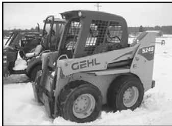
'12 Gehl 5240E, ROPS, T-bar, man. coupler, 12x16.5, counter wt., no bucket, 1692 hrs.