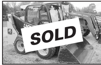
'12 JCB 155 skid ldr., cab, A/C, heat, BOSSKAV 10x16.5, hyd. coupler, work lights, 2 spd., foot throttles, AM-FM-WB, H.D. 78" bucket, 803 hrs.