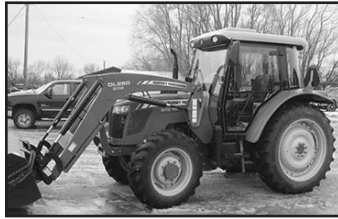
'10 MF 2660 HD, cab, A/C, heat, AWD, 12.4x24, 15.5x38, 3-pt., 540 PTO, 2-rem., 8x8 C/S, DL260 ldr., 84" Q.A. bucket, 1105 hrs.