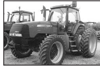
'99 Case IH MX240, 380/85R34, 480/80R46 duals, 3-pt., 1000 PTO, 5-rem., H.D. DB wt. frame, instruct. seat, radar, 7205 hrs.