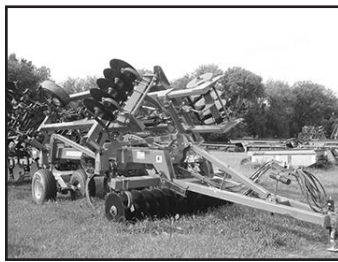
'09 Krause 4850-18 11-shank Dominator, parabolic, rear basket leveler, new frt. blades/brgs.