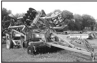
'12 Case IH 370 28' Tru tdm. disc, cushion gang, 24" 6.5mm blades, hyd. hitch.