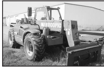
'04 Manitou 940L-120SU, 29'6" lift height, 8000# cap., 123 hp, 4F, 4R, 17.5LR24R4 tires, 4186 hrs.