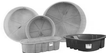
Poly Stock Tanks