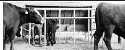
Calf Creep Feeders