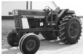
'79 IH 986, 2-hyd., 540/1000 PTO, 3-pt., never had a T/A, $10,500.