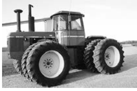
'82 JD 8640, 20.8x38 rubber, 3-hyd., 3-pt., PTO, quick hitch, $24,500.