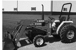
'89 Ford 1520, MFWD, hydro, 3-pt., PTO, 1-hyd., PTO ldr., $9,500.