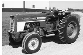
'78 IH 574, dsl., 14.9x28 tires, 1-hyd., 3-pt., PTO, one-owner, $6,750.