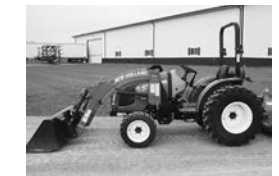
'15 H Workmaster 33, 46 hrs., MFWD, warranty till '18, hydro, ldr., 3-pt., PTO, $19,750.