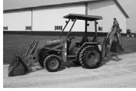
'97 Kubota L35 ldr. backhoe, PTO, 3-pt., 4x4, manual trans. w/shuttle, 2646 hrs., nice unit, $21,750.