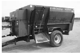
Alfa-Lava Agri 285 mixer wagon, magnet tray, works good, $4,250.