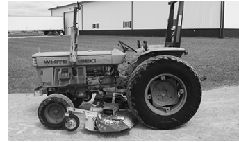
'81 White 2-30, PTO, 72" Woods belly mower, dsl., $3,000.