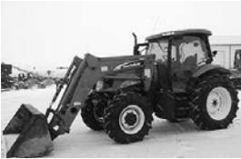
'06 NH TS115A, MFWD, quick attach ldr., 18.4x34 tires, new 14.9x24 frt. tires, L.H. shuttle rev., $43,500.