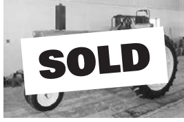
'60 JD 530, recently restored, 3-pt., PS, 13.6x38 tires, rear whl. wts., very nice, $7,850.