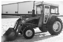
'74 JD 1830, w/JD 175 ldr., 3-pt., PTO, 2-hyd., cab, original paint, 660 hrs., $12,500.