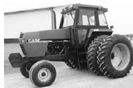
'85 Case 2096, 18.4x38 rear rubber, duals, 2-hyd., 540/1000 PTO, pwr. shift, frt. wts., $14,000.