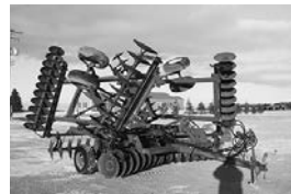
IH 3900 disc, one-owner, 23', folding wings, $10,500.