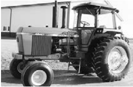
'78 JD 4640, quad, 20.8x38 Firestone, 23", 3-hyd., 3-pt., new paint, new cab int., $21,000.