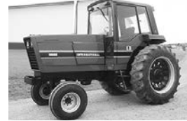
'81 IH 3688, 2-hyds., 540/1000 PTO, R134 A/C, new paint, sharp, $18,500.