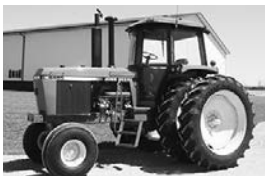
'90 JD 4455, one-owner, 3-hyd., pwr. shift, 3-pt., quick hitch, 6345 hrs., 14.9x46 rubber, new paint, new cab int., $42,500.