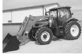
'06 NH TS115A, MFWD, quick attach ldr., 18.4x34 tires, new 14.9x24 ft. tires, L.H. shuttle rev., $43,500.