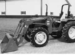
'09 JD 5055E, 553 JD ldr., joystick, 3-pt., 1-hyd., PTO, $24,750.