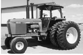
'81 JD 4640, quad, 3-hyd., 3-pt., PTO, 20.8x38, duals, one-owner, one-of-a-kind, very nice, $22,500.