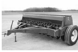
IH 5100 drill, press whls., dbl. disc openers, $4,250.