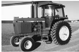
'85 JD 4450, quad, 5600 hrs., 2-hyd., 3-pt., PTO, 18.4x38 Firestone 23", very sharp tractor, original paint, $33,500.