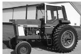
'76 IH 886, 18.4x38 rubber, new paint, new cab int., A/C, heat, very sharp, $14,000.