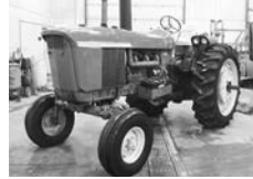
'63 JD 4010, dsl., synchro trans., 2-hyd., 3-pt., PTO, 15.5x38 rubber, $8,000.