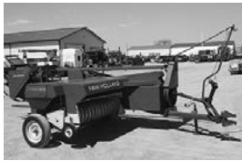
NH 273 baler twine tie, 54A thrower, very nice, $2,650.