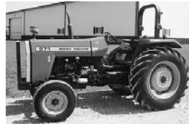
MF 271, dsl., 2-hyd., PTO, ROPS, one-owner, 2700 hrs., $12,000.