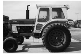
'73 IH 1066, 2-hyd., 540/1000 PTO, good T/A, IH cab w/A/C, 18.4x38 Firestone 23" tires, 85%, $9,750.