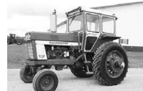
'71 IH 966, 16.9x38 rubber, 70%, Hiniker cab, 9-bolt hubs, 540/1000 PTO, good T/A, shows 4107 hrs., no blow by, $11,750.