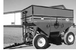
J&M 385SD gravity wagon, slip plate, disc brakes like new, 11R22.5 rubber, $7,000.