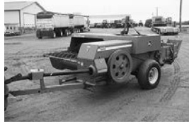
'02 JD 348 baler, twine, chute, nice paint, low use, $7,800.