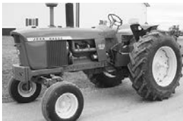
'63 JD 4010, dsl., 2-hyd., 3-pt., PTO, new paint, sharp, new paint, new int., new seat, $9,500.