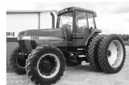
'95 Case IH 7250, new eng. o'haul w/ paperwork, new paint, 14.9x46 rubber, 3-hyds., 3-pt., PTO, 10-bolt duals, sharp, $47,500.