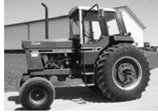
'79 IH 1486, reman eng., good T/A, 540/1000 PTO, 2-hyd., quick hitch, $16,000.