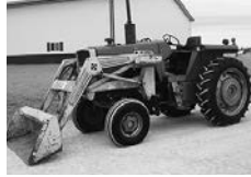
MF 1085, w/Dunham Lehr ldr., material bucket, Perkins dsl., 3-pt., PTO, 2-hyd., $8,750.