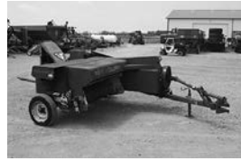
NH 273 baler, local trade, chute, 540 PTO, $1,400.