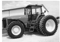
'01 JD 8410, 4-hyd., 3-pt., PTO, new 20.8x42 rear rubber inside, new frt. rubber, new paint, sharp, $60,000.