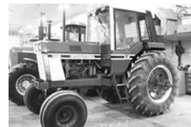
'76 IH 1486, local trade, good T/A, tight steering, new paint, new cab int., new frt. tires, 3-hyd., 540/1000 PTO, 3-pt., $16,500.