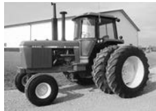
'81 JD 4440, 2-hyds., quad, 540/1000 PTO, 18.4x38 rubber, duals, $24,500.