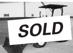
Ford 1920, manual trans., shuttle, ldr., 3-pt., PTO, MFWD, $9,500.