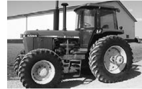
'84 JD 4450, MFWD, 20.8x38 rubber, 10-bolt hubs & duals, frt. fenders, PS, 2-hyd., 3-pt., 540/1000 PTO, $33,500.