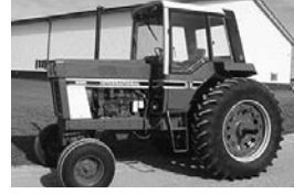
'76 IH 886, 18.4x38 rubber, new paint, new cab int., A/C, heat, very sharp, $14,000.