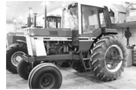
'76 IH 1486, local trade, good T/A, tight steering, new paint, new cab int., new frt. tires, 3-hyd., 540/1000 PTO, 3-pt., $16,500.