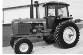
'85 JD 4450, PS, 3-hyd., 3-pt., PTO, 18.4x38 rubber, 6600 hrs., $32,500.