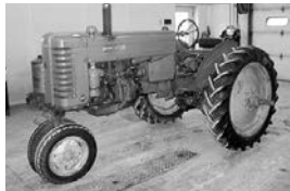
'50 JD MT, 1-owner, all orig., 10x34 tires, PTO, lights, very straight, $4,500.