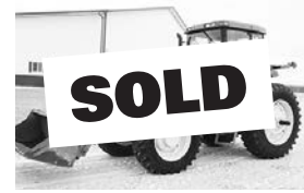
'94 JD 7600, MFWD, w/740 ldr., 8' material bucket, 3-hyd., 540/1000 PTO, pwr. quad trans., 6800 hrs., 1500 hrs. on rblt. eng., $44,500.