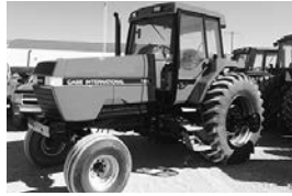
'90 Case IH 7130, 20.8x38 rubber, axle duals, PD, big 1000 PTO, frt. wt. bracket, new paint, new cab int., recent reman eng., $28,000.