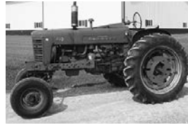
'55 Farmall 400, WF, PS, 2-pt. hitch, 1-hyd., T/A, PTO, rear whl. wts., $5,350.