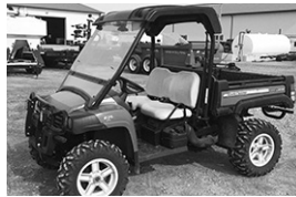
'12 JD Gator 875i, 4WD, 3000 miles, canopy, windshield, $8,950.