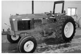
'90 JD 2355, 2WD, all original, 1-hyd., 3-pt., PTO, 3977 hrs., new rear tires, $13,000.