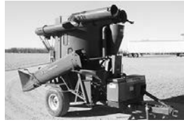
Case IH 1250 grinder mixer, long auger, scales, nice, $7,500.