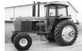
'81 JD 4640 quad, 3-hyds., 3-pt., PTO, new cab int., 18.4x42 rubber, $19,500.