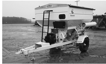
'90 Unverferth 150 weigh wagon, $3,650.