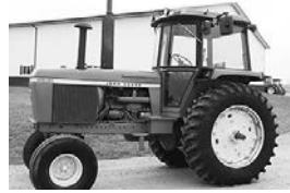
'74 JD 4430, 18.4x38 rubber, 90%, 2-hyds., 3-pt., PTO, synchro trans., diff. lock, ISO couplers, new interior, $16,500.