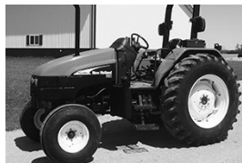
'03 NH TL 100, 18.4x34 rubber, shuttle trans., 2-hyd., 3-pt., PTO, new alt. & battery, new frt. tires, 2331 hrs., $15,750.