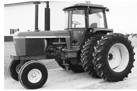
'77 JD 4430, 18.4x38 tires, w/duals, quad, 2-hyds., 3-pt., 540/1000 PTO, quick hitch, $18,500.