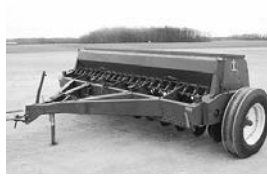
IH 5100 drill, press whls., dbl. disc openers, $4,250.