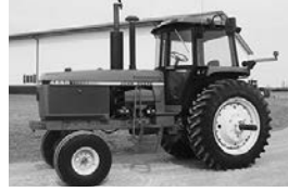
'83 JD 4650, 2-hyds., pwr. beyond, PTO, quick hitch, 18.4x42, pwr. shift, very nice, recent o'haul, $27,500.