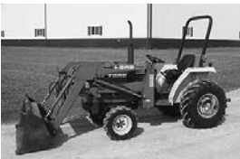
'89 Ford 1520, MFWD, hydro, 3-pt., PTO, 1-hyd., PTO ldr., $9,500.