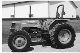
'07 Kubota M8200, one-owner, dsl., 3600 hrs., MFWD, new frt. tires, shuttle trans., L.H. rev., new seat, $16,750.