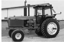
'83 JD 4650, 2-hyds., pwr. beyond, PTO, quick hitch, 18.4x42, pwr. shift, very nice, recent o'haul, $27,500.