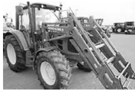
'09 JD 6230, 16.9x30 rear tires, 673 ldr., pwr. quad plus trans., L.H. rev., frt. fenders, $45,000.