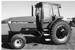
'91 Case 7140, PS, 4 spd. rev., 3-hyd., PTO, 3-pt., 18.4x42 rubber, new paint, $30,000.