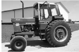
'79 IH 1486, reman eng., good T/A, 540/1000 PTO, 2-hyd., quick hitch, $16,000.