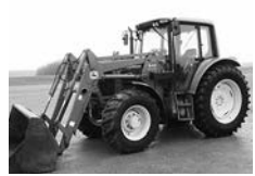
'03 JD 6420, 2-hyd., 640 ldr., 3-pt., PTO, L.H. rev., $39,750.