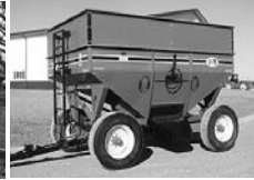
J&M 385SD gravity wagon, slip plate, disc brakes like new, 11R22.5 rubber, $7,000.