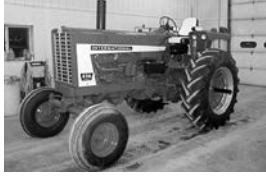
'68 IH 856 dsl., 2-hyd., 540/1000 PTO, new 18.4x34 rubber, new seat, new paint, very sharp, $12,500.