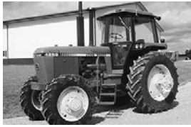
'84 JD 4250, MFWD, pwr. shift, 18.4x38 tires, 3-hyd., 540/1000 PTO, hitch, new paint, new cab int., $34,500.