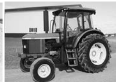
'05 JD 6403, 18.4x34, 98 hp, 3-pt., PTO, 2-hyd., 6579 hrs., $21,500.