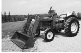
JD 1120 w/175 JD ldr., 3-pt., PTO, 51 hp, 3-cyl. dsl., 1-hyd., $8,750.