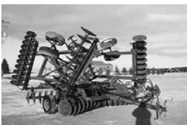
IH 3900 disc, one-owner, 23', folding wings, $10,500.