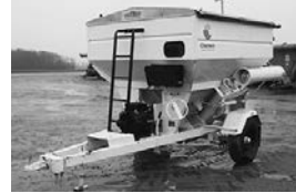
'90 Unverferth 150 weigh wagon, $3,650.