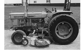
'81 White 2-30, PTO, 72" Woods belly mower, dsl., $3,000.