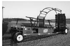
262PR02 Merco bale wrapper, 4-film disp., 20 hp Honda, dual whl. drive, wraps up to 6'6" round bales & 7' square bales, $31,500.