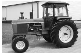
'77 JD 4230, 5100 hrs., A/C, quad, 2-hyd., PTO, 3-pt., 20.8x38 rubber, $18,500.