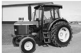
'05 JD 6403, 18.4x34, 98 hp, 3-pt., PTO, 2-hyd., 6579 hrs., $21,500.