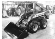
'09 NH LS160, 4000 hrs., ran through shop, new 72" bucket, nice unit, $14,250.