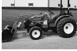
'15 NH Workmaster 35, w/ldr., hydro, 40 hrs., warranty til 2018, $18,500.