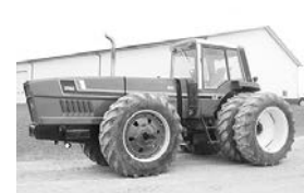
'80 IH 3788, 18.4x38 rubber, duals on rear, 3-pt., PTO, runs nice, no T/A, $12,500.