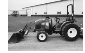
'15 H Workmaster 33, 46 hrs., MFWD, warranty till '18, hydro, ldr., 3-pt., PTO, $18,500.