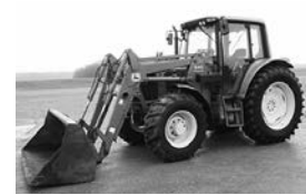
'03 JD 6420, 2-hyd., 640 ldr., 3-pt., PTO, L.H. rev., $39,750.