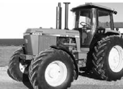
'87 JD 4450, pwr. shift, 2-hyds., 3-pt., 540/1000 PTO, new cab int., new paint, nice tractor, $34,500.