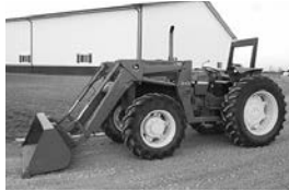
'88 JD 2555, MFWD, w/245 ldr., quick attach, new paint, $26,500.