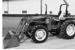
'09 JD 5055E, 553 JD ldr., joystick, 3-pt., 1-hyd., PTO, $23,500.