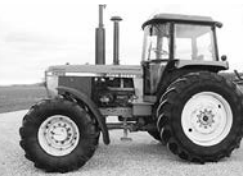
'89 JD 4255, MFWD, new cab int., 2-hyd., pwr. shift, 540/1000 PTO, sharp tractor, $32,500.