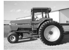
'87 Case IH 7120, 4-hyd., 540/1000 PTO, 18.4x42 rubber, duals, original paint, $32,500.