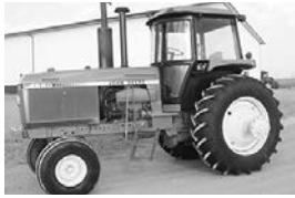
'85 JD 4850, pwr. shift, 3-pt., PTO, 3-hyd., new style step, new 20.8x38 rubber, 10-bolt duals, $22,500.