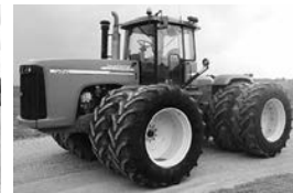
'05 JD 9520, 710x42 rubber, pwr. shift, 4-hyd., bareback, local trade, call.