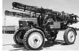
'02 JD 4710 sprayer, 90' booms, 14.9x46 rubber, Green Star ready, 800 poly tank, new S.S. pipe & boom, used on our farm, $77,500.