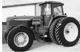
'93 JD 4960, 3-hyd., PTO, 3-pt., whl. wts., original paint, new frt. tires, 18.4x46 rears, all new tires, $39,000.