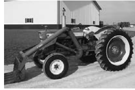
'68 Ford 4000, one-owner, one of a kind very nice dsl., 3000 hrs., 3-pt., PTO, 1-hyd., $7,250.