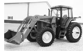
'94 JD 7600, MFWD, w/740 ldr., 8' material bucket, 3-hyd., 540/1000 PTO, pwr. quad trans., 6800 hrs., 1500 hrs. on rblt. eng., $44,500.