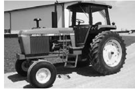
'81 JD 4240, 18.4x38 rubber, 7000 hrs., quad, A/C, 3-pt., PTO, new paint, new cab int., $22,500.