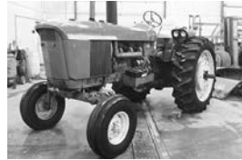
'63 JD 4010, dsl., synchro trans., 2-hyd., 3-pt., PTO, 15.5x38 rubber, $8,000.