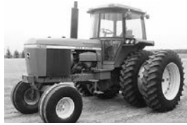
'74 JD 4630, local trade, 18.4x38 cast duals, synchro trans., 3-pt., PTO, 2-hyd., cold A/C, $14,500.