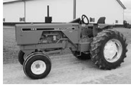
'75 AC 185, dsl., 2-hyd., 3-pt., center link arm, lights work, has a little blow-by, tractor runs good, new paint, $7,000.