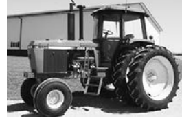
'90 JD 4455, one-owner, 3-hyd., pwr. shift, 3-pt., quick hitch, 6345 hrs., 14.9x46 rubber, new paint, new cab int., $42,500.