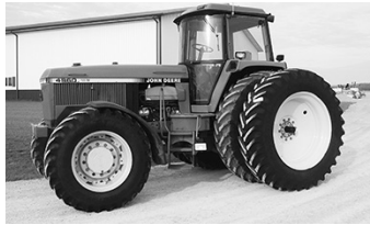
'93 JD 4960, 3-hyd., PTO, 3-pt., whl. wts., original paint, new frt. tires, 18.4x46 rears, all new tires, $39,000.