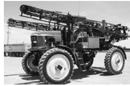
'02 JD 4710 sprayer, 90' booms, 14.9x46 rubber, Green Star ready, 800 poly tank, new S.S. pipe & boom, used on our farm, $77,500.