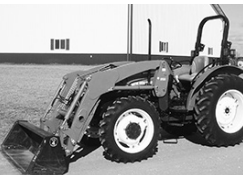
NH Workmaster 45, 394 hrs., MFWD, ldr., joystick, rev., manual trans., $23,500.