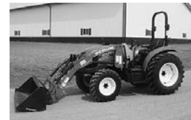
'14 NH Boomer 47, 16x16 synchro shuttle, trans. 350 hrs., ag tires, w/260 ldr., $22,500.