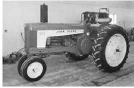
'60 JD 530, recently restored, 3-pt., PS, 13.6x38 tires, rear whl. wts., very nice, $7,850.