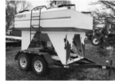
Friesen 220 seed tender, tdm. brush auger, Honda motor, $4,950.