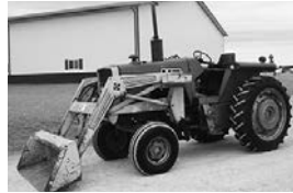
MF 1085, w/Dunham Lehr ldr., material bucket, Perkins dsl., 3-pt., PTO, 2-hyd., $8,750.