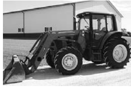
'09 JD 6230, 16.9x30 rear tires, 673 ldr., pwr. quad plus trans., L.H. rev., frt. fenders, $45,000.