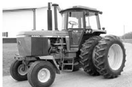
'80 JD 4440, 8500 hrs., 2-hyd., 540/1000 PTO, 18.4x38, 10-bolt duals, nice cab int., $26,500.