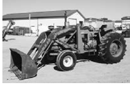
AC 175, dsl., 18.4x28 rear rubber, starts great, 3-pt., 540 PTO, 1-hyd., ldr. w/80" bucket, $7,500.