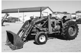
AC 175, dsl., 18.4x28 rear rubber, starts great, 3-pt., 540 PTO, 1-hyd., ldr. w/80" bucket, $7,500.