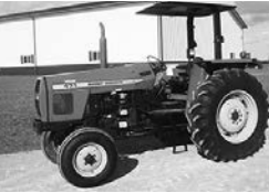
'03 MF 471, 2-hyd., shuttle, 2277 hrs., dsl., 3-pt., PTO, 2-hyd., $10,250.