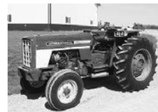
'78 IH 574, dsl., 14.9x28 tires, 1-hyd., 3-pt., PTO, one-owner, $6,750.