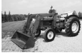
JD 1120 w/175 JD ldr., 3-pt., PTO, 51 hp, 3-cyl. dsl., 1-hyd., $8,750.