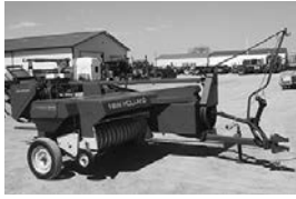
NH 273 baler twine tie, 54A thrower, very nice, $2,650.