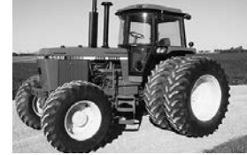
'84 JD 4450, MFWD, 20.8x38 rubber, 10-bolt hubs & duals, frt. fenders, PS, 2-hyd., 3-pt., 540/1000 PTO, new paint, $34,500.