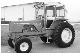
'69 AC XT 190 III, 18.4x34 rubber, one-owner, new paint, 2-hyd., PTO, very low hrs., $12,500.