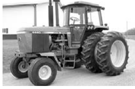
'80 JD 4440, 8500 hrs., 2-hyd., 540/1000 PTO, 18.4x38, 10-bolt duals, nice cab int., $26,500.