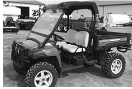
'12 JD Gator 875i, 4WD, 3000 miles, canopy, windshield, $8,950.