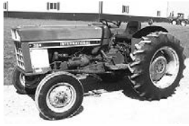
'79 IH 384, dsl., very hard to find, new battery, glow plugs, 3-pt., PTO, 1-hyd., 13.6x28 tires, 70%, $5,975.