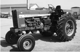
'69 IH 856 custom, 1-owner, 18.4x34 rubber 80%, 2-hyds., 540/1000 PTO, 3-pt., $10,500.