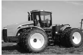
NH TJ375, one-owner, (4) new ins. 620/70R42's, 80% duals, pwr. shift, bareback, less than 1000 hrs. on rblt. motor, nice, $60,000.