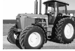
'87 JD 4450, pwr. shift, 2-hyds., 3-pt., 540/1000 PTO, new cab int., new paint, nice tractor, $34,500.