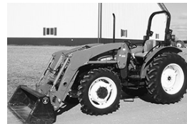
NH Workmaster 45, 394 hrs., MFWD, ldr., joystick, rev., manual trans., $23,500.