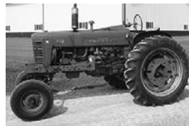
'55 Farmall 400, WF, PS, 2-pt. hitch, 1-hyd., T/A, PTO, rear whl. wts., $5,350.