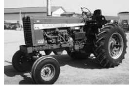
'69 IH 856 custom, 1-owner, 18.4x34 rubber 80%, 2-hyds., 540/1000 PTO, 3-pt., $10,500.