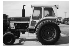
'73 IH 1066, 2-hyd., 540/1000 PTO, good T/A, IH cab w/A/C, 18.4x38 Firestone 23" tires, 85%, $9,750.