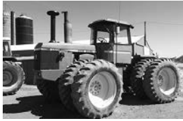
'82 JD 8640, 20.8x38 rubber, 3-hyd., 3-pt., PTO, quick hitch, $24,500.