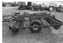
JD 950 cultimulcher, 15' wide, $1,650.