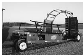
262PR02 Kemco bale wrapper, 4-film disp., 20 hp Honda, dual whl. drive, wraps up to 6'6" round bales & 7' square bales, $31,500.