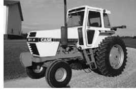
'79 Case 2090, 18.4x38, 2-hyd., 540/1000 PTO, diff. lock, cold A/C, recent new paint, one-owner, frt. wts., $14,500.