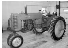
'50 JD MT, 1-owner, all orig., 10x34 tires, PTO, lights, very straight, $4,500.