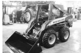
'09 NH L160, 4000 hrs., ran through shop, new 72" bucket, nice unit, $13,750.