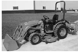
'10 Kubota B2920H, hydro, MFWD, 400 hrs., ldr., 60" mid-mount deck, joystick, tiller is avail., $17,650.