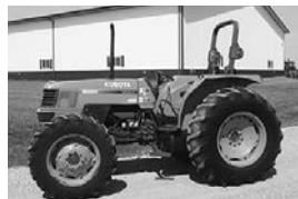
'07 Kubota M8200, one-owner, dsl., 3600 hrs., MFWD, new frt. tires, shuttle trans., L.H. rev., new seat, $16,750.