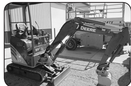
'13 JD 17D mini excavator, ROPS, rubber track, blade, aux. hyd., 16" QT bucket, extendable tracks, 2 spd. travel, pattern changer, 3-cyl. Yanmar dsl., digs 7'1" deep, 781 hrs., nice, $18,900.