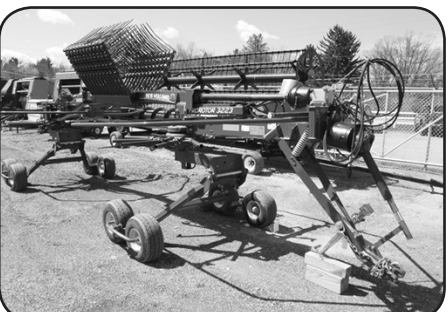
'15 NH Prorotor 3223 hay rake, twin rotor, 540 PTO, light kit, will do single or dbl. rows, owners manual, 18.5x8.50-8 tires, only 100 acres on rake, like new, $18,000.