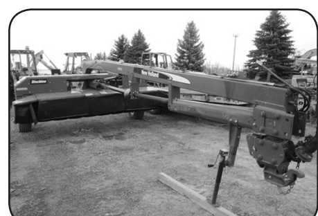
'06 NH 1431 discbine, 13' cut, rolls, light kit, 31x13.5-15 tires, center pull, 1000 PTO, owners manual, just gone through, good cond., $11,500.

Trucking & Financing Available! View Our Complete Inventory At www.mnolanfarms.com