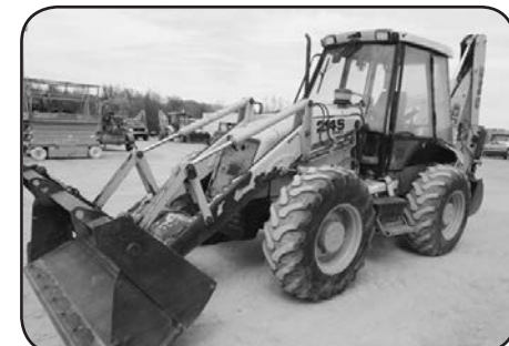
'00 JCB 214SII backhoe, cab, heat, 4x4, extend-a-hoe, 92" frt. bucket, bolt-on cutting edge, 24" rear bucket, 16.9x24 tires, 2-whl./4-whl./crab steer, turbo, 2-lever controls, pwr. shift, runs & operates good, $22,500.