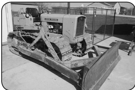
'66 JD 450 dozer, 4-cyl. dsl., 9' wide blade, 18" pads, lever steer, 4 spd. trans. w/rev., weighs 13,500 lbs., all original, one-owner dozer, has been stored inside, $8,750.