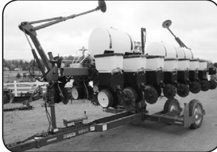
'04 Kinze 3500 corn planter, 8R w/interplant, 30"/15" row spacing, liquid fert., no-till, seed firmers, corn & soybean meters, (4) down pressure spgs., (3) 150-gal. liquid tanks, mon. & books, planter is ready to go, very good cond., $47,500.