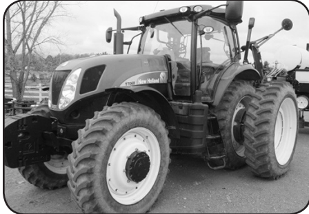
'10 NH 7060 tractor, cab, A/C, 4x4, 18 spd. pwr. shift, LF hand rev., (10) frt. wts., 4-rem., 420/80R46 radial rears, 3-pt. hitch, PTO, buddy seat, 210 hp, 2533 hrs., very nice tractor, $67,500.