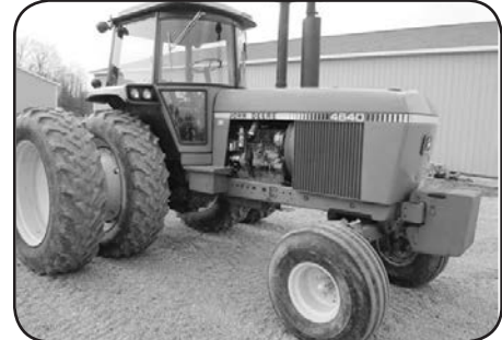
'80 JD 4640 tractor, cab, A/C, heat, 3-rem., 1000 PTO, drawbar, quick hitch, 18.4x42 axle duals, 14L-16.1 frt. tires, (10) frt. wts., 8 spd. pwr. shift, 9534 hrs., 160 hp, very nice tractor, $18,500.