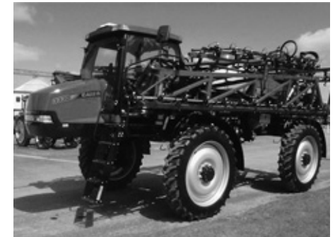
'12 Case IH Patriot 3320, on order.