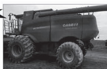
2007 CASE IH 7010 3614hrs/3112sep, 1250 45R32 su- per singles, 28L26 rears...$82,500 (C)