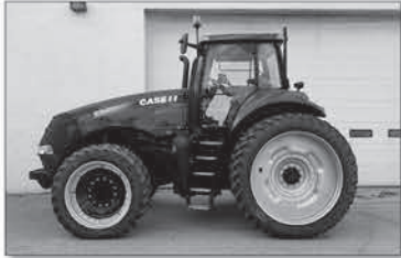
2014 CASE IH MAGNUM 260 1102hrs, MFWD, PS trans, dlx cab, 3 HID lites, beacon...$136,500 (R)