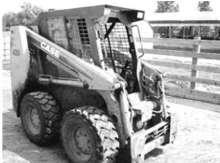
(C) '07 Case 420 skid steer, cab, heat, hyd. coupler, 2387 hrs., $17,500.