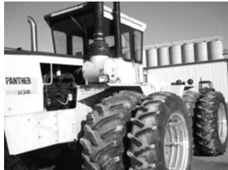
(R) '07 Case IH 8010, PRWD, dual 640/42, chopper trap, ele. svcs., Pro 600, $198,000.