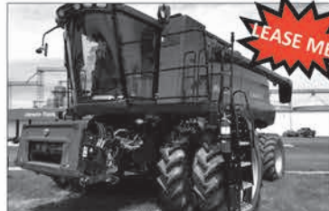
2012 CASE IH 6130 (B)...$182,500 w/ 2011 3020-35' (C) ...$26,000 Operating Lease (walk away) 3yrs—300hrs/yr—$33,515/yr OR $112 per hour (sep hrs)