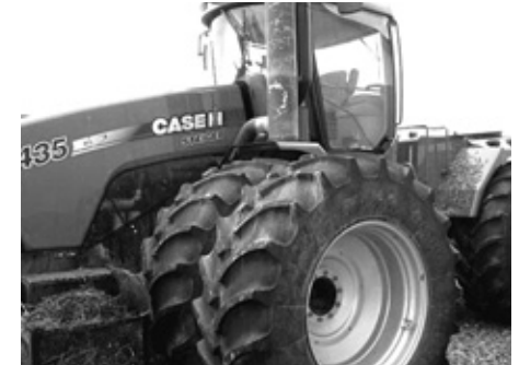
(R) '10 Case IH Steiger 435, 435 eng. hp, 4WD, 710/42's, 4-rem., PS, HID, $199,500.