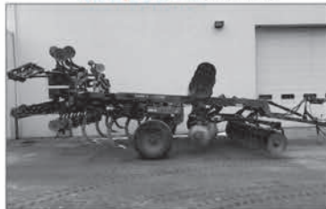
2011 CASE IH 870 18ft, front discs 25", legs good, good rear roll...$42,500 (R)