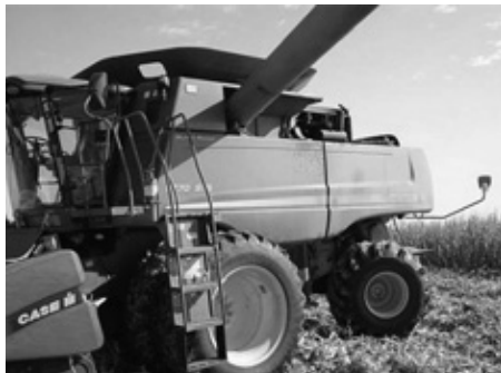
(R) '11 JD 9770, STS, 2WD, dual frts., 520/42, auto. trac ready, chopper yield, $272,500.