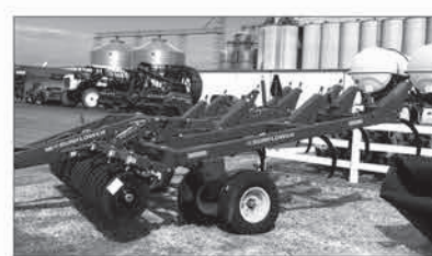
NEW SUNFLOWER 4213 (B) 11 shank carryover Sizzling hot price! Call for details!