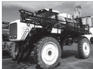
2004 WILLMAR 8650 2175hrs, 1200 gal stnls tank, 100 ft boom, 5 sections...$45,000 (B)