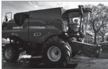
2013 CASE IH 7230 844hrs/620sep, 900x60R32 front singles, 600x65R28 rears 4WD...$182,500 (C)