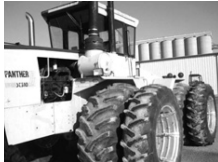
(B) '79 Steiger Panther 310, 310 eng. HP, 4WD, 3-rem., bare back, 30.5x32/18, 6027 hrs., $22,500.