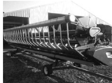
(R) '08 Case IH 1020 30' flex head, full finger, poly, fore-aft, very clean, $23,500.