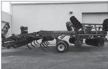
2015 JOHN DEERE 2730 9-24" shanks, front disc good, rear disc leveler good...$69,500 (R)