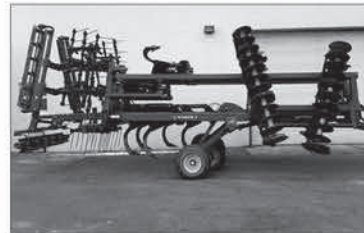
2013 LANDOLL 2410F-9-24 9-24" shanks, coil tine leveler with chopping reel...$33,500 (R)