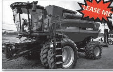
2015 CASE IH 7240 (C)...$269,500 Operating Lease (walk away) 4yrs—300hrs/yr—$39,138/yr OR $131 per hour (sep hrs)