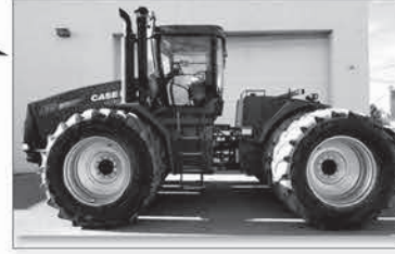
2010 CASE IH 435 4200hrs, auto steer 500 EZ guide, HID lights, deluxe cab...$119,500 (C)