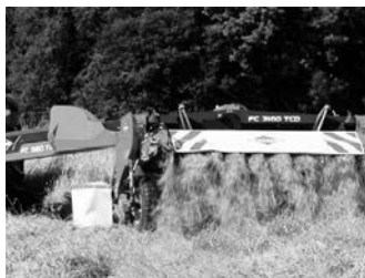
New Kuhn FC2860TLD mower cond.