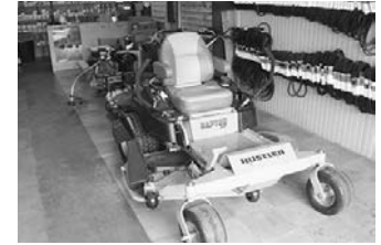
New Hustler zero turn in stock, several sizes in stock.