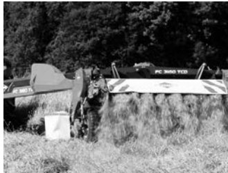
New Kuhn FC2860TLD mower cond.