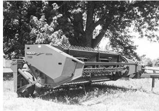
'08 Agco 1109 haybine.