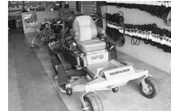
New Hustler zero turn in stock, several sizes in stock.