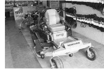
New Hustler zero turn in stock, several sizes in stock.