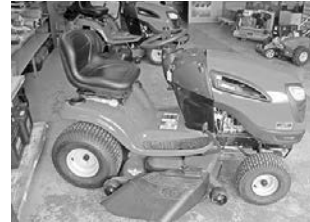
New Jonsered riding mowers, 54" cut.