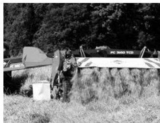
New Kuhn FC2860TLD mower cond.