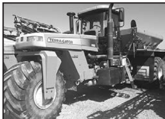
Terra-Gator 8103 , 5000 hrs., Viper Pro Controller, G4 L3220 Multiplier ready, 66x43x25, 25% tread remaining. . . . . $69,000