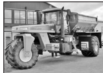
Terra-Gator 6103 , stk. #10578, 4679 hrs., 300 hp, Raven 661 with Outback Guidance, New Leader L2020 G4, rear: New Michelin 1000/50R25, front: 1000/50R25, Terra-Shift transmission, roll tarp, single bin. . . . . $39,000