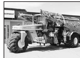
TG 8203 , 2011 hrs., 70' boom, Viper Pro, Air Max Precision, 1000/50R25 floaters, 100% frt. tread, 90% LR, 30% RR, Raven Accuboom, Raven Smartrax, Terrashift trans., foamer. . . . . $95,000