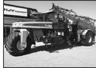
Terra-Gator 8300 , 2267 hrs., 70' boom, Air Max Precision 2, CVT trans., Viper Pro controller, Raven Accuboom, Raven Smartrax, 1000/50R25 floaters, 60% tread, foamer. . . . . $169,000