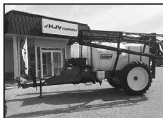
Demco Conquest 1200 , stk. #2038, 60' boom, 1200-gal. poly tank, 380/90R46 tires, 70% tread remaining, 2" reload, 20" spacing, eductor, manual hyd. tread adj., foamer. . . . . $6,900