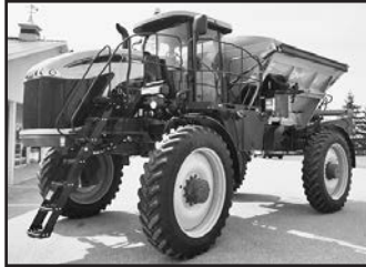
RG900B , stk. #8621, 677 hrs., New Leader 4258 G4 Box, Raven Viper 4, Smartrax, Michelin 380/90R46, 710/70R38 Mitas floaters. . . . . $238,000