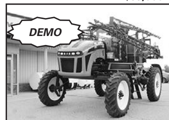
Apache 720 , stk. #1543, 37 hrs., demo unit, 60'/90' boom, 750-gal. tank, 50" clearance, Raven Envivio Pro 2 controller, Hypro Clean Load chemical eductor, frt. & rear fenders. . . . . Call For Pricing

Bryon McClain Equipment Solutions & Sales (810) 712-1413