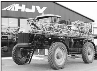
RG 1100 , stk. #10648, 2390 hrs., 120' boom, 1100-gal. S.S. tank, 4WD, 311 hp, Raven Viper Pro controller, Autoboom, Accuboom, Smartrax, 4-whl. steer, Michelin 380/90R46 tires, BCO, 7-sect. control, eductor, fenders. . . . . $135,000