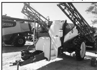
Hardi Navigator 1100 , stk. #10390, 80' boom, 3500 controller, adj. axles, new 12.4x42 tires, triple nozzle bodies, rinse tank, 463 PTO pump. . . . . $11,000