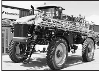
RG 900B , stk. #9545, 120 hrs., 100' boom, Raven Viper 4, G2 Autoboom, 380/90R46 tires, auto. hyd. track adjust, end rows 90 & 100x10-20, leather seat, air dryer, HID lights, air ride cab. . . . . $289,000