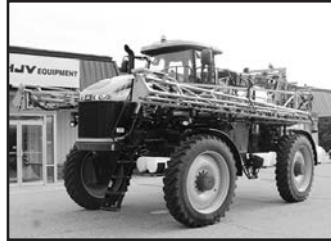
RG 1100 , 1705 hrs., 100' boom, 1000-gal. S.S. tank, Raven Viper Pro controller, Autoboom, Accuboom, Smartrax, 380/90R46 tires. . . . . $180,000