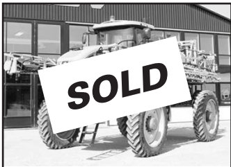
RG1100 , stk. #10150, 2318 hrs., 100' boom, 1100-gal. S.S. tank, 4WD, 311 hp, Raven Viper Pro controller, Autoboom, Norac boom ht., Smartrax, 380/90R46 tires, chemical eductor, 20" spacing. . . . $141,000