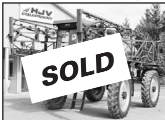
Case IH 3200 SPX , stk. #10019, 2825 hrs., 90' boom, 1000-gal. S.S. tank, Raven controller, Trimble 500 w/EZ-Steer & sect. control, 380/90R46 Continentals, 65% tread, 5-way nozzles, S.S. eductor. . . . . $65,000