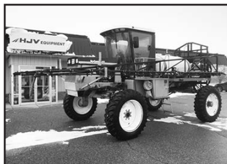
Rogator 664 , stk. #2083, 3581 hrs., 60' boom, 660-gal. poly tank, Raven 660 controller, 20" nozzle spacing, 1.5" reload, 385/85R34 tires, hyd. tread adj., foamer. . . . . $23,000