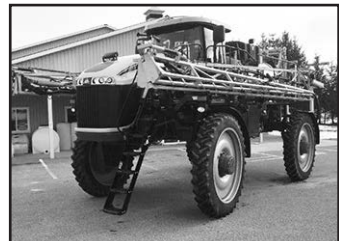
RG1100 , stk. #10569, 4179 hrs., 100' boom, 1100-gal. S.S. tank, Raven Viper Pro, Smartrax, Accuboom, Autoboom, 320/90R50 @ 50%, eductor, air boom cleanout, foamer. . . . . $83,000