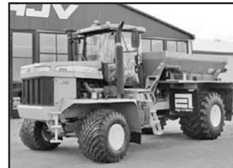
Terra-Gator 8104 , stk. #10579, 4652 hrs., 300 hp, New Leader L3020 G4, Outback STX Guidance, Terra-Shift transmission, JD 8.1L engine. . . . . $42,000