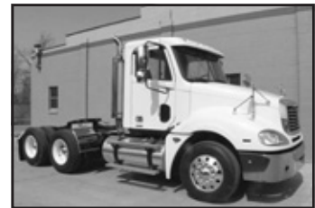
'05 FTL CL12064ST, MBE4000, 435 hp, 10 spd., 170" WB, 3.58 ratio, Jake, dual 100 tanks, new caps on drives, 517,981 miles ..... $38,900