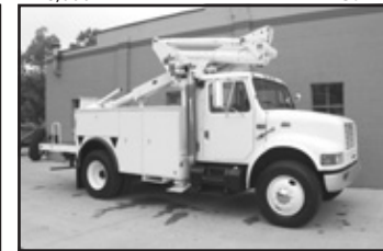
'99 Int'l. 4700 bucket truck, DT466 210 hp, Allison auto., 11.5' Knapheide body, AltecTA37M lift ..... $26,900