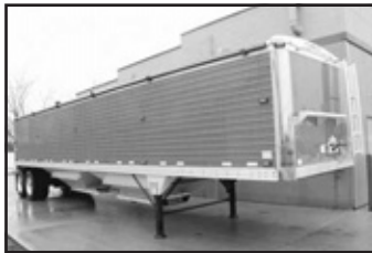
'07 Timppe Super Hopper, 40' long, 72" sides, air ride susp., S.S. corners & rear panel, (8) alum. .... $33,900