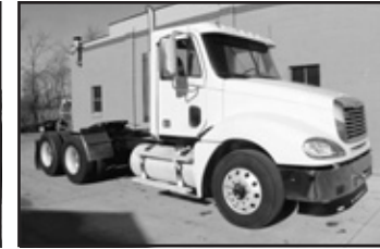
'07 FTL CL12064ST, C13 Cat, 410 hp, Ultrashift trans., 185" WB, sgl. tank, air ride, Jake, 455,000 miles ..... $48,900