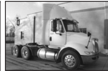
(5) '09 Int'l. 8600, C13 Cat, 350 hp, 10 spd., air ride susp., 3.36 ratio, 163" WB, (6) alum. whls., miles range from 450,000-725,000 ..... Call