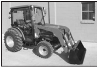
'12 Mahindra 3616, 4WD, cab, A/C, hydro, ldr. w/60" bucket . . . . . CALL