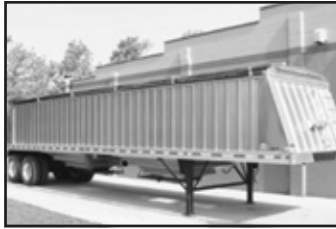
'13 Neville & Maurer grain trlrs., clearance on remaining '12 models, 22'-40', roll tarp, LED lights, ag hoppers ..... CALL