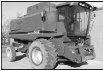
Case IH 1660, 3902 hrs., 30.5x32 drives, hydro, auto. height control, hyd. fore & aft, chopper, spreader . . . . . $24,900