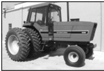
'83 IH 5088, 2WD, 135 hp, 5446 hrs., NEW paint, NEW 18.4x38 drives & duals, 2-rem., dual PTO . . . . . $39,900