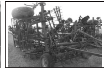
BerVac 520 , 20' wide, S-tine, dbl. rolling basket, 2-bar spike harrow ..... $8,750