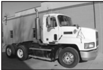
'01 Mack CH613, E7 380 hp, 10 spd., air ride susp., 165" WB, eng. brake, dual tanks, LP 22.5, 471,000 miles ..... Call