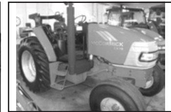
'02 McCormick CX70, 963 hrs., 2WD, 540/1000, 18.4/15x30 ..... $17,900