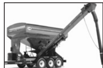
'12 J&M Speedtender, 375 unit cap., 3-axle U/C, conveyor, scales, wired or wireless remote . . . . . CALL Only (1) unit left for Spring delivery!