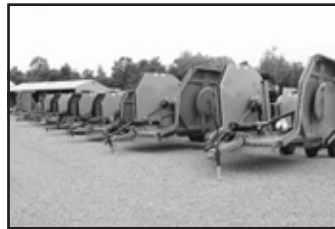
Large selection of Woods batwings, rotary cutters & finish mowers in stock.