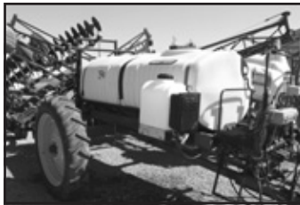
Bestway 750 , 60' boom, foam markers, 12.4x38 ..... $12,500