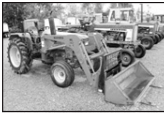
'06 Mahindra 5500, 54 hp, 2WD, 153 hrs., ML126 ldr., 18.4x38 . . . . . $16,900