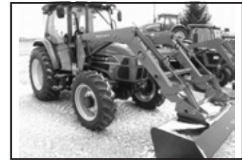
NEW Mahindra 8560 , MFWD, 83 hp, cab, fwd/rev. shuttle, 2-rem., 540/1000 PTO, ldr. & bucket . . . . . Call