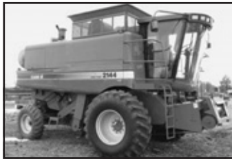
'96 Case IH 2144, 2470/2030 hrs., R/T, chopper, spec rotor, 20' 1020, 1-owner . . . $68,900

Email us at: howviolet@bright.net "Visit our website for more products information"