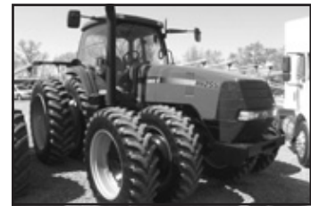
'05 Case IH MX255, 215 hp, 3322 hrs., MFWD, 3-rem., (3) PTO, 380/85R34, 480/80R46, auto steer ready . . . $104,900