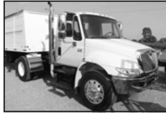
'02 Int'l. 4400, DT466, 215 hp, auto., air ride, 152" WB, air brakes, pwr. windows & locks, 64,000 miles ..... $34,900