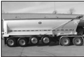
'06 MAC quad axle dump trlr., alum., tarp, 455/55R22.5 tires, 11R22.5 on lift, very nice ..... $41,900