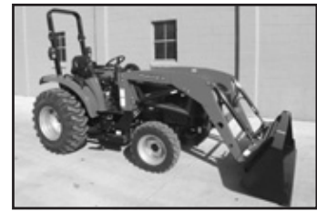
'12 Mahindra 3535, 4WD, ldr. w/72" bucket, industrial tires . . . . . CALL