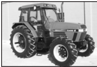
'93 Case IH 5250, MFWD, 112 hp, 4953 hrs., 540/1000, 3-pt., new paint, new tires . . . . . $44,900