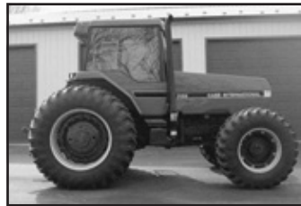
'89 Case IH 7120, 3030 actual hrs., 18.4x42 axle duals, wts., dual PTO ..... $62,500