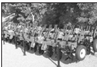
New UM 130 Zonebuilders , 4-, 5-, or 6-shank in stock, auto reset, 20" rippled coulters, shank protectors . . . . . Call for availability