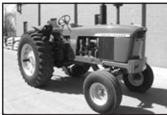
'66 JD 4020, 95 hp, 2WD, 5426 hrs., 18.4x24, 3-rem., 540/1000 . . . . . $14,500