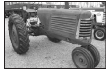
'51 Oliver 77G, 540 PTO, 1-rem., 13.6x38 . . . . . $3,850