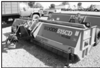
NEW Woods flail choppers , 15' 20' & 30' wide, L-knife, pull type, 1000 PTO, 9.5Lx15 tires, IN STOCK ..... Call