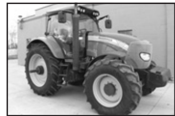
'10 McCormick XTX 165, MFWD, 189 hrs., 18.4R42, 16.9R28, fenders, 4-rem., (16) wts., 540/1000 . . . . . $89,900