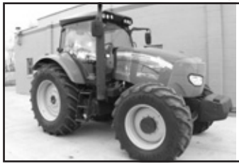
'10 McCormick XTX 165, MFWD, 9 hrs., 20.8R38, 16.9R28, 4-rem., (12) wts., 540/1000 . . . . . $93,900