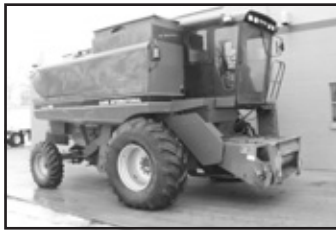
'93 Case IH 1666, 3461 hrs., rock trap, straw chopper, Maurer extension, 14.9x24, 24.5x32 . . . . . $39,900