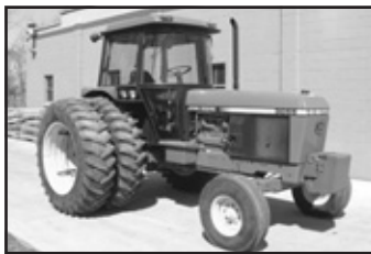
'92 JD 3055, 92 hp, 2WD, 761 1-owner hrs., 16.9x38 T-rail duals, 2-rem., dual PTO, IMMACULATE . . . . . $43,900