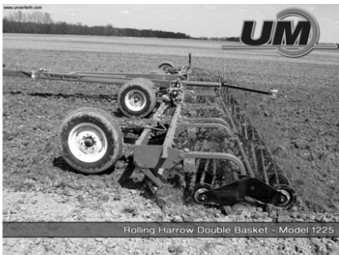
Rolling Harrow Double Basket - Model 1225

The Rolling Harrow soil conditioner levels, incorporates chemicals and finishes the soil in one smooth, efficient operation. You'll get a firm, level field with coarse soil on top that resists crusting, with the finer soil particles at planting depth for optimum seed-to-soil contact.