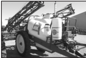
Hardi Commander 750 , 60' boom, foam markers, 12.4x42 ..... $21,500