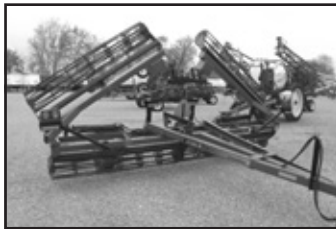
Case IH crumbler , 30' wide, lights ..... $9,500