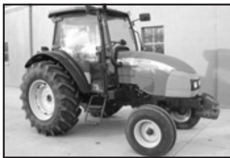
'10 McCormick C105 Max, 98 hp, 2WD, 4 hrs., 18.4R30, 2-rem., 540 PTO . . . . . $32,900