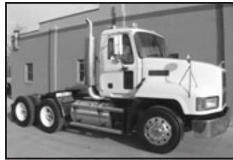
'03 Mack CH600, E7 Mack, 350 hp, 9 spd., air ride, 160" WB, good tires & brakes, new paint ..... $39,900