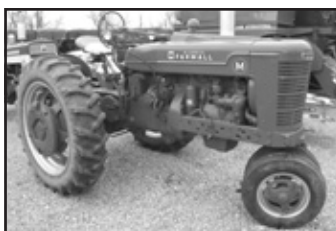
'49 Farmall M, 540 PTO, 1-rem., 13.6x38, whl. wts. . . . . $5,500