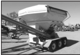
'10 UM 3750, scales, roll tarp, elec. start Honda, 6" conveyor ..... $21,900

Email us at: howviolet@bright.net "Visit our website for more products information"