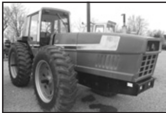
'80 IH 3588, 4880 hrs., 18.4x38, 3-rem., dual PTO, 3-pt. .... CALL