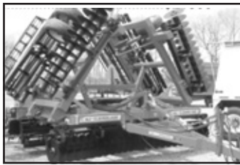
Large selection of new & used reel disks on hand, 14' through 44', CALL FOR AVAILABILITY!