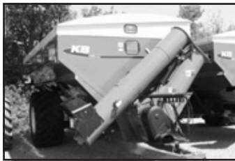
(2) '09 Killbros 110, 900/60R32, 1100-bu., 18" floor auger, 20" vertical auger, roll tarp . . . . . CALL