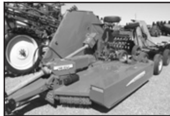
'11 JD CX15, 10' sgl. wing, 540 PTO, chain shielding, susp., aircraft tires ..... $17,900