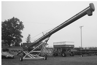
New Farm King augers , 8"x61', $5,200.