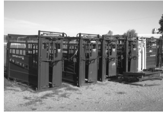
Nice selection of cattle chutes in stock , starting at $1,950.