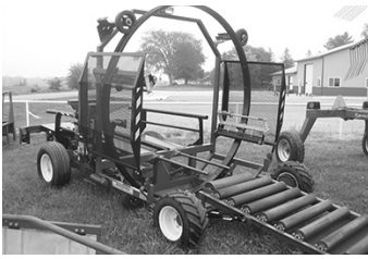
New J Miller 4511 bale wrapper, self-propelled, $24,000.