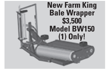
New Farm King Bale Wrapper $3,500 Model BW150 (1) Only!

104"x56"x65" Dimensions, overall, 47"x47" bale dimensions, 20"x30" film spool dimensions, 24/16 rev table revolutions, 40 hp requirement, weighs 992 lbs.