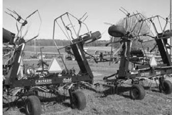
Esch 2018 18', $6,850, 4022, 22', $8,900.