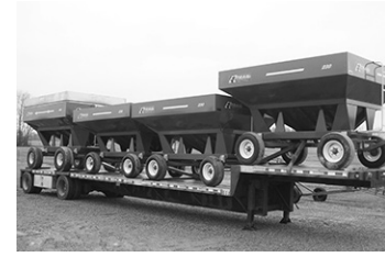
New EZ Trail gravity boxes , 230 bu., $3,500 400-bu., $6,400.