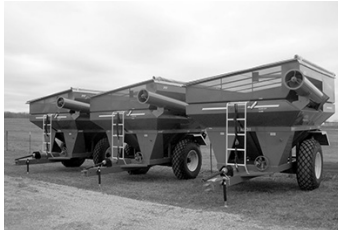
New EZ Trail 510 grain carts in stock , roll tarp, lights, red, blue & green colors, $13,300.