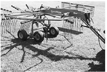
New Farm King RR420 rotary rake , tongue hitch, (1) only, $5,900.