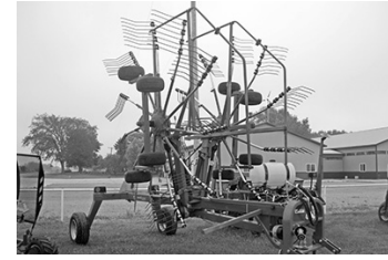
New Farm King twin rotary rake , $19,995.