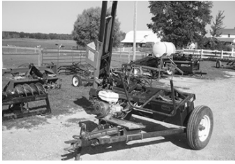
Ezee On 2400 self-contained post pounder , Honda eng., $4,000.