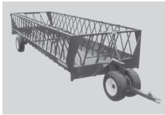
Feeder wagons, H.D. 12-ga. steel, 7' widths, 12', 16', 20' & 24' lengths.