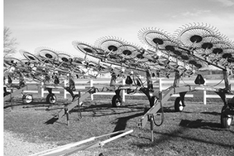
New Pequea mid-capacity rakes, 8-whl., $5,900, 10-whl., $6,350, 12-whl., $6,900.