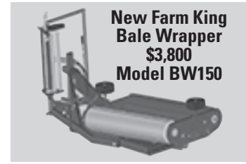
New Farm King Bale Wrapper Model BW150 104"x56"x65" Dimensions, overall, 47"x47" bale dimensions, 20"x30" film spool dimensions, 24/16 rev table revolutions, 40 hp requirement, weighs 992 lbs.