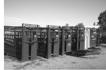
Nice selection of cattle chutes in stock, starting at $1,950.