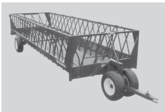
Feeder wagons , H.D. 12-ga. steel, 7' widths, 12', 16', 20' & 24' lengths.