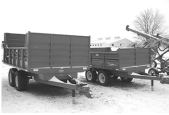
• New JBM T800 Dirt Boss, $4,850