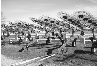
New Pequea mid-capacity rakes , 8-whl., $5,900 , 10-whl., $6,350 , 12-whl., $6,900.