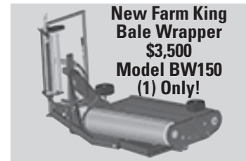
New Farm King Bale Wrapper $3,500 Model BW150 (1) Only!

104"x56"x65" Dimensions, overall, 47"x47" bale dimensions, 20"x30" film spool dimensions, 24/16 rev table revolutions, 40 hp requirement, weighs 992 lbs.