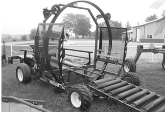
New J Miller 4511 bale wrapper , self-propelled, $24,000.