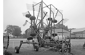
New Farm King twin rotary rake, $19,995.