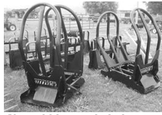
New skid steer bale hugger, $1,995.