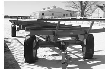
• 8.5x30 Round bale rack, 14-ton hoist gear w/30.5x22.5 used truck tires, $5,000