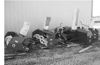
New Farm King snowblowers , 3-pt., 50" $1,800 , 60" $1,950 , 84" $2,950.