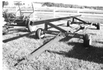
New 21' header cart , $2,540 ; 26', $2,820.