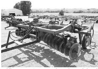
JD 1710 11-shank chisel plow, $3,500.