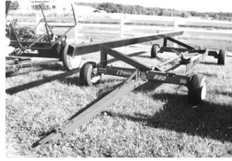
New 21' header cart , $2,540 ; 26', $2,820.