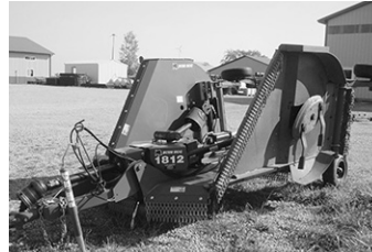
Bush Hog 1812 12' rotary cutter , exc. cond., $10,500.