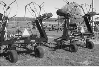
Esch 2018 18' , $6,850 , 4022, 22', $8,900.