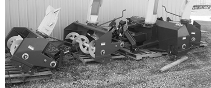
New Farm King snowblowers, 3-pt., 50" $1,800, 60" $1,950, 84" $2,950.