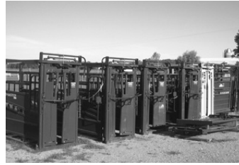
Nice selection of cattle chutes in stock , starting at $1,950.