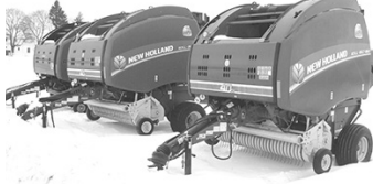
(2) '15 NH Rollbelt 460, from $22,000.