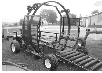
New J Miller 4511 bale wrapper, self-propelled, $24,000.