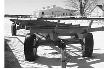
• 8.5x30 Round bale rack , 14-ton hoist gear w/30.5x22.5 used truck tires, $4,800 • 8.5x24 Round bale rack , 12-ton Horst gear, 30.5x22.5 tires, $4,300 , limited supply