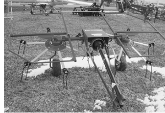
New Farm King 2-basket tedder, 10' working width, limited supply, $2,100.