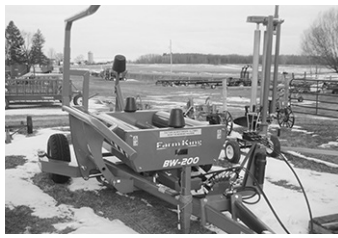
New Farm King BW200, self-loading, bale wrapper, $11,500.