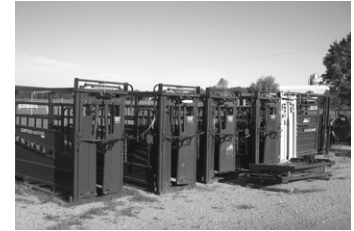
Nice selection of cattle chutes in stock, starting at $1,950.