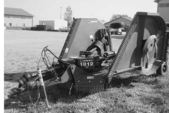
Bush Hog 1812 12' rotary cutter, exc. cond., $10,500.