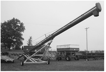
New Farm King augers , 10"x61", $6,175.