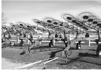
New Pequea mid-capacity rakes, 8-whl., $5,900, 10-whl., $6,350, 12-whl., $6,900.