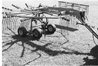
New Farm King RR420 rotary rake, tongue hitch, (1) only, $5,900.