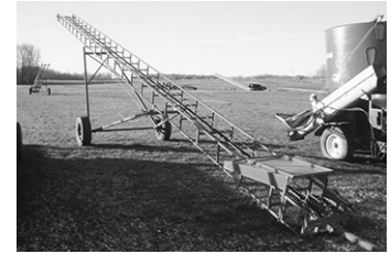
Bale elevator, 48', skeleton, used 1 time, $3,100.