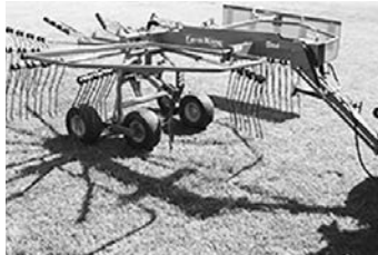
New Farm King RR420 rotary rake , tongue hitch, (1) only, $5,900.