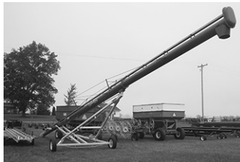
New Farm King augers, 8"x61', $5,200, 8"x36', $3,850, short utility augers in stock.