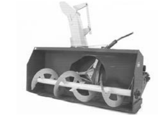
New Farm King 840 snowblowers , 84" 3-pt., 60-90 hp, in stock, $2,950.