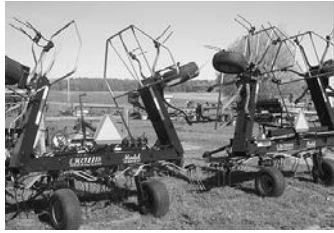
Esch 2018 18', $6,850, 4022, 22', $8,900, (1) demo, $5,900.