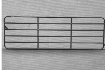
Gates, corrals & feeders.