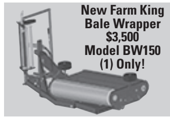
New Farm King Bale Wrapper $3,500 Model BW150 (1) Only!

104"x56"x65" Dimensions, overall, 47"x47" bale dimensions, 20"x30" film spool dimensions, 24/16 rev table revolutions, 40 hp requirement, weighs 992 lbs.