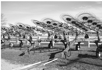
New Pequea mid-capacity rakes , 8-whl., $5,900 , 10-whl., $6,350 , 12-whl., $6,900.