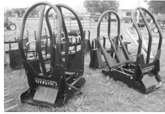
New skid steer bale hugger , $1,995.