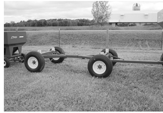
• New EZ Trail 8-ton running gear , 11Lx15 tires, $1,695 • 10-Ton w/12.5L15 tires, $2,030