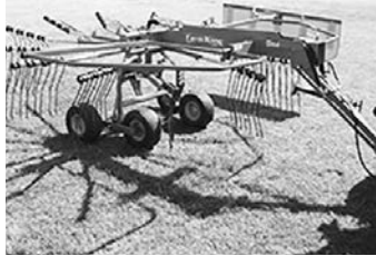
New Farm King RR420 rotary rake, tongue hitch, (1) only, $5,900.