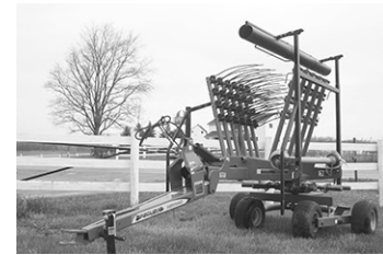
New Pequea HR1140 hay rake , 11', $7,950. Also: New Pequea HR930 , 9', hyd. lift, tdm. axle, $6,250.