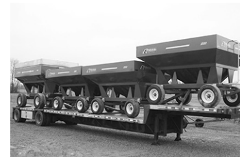
New EZ Trail gravity boxes , 230 bu., $3,500 400-bu., $6,400.