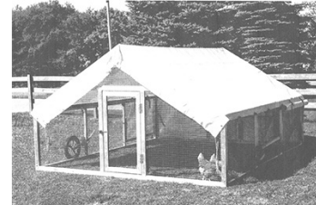
Portable chicken grazer, 10'x12', $1,350; 8'x10', $1,285; 4'x6', $975.