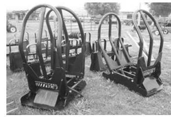
New skid steer bale hugger, $1,995.

104"x56"x65" Dimensions, overall, 47"x47" bale dimensions, 20"x30" film spool dimensions, 24/16 rev table revolutions, 40 hp requirement, weighs 992 lbs.