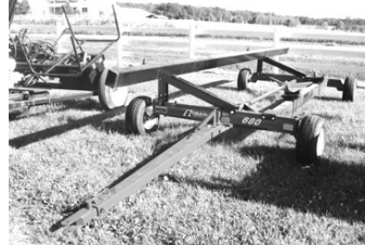
New 21' header cart, $2,540; 26', $2,820.