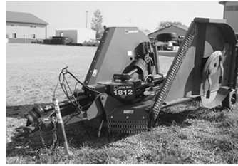
Bush Hog 1812 12' rotary cutter, exc. cond., $10,500.