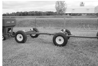
• New EZ Trail 8-ton running gear, 11Lx15 tires, $1,695