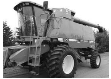
JD 9500, 30.5x32, bin ext., chaff spreader, DAM, F&A, 2833 hrs., $29,500.