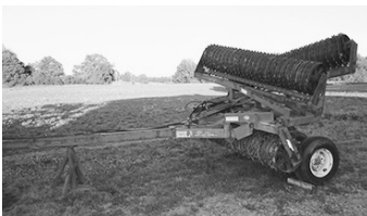
Brillion X-108 25' X-fold packer, solid notched packer whls., $8,900.

J GALLOWAY FARMS INC. (517) 204-5097 www.jgallowayfarms.com St. Johns, MI