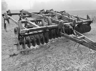
JD 712 disc chisel, 11-shank, exc. blades, field ready, $5,900.