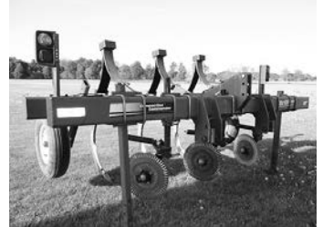
Brillion CCD-138 ripper, 3-shank, 3-pt., auto. reset, no-till coulters, gauge whls., dbl. frame, one-owner, $3,900.