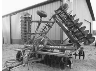
White 271 rock flex disc, 25', 22" ft. blades, 20" rear blades, $6,900.