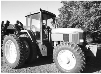
'96 JD 7800, PS, 4WD, 420/80R46, 3-outlets, 540/1000 PTO, 6900 hrs., very nice, $49,000.