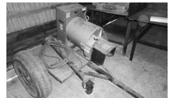
Winco 35,000 watt PTO generator, 540 rpm, w/trlr., $2,900.

J GALLOWAY FARMS INC. (517) 204-5097 www.jgallowayfarms.com St. Johns, MI