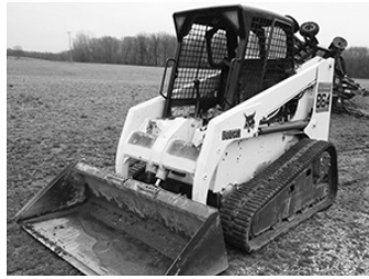
'00 Bobcat 864, 73 hp, 2000# lift, aux. hyd., $12,500.