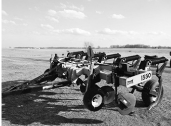
Landoll 1550 6-shank ripper, Blu-Jet coulters, gauge whls., trlr. type or 3-pt., exc., $6,250.