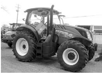
New NH T6.145, MFD, 16x16 Powershift.