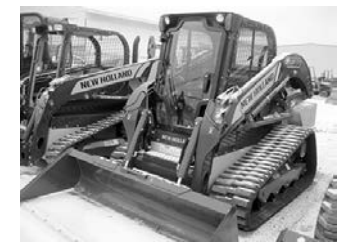
New NH C238 track ldr., 0% for 60 mo. financing.