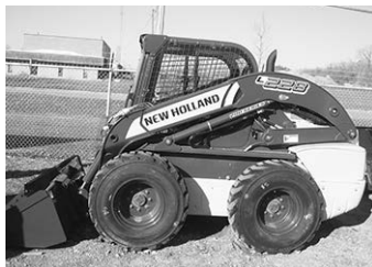
New NH L228 skid ldr., 74 hp, 2800 lb. rated lift cap., cab, heat, A/C.