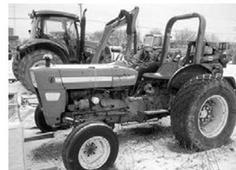
Ford 4000 dsl., not running, 3-pt. missing, $1,500 firm.