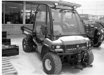
JD HPX Gator, 4x4, cab, heat, frt. blade, $8,900.