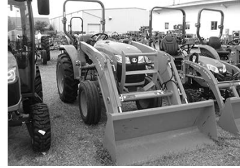
New Kubota L2501F, 8x2 trans., ldr., (1) only, stk. #26517, cash $12,995.