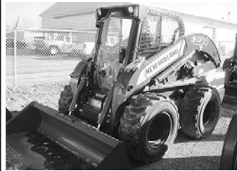
New NH L234 skid ldr., 90 hp, 3400 lb. rated lift cap., cab, heat, A/C., 0% for 60 months.