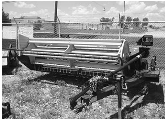
New NH 488 haybine, 9'3" #MC27301, cash clearance price $17,900.

View Our Used Equipment on: www.flintnewhollandinc.com