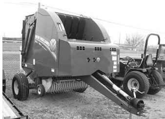
New NH 450 roll belt utility baler, 0% financing or cash discounts.