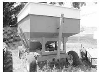
Killbros 350-bu. gravity box, 100-bu. ext., $2,995.