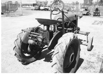
IH Cub, (2) blades, (2) plows, partial cultivators, $1,900.