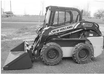
New NH L218, cab, heat, A/C, 1800# lift, 0% A.P.R. avail., 1800# lift.