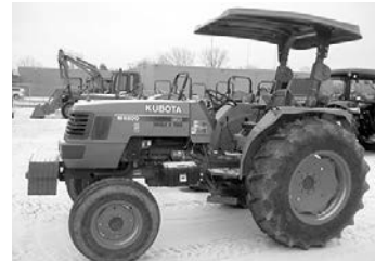
Kubota M4800, 2WD, dsl., 995 hrs., rem., $8,999.