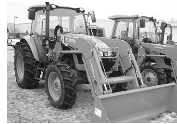
New Kubota M5.111 HDC12, 4WD, 89 PTO hp, 12 spd., ldr., 0% financing.