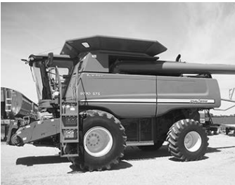
'08 JD 9770 STS, floater 28" rears, real quality .... .....$95,000