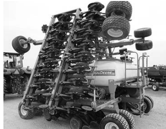
'15 JD 1990 air seeder, 40' .....$108,000