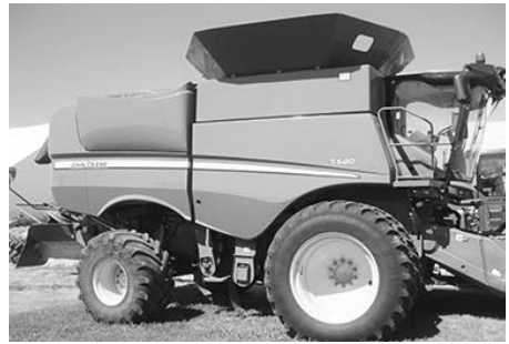
'13 JD S680, 4WD, duals, Pro Drive .....$150,000