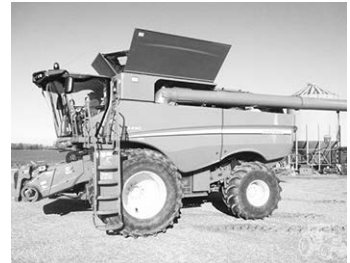
'13 JD S690, 4WD, 650R32 duals, 835 hrs., loaded .... .....$201,000