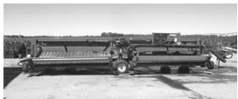
'12 H&S TWM12, twin 12' merger, exc., 1-owner .....$19,000