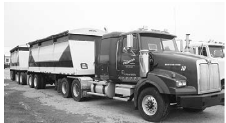
• '07 Western Star Michigan Special, C13, 18 spd.... $30,000 • '07 Drake break-up dbls. .... .....$40,000