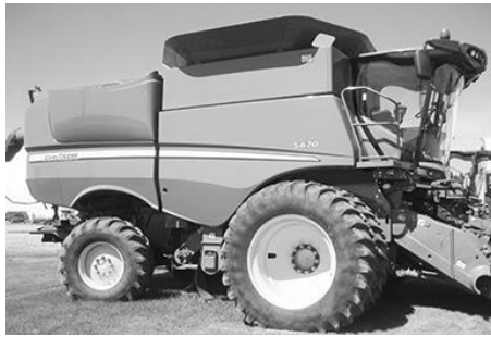
'13 JD S670, 4WD, duals ..... .....$130,000