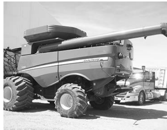
'13 JD S660, 1100 sep. hrs., floaters....$140,000