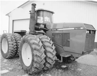
'92 JD 8760, new interior .....$26,000