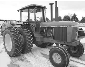
(2) JD 4440, pwr. quad, 3-rem., 18R38 tires, both very clean..$22,000 & $24,000