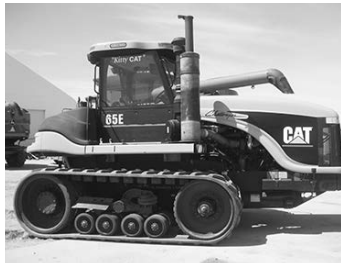
'99 Cat 65E, exc ..... .....$75,000