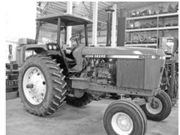
JD 4055 quad, 18x38, new paint, (4) post....$25,000