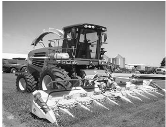
'07 JD 7700, KP, high arch, 800/32 tires, eng. o'haul & new turbo, auto. lube, loaded, 1802 cutter hrs.... .....$80,000