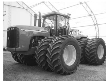
JD 9420, duals, 800R38, very nice.....$85,000