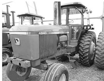
'79 JD 4840, 18.4R42, duals, cold A/C, pwr. shift.. .....$21,000