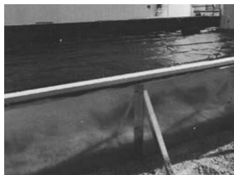
PLIA-DIKE The Superior Alternative to Concrete Versatile Liquid Containment