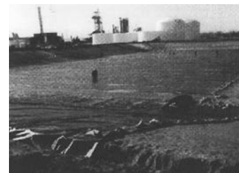
PLIA-LINER A Solution for New or Existing Dikes