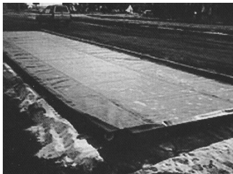
PLIA-PAD Instant Containment Anytime, Anywhere