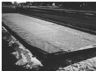
PLIA-PAD Instant Containment Anytime, Anywhere