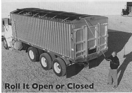
Roll It Open or Closed