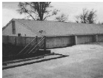
PLIA-TANK Covered Liquid Storage