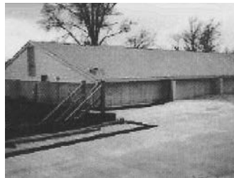
PLIA-TANK Covered Liquid Storage