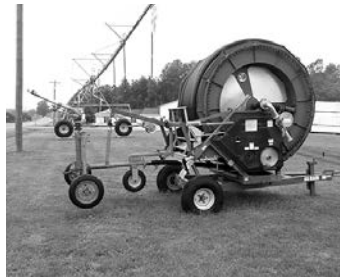
KIFCOT 30LP 3" X 1000' (USED)