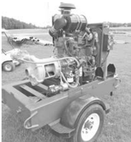
JOHN DEERE JD4045TF ENGINE (USED)

Save on down time next year. Call and schedule today!