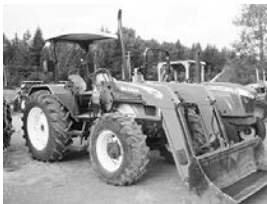
NH T5050, 4x4, ldr., 3000 hrs., $29,500.