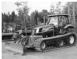
Sure Trac snow groomer, NHTS115A, 5400 hrs., good cond., $28,950.