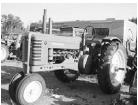
JD #B, elec. start, restored, $2,500.