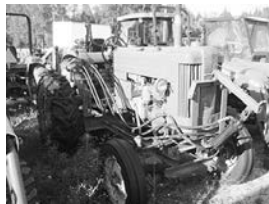
JD 40, 3-pt., $2,500.