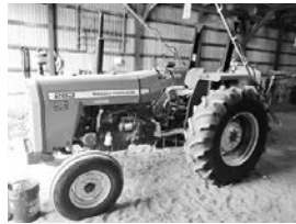
MF 283, 3-pt., rem., 640 hrs., like new, 70 hp, $14,500.