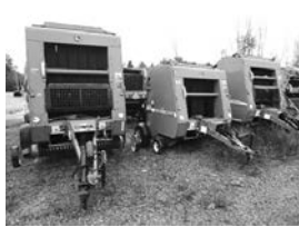
(3) JD round balers, 446, 457, 467, $9,000 & up.