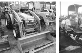
JD 790, 4x4, ldr., 300 hrs., $14,950.