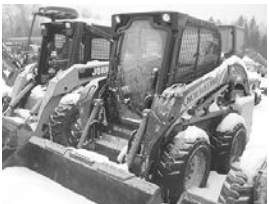
NH L218, cab, heat, hyd. plate, 1200 hrs., 1850 lb. lift, $28,500.