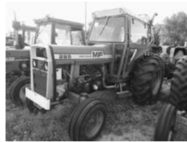
Massey 285, cab, 2700 hrs., $7,295.