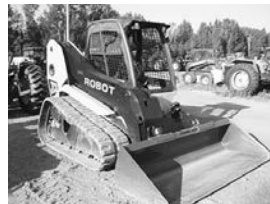
JCB Robot 1110 track, 3000 hrs., Perkins pwr., $29,900.