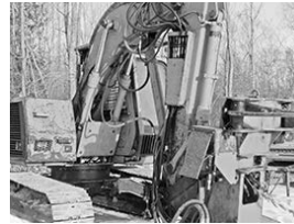
'99 Hitachi EX100, w/feller buncher, good cond., $28,500.