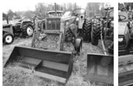
AC 190, gas, ldr., $3,500.