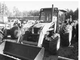
NH TN60DA, 2800 hrs., cab, heat, A/C, clutchless shuttle, Q-tach, $28,500.