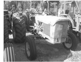
JD 1530, new dsl. eng., good rubber, 3-pt., rem., $6,500.