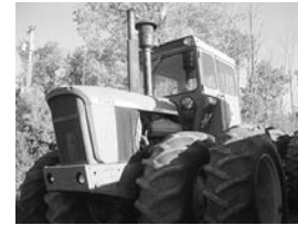
JD 7520, 4x4, articulated, duals, 3-pt., dual rem., 4600 hrs., $17,500.