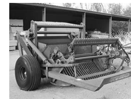
Harmon XL78 rock picker, hyd. drive, $10,250.