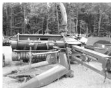
IH 8750 chopper, both heads, $2,500.