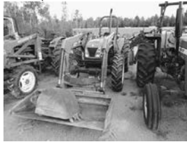
'07 NH TN75S, ldr., 850 hrs., pwr. shuttle, Super Steer, $26,500.