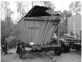
Richarton dump box, $3,500.