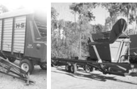
NI 323 1R & 2R picker, both very good, $2,250 ea.