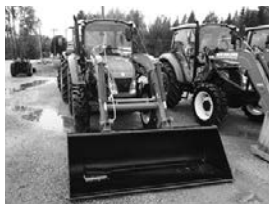
NH T4.75, cab, 104 hrs., new cond., $42,500.