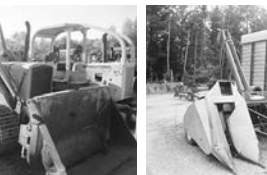
JD 450B crawler ldr., 4-in-1 bucket, exc. iron, $14,500.