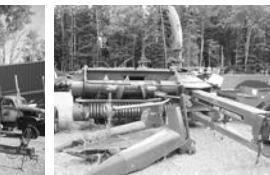
Highline 700 bale mover, $9,900.