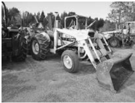
Ford 3400 ldr., 3-pt., PTO.