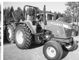
MF 4610, 168 hrs., 100 hp, pwr. shuttle, dual rem., $27,500.