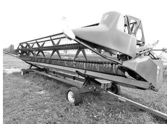
'98 JD 930F, 30', good poly, 3" SCH roller knife, like new, poly end dividers, dialomatic, $4,950.