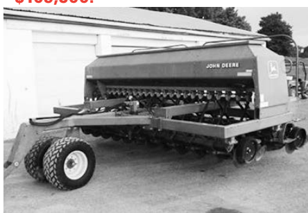
'00 JD 1560, 15' no-till drill, new blades, dolly whls., $17,500.