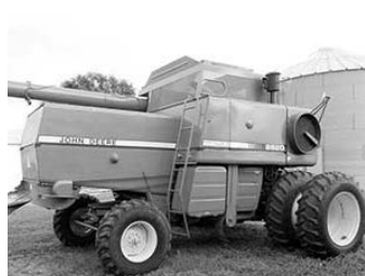
'84 JD 8820 Titan II w/18.4x38 duals, Goodyear, 2WD, new walkers, new hydro, $14,500.