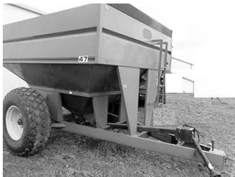
AL47, 450-bu., 12" side unload auger, $3,250.