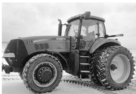
'10 CIH Magnum 275, powershift, (no def.), 18.4R46 duals, cherry, 1-owner, $109,500.