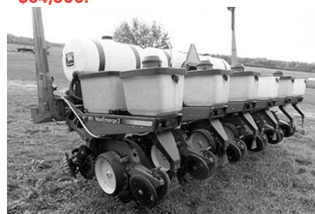
'92 JD 7200, 6R30 vac., liquid, squeeze pump, no till/shark tooth row cleaner, 250-mon., $8,750.