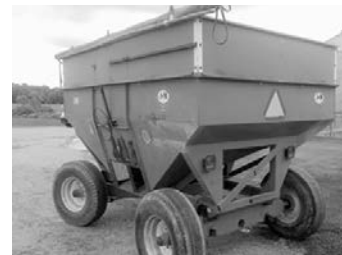
J&M 350-20 13-ton wagon, roll tarp, $3,450. Bruning seed vac. add'l. $2,000.