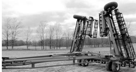
'14 UM 1225-47 rolling harrow, spike till bar, 47', $8,700.