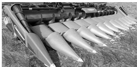
'13 Geringhoff RD1200/FB 12R30' hyd. fold chopping, $46,500.