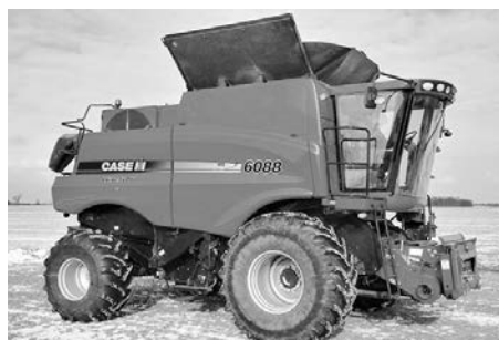
'11 CIH 6088, 30.5x32, 4WD, loaded, 1-owner, $118,000.