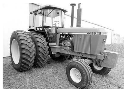
'90 JD 4455, 2WD, duals, 15 spd., Powershift trans., 540/1000 PTO, 1-owner, 5800 hrs., $39,900.