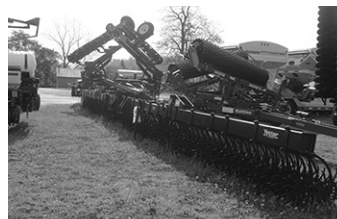
New Yetter rotary hoes, 41'.