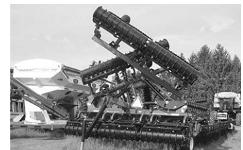
New Unverferth rolling harrow. Save BIG on in stock units.