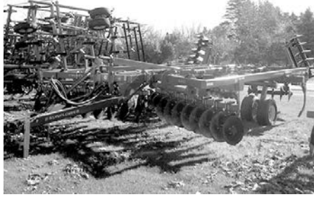
New Sunflower 4412-07, $37,500.