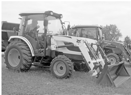
Bobcat CT 5558.