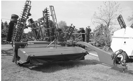
Used NI 5212.