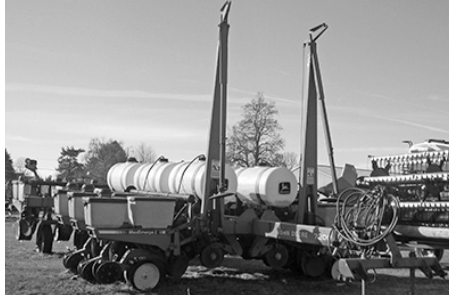
JD 7200, 12R, liquid.