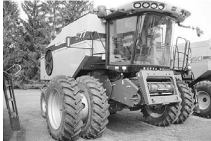
Gleaner S77, low hrs., nice.