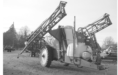
Hardi 1100, 90'.