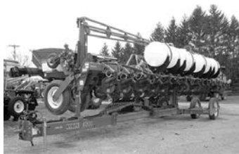
Kinze 3600, 16R, liq.