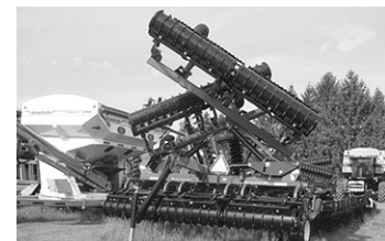
New Unverferth rotary harrow.