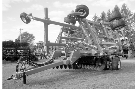
New Landoll 26' disc in stock.