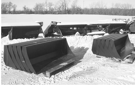
New loader buckets, 72", $350-$500.