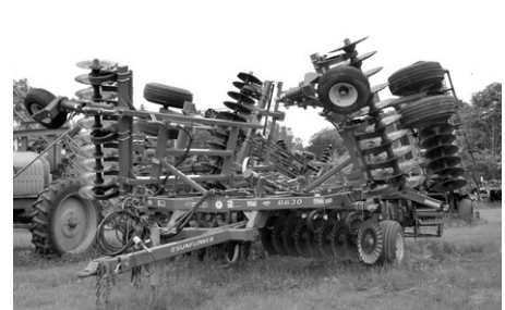
Used Sunflower 6630, 32', VT, low acres, $45,000.