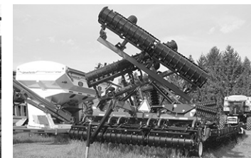
New Unverferth rotary harrow.