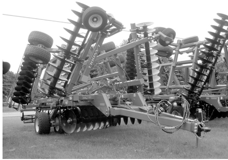
New Landoll 6231-26 disc in stock.