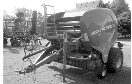
MF 4160V baler.