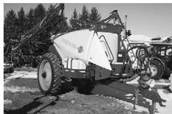
New Hardi Nav. 3000, 60' boom, super special, $32,500.