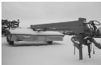
Krause FC4100 discbine.