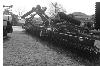
New Yetter rotary hoes, 30'-41'.