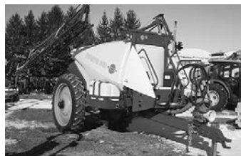
New Hardi Nav. 3000, 60' boom, super special, $32,500.