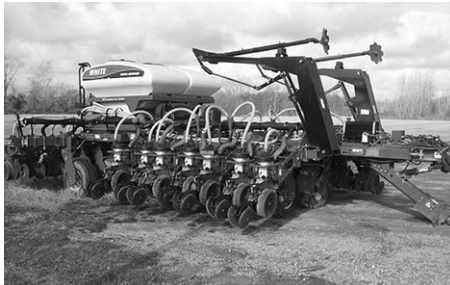
White 8531 CF planter, 16/31R.