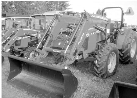
MF 4707, ldr.