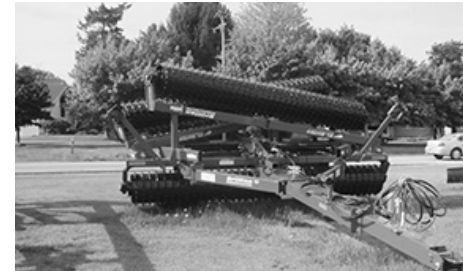
New Brillion packers.