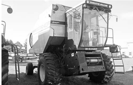
Gleaner R40, nice cond.