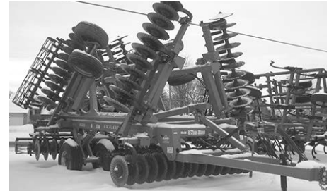
Krause Kuhn 8000, 25', VT.