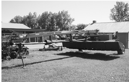
Case IH DCX 161 discbine.