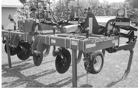
New demo Sunflower 4710, $13,000 or best offer.