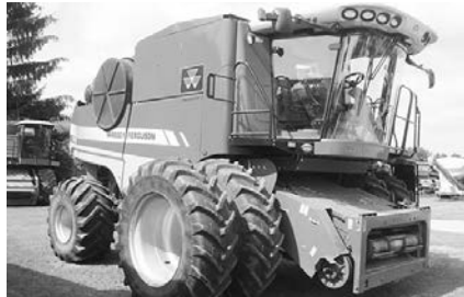
'11 MF 9795.