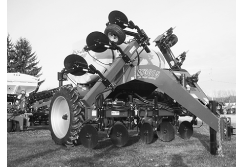
New Blu Jet dealer.