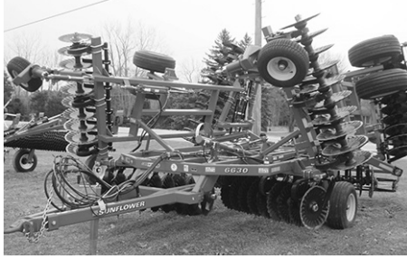
New Sunflower 6630-24, $42,500.