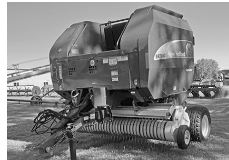
NH 7000 round baler.