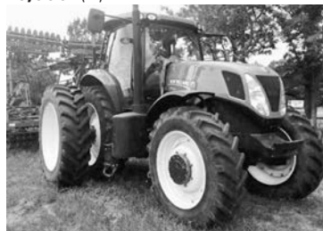
'13 NH T7.260, 2560 hrs., #24403, $99,500. (C)