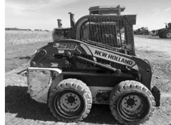
'14 NH L218, hand/foot, 2677 hrs., $18,000. (W)