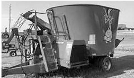
'13 Peecon 460CF, 460 cu. ft., mixer/feed wagon, pre-owned, #21819, $33,900.