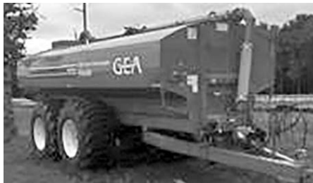
'16 Houle EL54-5000, lightly used, 6000-gal., tdm., 95% tires, 1000 PTO, #32619, $55,900.