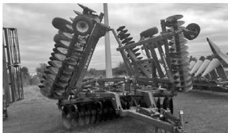
Landoll 6230-30, #25358, $32,500. (3R)