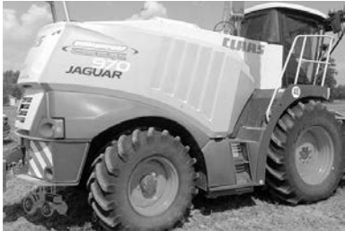
'12 Claas Jaguar 970, 1337 eng. hrs., 1071 cutter head hrs., $279,000. (BR)