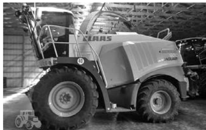
'12 Claas Jaguar 970, 943 hrs. eng. 1, 1707 hrs. eng. 2, $279,000. (BR)