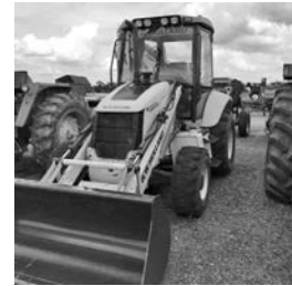
'11 NH B95B, 95 hp ldr./backhoe, #28114, $44,900. (BR)