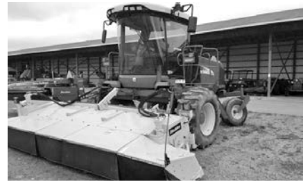
'09 NH H8080, 18' header, #23061, $69,000. (D).