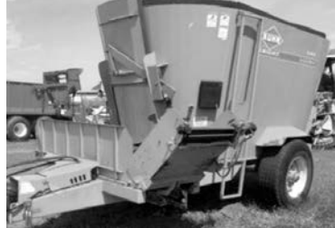
'08 Kuhn Knight 5144, new planetary, screws & knives, #24097, $27,500. (BR)