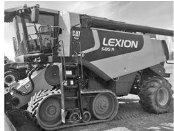
'09 Lexion 585R, 1548S/2195E hrs., #30617, $139,000. (C)