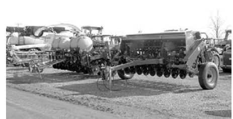
New Great Plains no-till drill in stock, call for details.