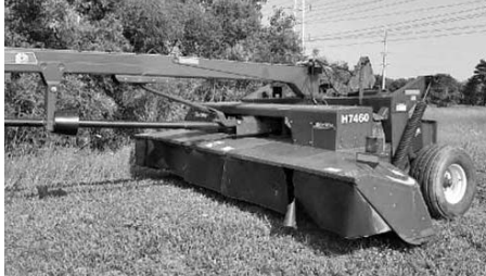
'08 NH H7460, 15' width, #21995, $18,500. (3R)