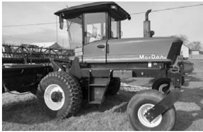
'02 MacDon 9352, 2500 hrs., #22854, $37,500. (BR)