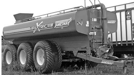
Jamesway pumps & spreaders in stock.