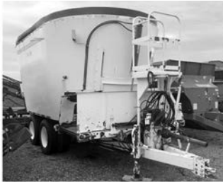
'12 Laird VR1200, 1200 cu. ft., #28381, $26,900. (C)