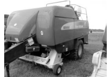
'11 NH BB9060 baler, 4x5 bales, 22,200 bale use, #22904, $59,000. (3R)