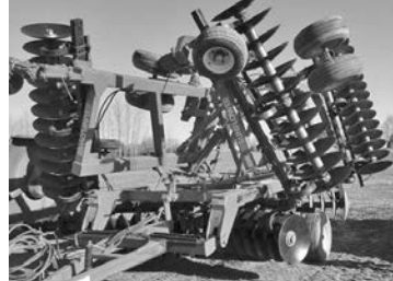
'96 Sunflower 1433-25, 25', new frt. blades, #31586, $19,900. (D)