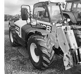
'13 JCB 536, 530-60 Agri Telehandler, price includes bucket & forks, #30527, $64,900. (D)