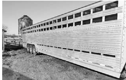
'14 Eby Ruffneck tri-axle livestock trlr., #27,900. (C)