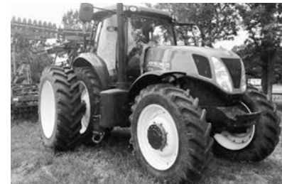
'13 NHT7.260, 2560 hrs., #24403, $99,500. (C)