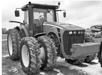
'10 JD 8295R, IVT trans., ILS susp., JD 9.0L 6-cyl. dsl., 8408E hrs., 295 hp, #31574, $87,900. (D)