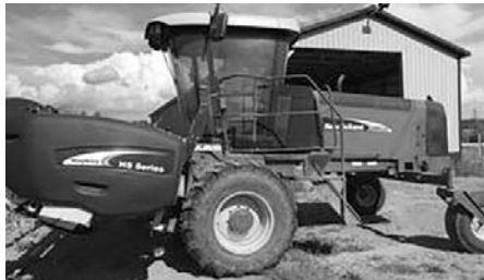
'05 NH HW325, roll conditioners, 1385 hrs., #32124, $39,500. (D)