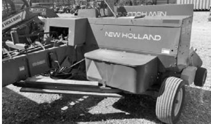
'02 NH 575, offset baler, #26526, $12,900. (H)