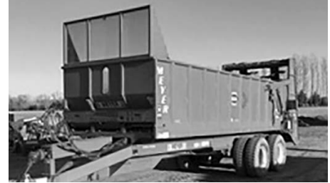
'13 Meyer 9524W, CropMax, vertical beaters, #31307, $49,500. (D)