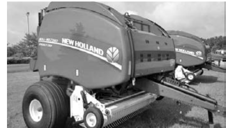
'14 NH RB560, 5x6, #25547, $31,900. (3R)