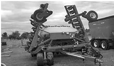
JD 1990CCS, pre-owned, #28588, $64,900. (3R)