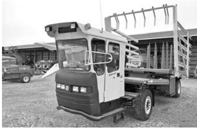
New NH H9870, self-propelled bale wagon, in stock, #27430.