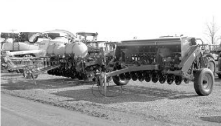
New Great Plains no-till drill in stock, call for details.