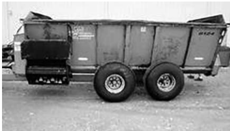
'05 Kuhn Knight 8124, side unload, steel flooring, splash guard, 2400-gal. cap., 1000 PTO, #17103, $12,500. (D)