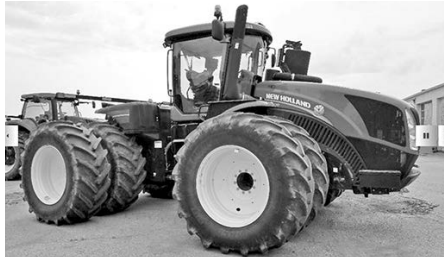
'15 NH T9.530, luxury cab, 710/70R42 tires, 1022E hrs., 530 hp, #31210, $199,000. (W)