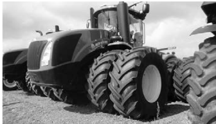
'12 NH T9.615, 600 hrs., 615 hp, #21926, $245,000. (BR)