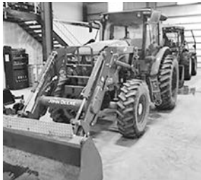
'13 JD 6115D, 2128 hrs., MFD, w/ldr., #29752, $52,900. (D)