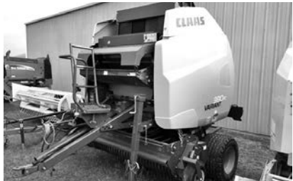
'12 Claas 380RC roto cut, 4x6 bale, #26337, $19,900. (H)