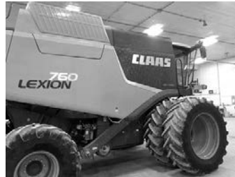
'13 Lexion 760, 1000E hrs., 4WD, duals, #25427, $159,000. (3R)