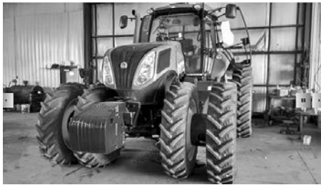
'13 NHT8 Series - Tier 4A T8.330, dsl., 4WD, 550E hrs., 330 hp, #20689, $147,000. (C)