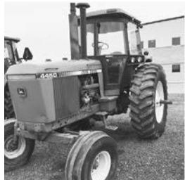
'85 JD 4450, 540/1000 PTO, 2-rem., 6875 hrs., 140 hp, JD 7.6L 6-cyl. dsl., #31115, $26,900. (D)