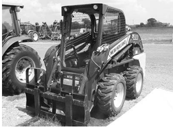
'12 NH L218 skid ldr., 2500 hrs., #24405, $18,000. (BR)