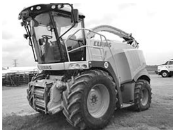
'11 Claas Jaguar 970, 1673 hrs., $178,000. (BR)