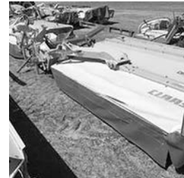
'13 Claas Disco 9100C, frt. mower included, $41,900.