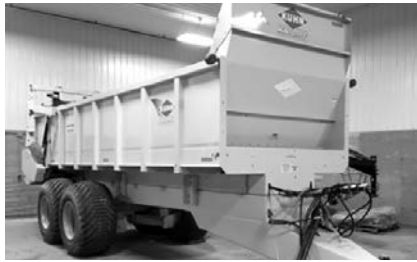
Kuhn Knight PSC181, rear unload, tdm. axle, #30038, $57,800. (D)