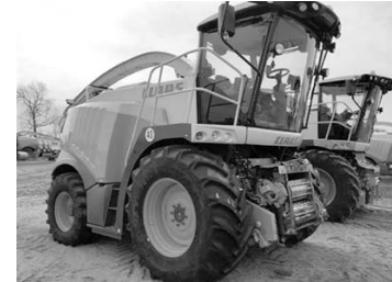
(3) Claas 970's, from 1000E hrs., 4WD, Scherer processor, from $219,000.