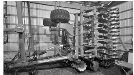
'15 Horsch Joker RT230, 23' disc, 19" notched blades, #C01173, $49,500. (W)