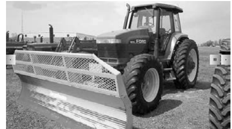
'95 NH 8870, 4WD, 180 hp, #5168, $52,000. (BR)