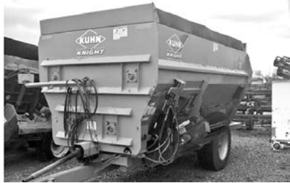
'11 Kuhn Knight 4142, (4) augers, 420 cu. ft., #29579, $17,500. (C)