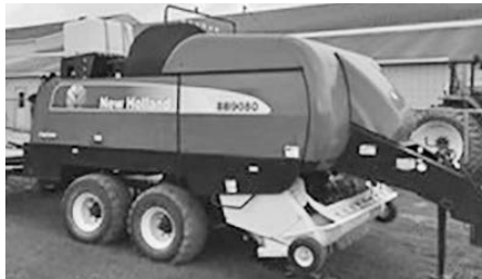
'12 NH BB9080, bale size 3x4, hyd. pickup lift, bale counter, rotocut, includes Phiber 4108 accumulator, overall exc. cond., #27459, $97,900. (H)