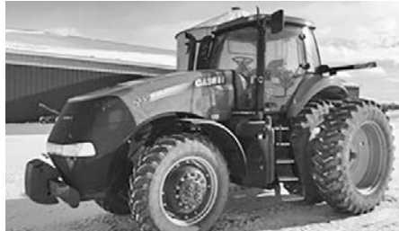
'14 Case Magnum 235, 4-rem., quick hitch, 908 low hrs., 540, 1000 (1-3/8"), 1000 (1-1/4") PTO, 2-owner tractor, 480/80R46 rears 85% cond., 380/85R34 frts. 60%, overall exc. cond., $120,000. (D)