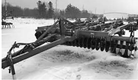
'13 Landoll 2110-13, 13-shank Landoll disc ripper, #21033, $32,900. (3R)