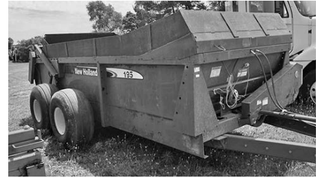
'06 NH 195, dbl. apron, mechanical drive, #31395, $10,900. (BR)