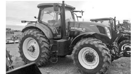
'12 NH T7 Series - Tier 4A T7.270, 4WD, 126E hrs., 230 hp, #24224, $160,000. (3R)