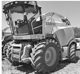
'13 Claas 960, 4WD, 1284 hrs., shredder, processors, #23337, $239,000. (D)