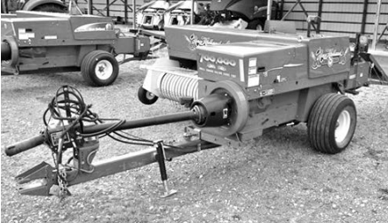
'08 NH BC5070, 60,000 bale use, #26528, $15,000. (H)