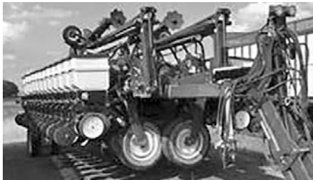
'08 Kinze 3700, 24R planter, 20"R spacing, Ag Leader GeoSteer GPS automation & mon. included, rubber closing whls., no-till coulters, hopper ext., #32437, $47,900.