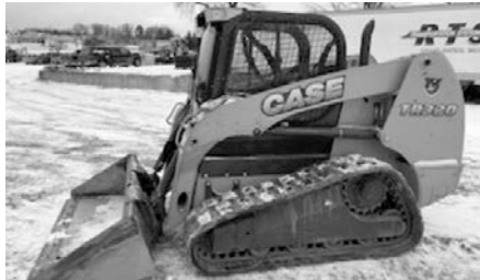
'15 Case TR320, 1266 hrs., 2 spd., #29210, $39,900. (BR)