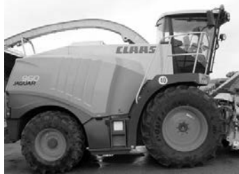
(2) '13 Claas 960's, 4WD, 950 hrs., shredder, processors, choice $299,000.