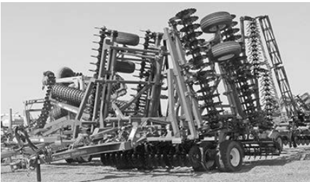
New Great Plains Turbo Maxx, 12', 15', 18', 24', 30' & 40' in stock.