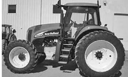
'03 NH TG230, pre-owned, 4WD, 2150 hrs., 230 hp, #10262, $90,000. (BR)