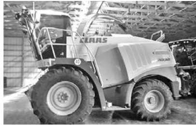
'12 Claas Jaguar 970, 943 hrs. eng. 1, 1707 hrs. eng. 2, #25301, $239,000. (BR)