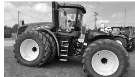
'11 NH T9.560, dsl., 4WD, 1241 hrs., 560 hp, #22202, $209,000. (W)