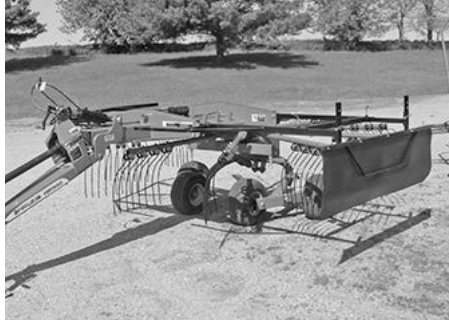
New Pequea HR939 9' rake , $6,200.