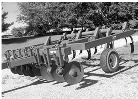
White 435 disc chisel , 8-shank w/S-tine leveler, very good, $3,950.