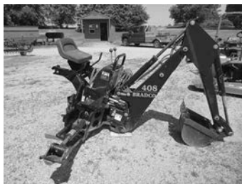
Bradco 408 backhoe , 8' digging depth, 16" bucket, skid steer or 3-pt. mount, very good, $4,500.