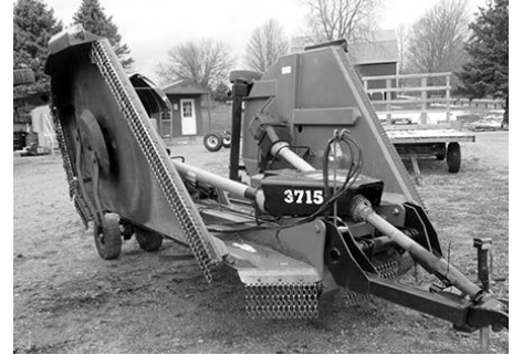
Bush Hog 3715 , 15' rotary cutter, very good, new knives, 1000 PTO, $7,950.