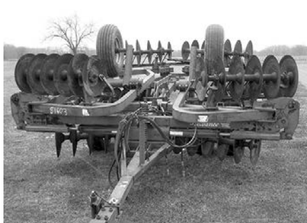
Kewanee 1010 disc , 17-1/2', 21" to 22" blades, very good, $4,350.