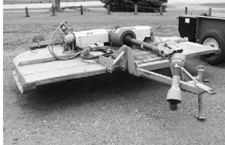
Woods 2126, 10-1/2' cut, very good, new knives, $4,250. Also: New Mohawk Brave 6' cutter w/slip clutch, $1,495.