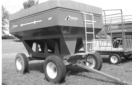
New E-Z Trail 1384 wagon, 400-bu. box, 22.5 tires, $5,795.