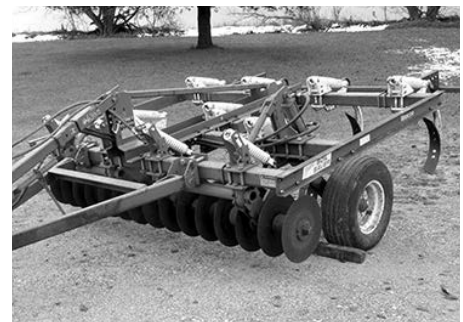
Glencoe 7-shank disc chisel , very good, w/splitter bar, new 4" shovels, $4,650.