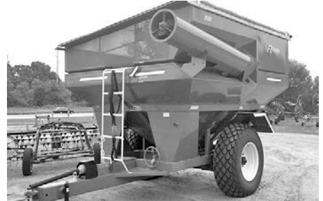
New E-Z Trail 510 grain cart w/tarp & lights, 490-bu., $11,750.