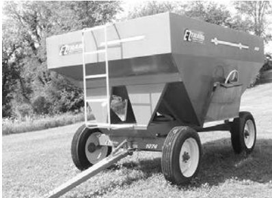
New E-Z Trail 1074 wagon, 300-bu. box, 22.5 tires, $4,250.