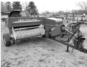
NH 316 baler w/ thrower , very good, $5,975.