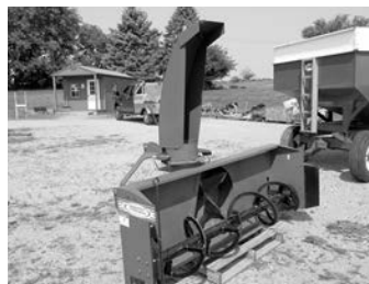
Agro Trend 3084 3-pt. snowblower , clears 7-1/2' wide, very nice, $1,850.