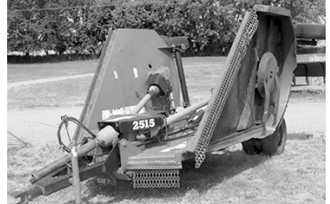
Bush Hog 2515, 15' cutter, 540 PTO, very good cond., new knives, (6) good airplane tires, $6,850.