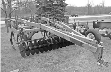
AC 1500 5- or 7-shank disc chisel w/leveler bar, 19" disc, very good, $4,975.