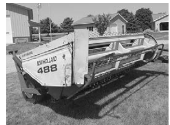
NH 488 9' haybine , very good, $5,650.