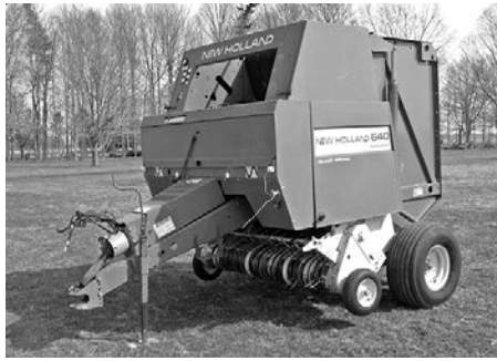
NH 640 auto. wrap , silage special, twine, good cond., $6,250.