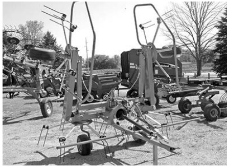
New Enrossi hay tedder , 17', hyd. fold, $5,500.