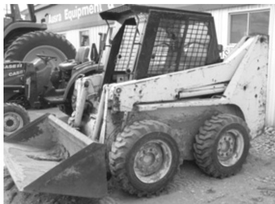
Gehl SL4835 skid steer, 2041 hrs., $7,500.