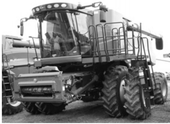
(6) '10 Case IH 8120, 500E/ 350S hrs., choice $290,000.