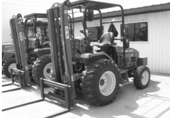
Demo Branson 3510 H forklift, hydro trans., $19,000.