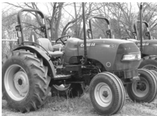
'11 Case IH Farmall 65A, 2WD, 110 hrs., $16,000.