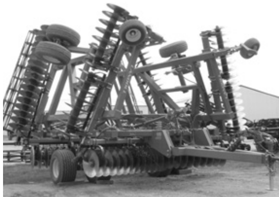
Landoll 7431-33' vertical tillage, brand new blades, like new cond., (1) year old, $55,000.