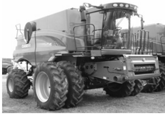
'09 Case IH 8120, 950E/ 700S hrs., $250,000.