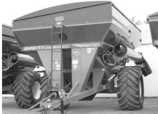
Brent 1082 grain cart, like brand new, reduced, $34,000.