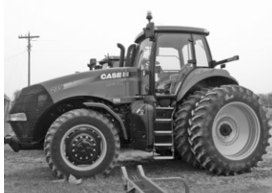
Case IH MX 235 Tier 4, 250 hrs., $149,000.