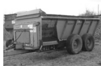
Knight 8024, 2400-gal., slinger, ready to go .... $11,900