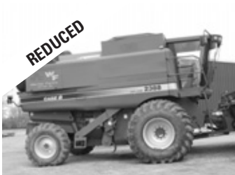
'00 Case IH 2388, RWA, 30.5x32 (65%), 18.4x26, FT., chopper, chaff spreader, 2387 sep. hrs., ready to go. .... $76,500