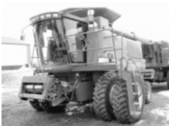
'96 Case IH 2188, RWA, FT, RT, chopper, duals, well kept, annual dealer inspections, 2886S hrs. .... $63,500