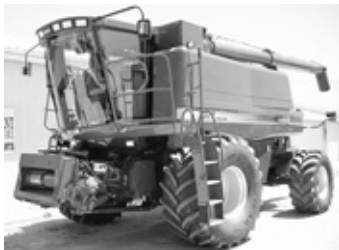
'05 Case IH 2377, RWA, 30.5 (75%), straw chopper, rock trap, hard to find a nicer one, only 740 sep. hrs. .... $159,000