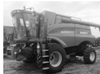
'09 Case IH 6088, R30.5R32, 600/65R28 R1V, 2 spd. hydro, FT, RT, HD cone, PF bin ext., chopper, super nice, 387S hrs. .... $219,500