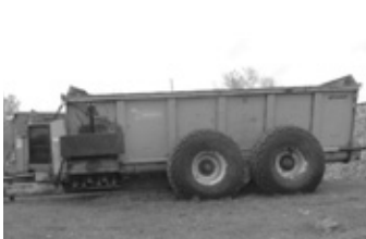
Knight 8140 4000-gal. slinger spreader, w/new flails, 28Lx26 tires, good ... $25,900