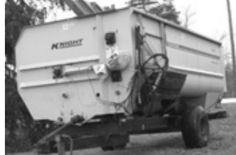
Knight 3070 700 cu. SDL commercial mixer, good except needs reel bars, as-is .... $6,900