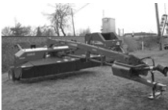
'05 Case IH DCX131, 13' discbine, good. ... $15,900