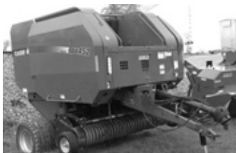
'06 Case IH RBX452 silage special w/Roto, cut & net wrap, nice unit .... $18,500