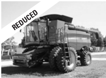
'06 Case IH AFX8010, dual 20.8R42, 540R30, FT, RT, well kept, 1280S hrs. .... $166,500