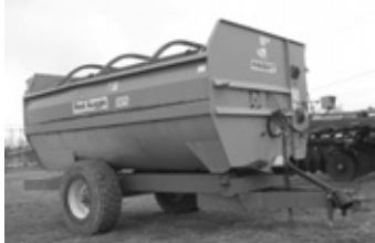
Knight 3575, 500' Reel Augie, S.S. floor, scales, good .... $12,900