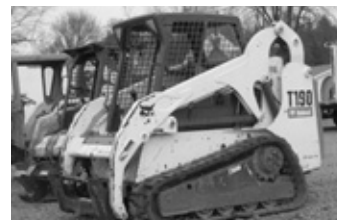
'08 Bobcat T190 w/ACS, pwr. Bobtach, warranty through 10-30-12, 880 hrs. .... $24,900