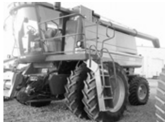
'98 Case IH 2388, RWA, 600/65R38 duals (95%), 18.4x26 (70%), FT, RT, 2 spd., chopper, AFX rotor, 2320 sep. hrs. .... $85,000