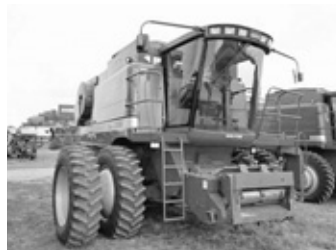
'03 Case IH 2388, RWA, FT, RT, TT, chopper, duals, well kept, annual dealer inspections, 1947S hrs. .... $119,500