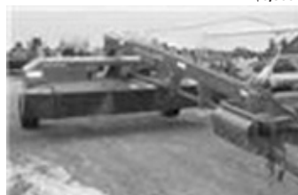
'02 NH 1431 13' discbine, low acres, very good, (N.A.P.) .... $16,900