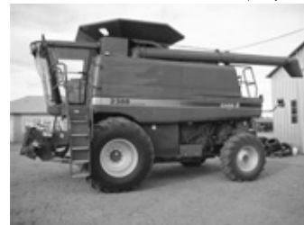
'05 Case IH 2388, RWA, 30.5x32, 2 spd., RT, FT, TT, chopper, 711S hrs., very good .... $163,500