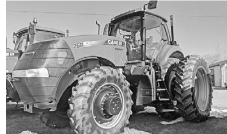
Case IH Magnum 260, deluxe cab, cab susp., manual cloth seat, 19F spd. PS economy, high cap. drawbar, HD 3-pt. hitch, high cap. hyd. pump, 4-rem., 1000 PTO, rear whl. wts., 420/85R34 frt. tires, 480/80R50 rear tires, duals, $115,000.