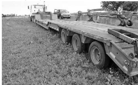
'00 Holden 53' dbl. drop deck, 20' well, 26" deck, 34" rear deck ht., tri-axle, 215/75-17.5 tires, $10,000.