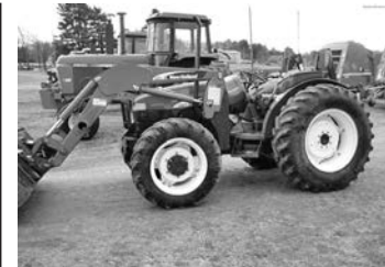
'07 NHTN75A w/ldr., 12x12 power shuttle, 2000 hrs., $19,500.