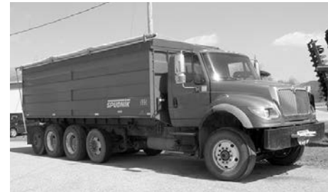
'04 Int'l. 7600 6x4, 535 Quad, frt. steer, ISM 370 hp, 4.11 ratio, w/Spudnik 4400 rear unload potato box, several to choose from, 10 spd., from $35,000 to $70,000.