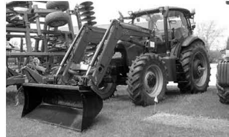
'11 Case IH Magnum 125, value w/L750 ldr. MSL, 16x16 semi powershift, 18.4R42 & 14.9R30 (90%), 4500 hrs., $55,000.