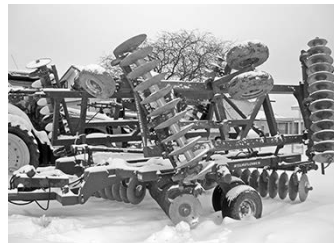
'05 Sunflower 1434-30 disc harrow , 23" blades, rear hitch & hyd., 12.5Lx15 SL tdm. on main, 75%, 11Lx15 SL tdm. on wings, $22,500.