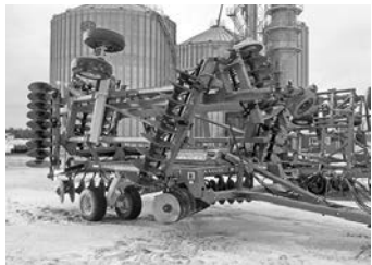
Krause 8300 , 37', Krause disc, quad fold, 23" blades, tdm. on main & wings, $45,000.