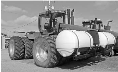
'09 Case IH Steiger 435, 710/70R42 Goodyear DT824 duals @ 90%, 4-rem., std. pump, diff. locks, std. drawbar, frt. wt. frame w/(8) wts., 5622 hrs., well maintained, $116,000.