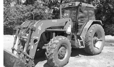
'97 Case IH 5230, MFD w/Woods ldr., 18.4x38 rear singles 25%, 14.9x24 frts. 25%, semi pwr. shift trans., good running tractor, $23,000.