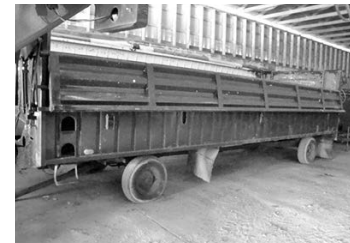
Spudnik 24' , good box, doesn't fit operation anymore, $14,000.