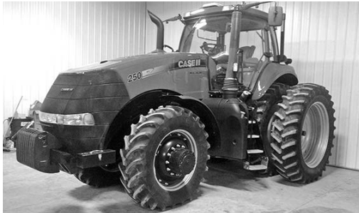
'13 Case IH Magnum 260, 1086 hrs., luxury cab, Goodyear 480/80R46 duals, 380/85R34, Power Beyond, large pump, 4-rem., std. drawbar, large 1000 PTO, Powertrain warranty until 11/6/16 or 1449 hrs., $250 deductible, $115,000.