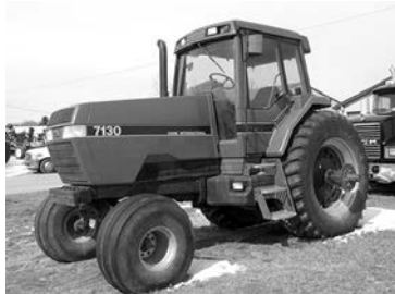
Case IH 7130, 2WD, 5750 hrs., Powershift trans., tires are 75%, small 1000 PTO, nice tractor, $32,000.