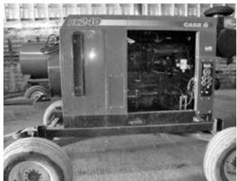
(2) Case IH PX 240, only 7806 & 3011 hrs., mounted on Knowles running gear, $9,500 & $11,000.