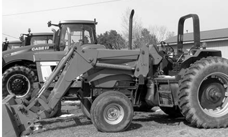
'12 Case IH 5120, 2WD, w/510 ldr., pwr. quad trans., 540 PTO, 3-rem., 4395 hrs., tires are 75%, $17,900.