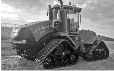
'14 Case IH 470 Quadtrac, 745 hrs., luxury cab, frt. & rear HID, cab HID, beacon, Pro 700, 372 receiver & Nav II, high cap. hyd. pump, 6-rem., pwr. beyond, 1000 PTO, high cap. bar axle w/diff. lock, 36" tracks, tow cable and ppp until 08-2017, zero deductible, $270,000.