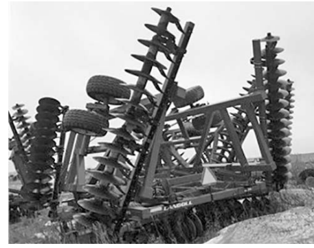
'12 Landoll 6230-33, all new blades & bearing, hyd. fore & aft, no welds, field ready, 24 ft. disc size, gauge whls., 24 rear disc size, walking tdm., $32,500.