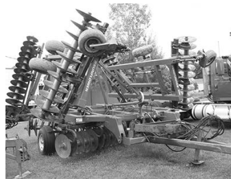
'05 Sunflower 1434-30 disc harrow, 23" blades, rear hitch & hyd., 12.5Lx15 SL tdm. on main, 75%, 11Lx15 SL tdm. on wings, $22,500.