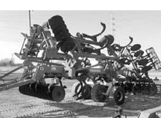
'11 Krause 4850 , 21' Dominator, combo shanks, SSL tires, 20.5" frt. blades, 23" middle blades, 23" rear blades, round bar leveler, $39,500.