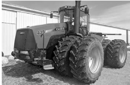
'09 Case IH Steiger 435, 710/70R42 Goodyear DT824 duals @ 90%, 4-rem., std. pump, diff. locks, std. drawbar, frt. wt. frame w/(8) wts., 5422 hrs., well maintained, $103,500.