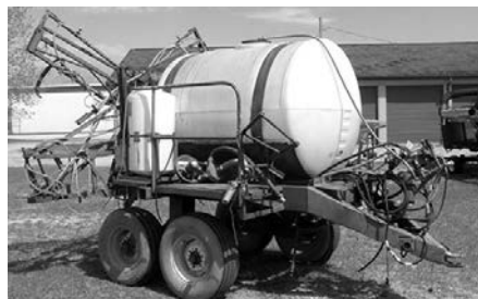
500-Gal. sprayer w/38' boom.