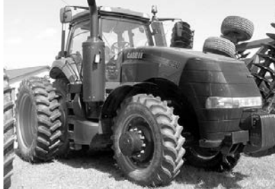
'14 Case IH Magnum 250, 18.4x46 duals, guidance ready, 1160 hrs., 540/1000 PTO, $127,500.