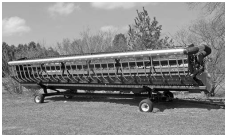
'06 Case IH 2020, 30' platform w/AWS Wind-Reel crop saver, good working cond., $13,500.