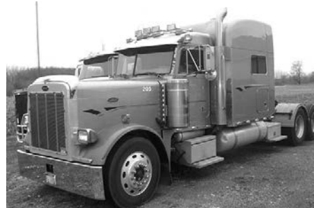
'03 Pete 379 w/ C15, 13 spd., dbl. bunk & 11x22.5 tires 80%, road ready, $29,500.