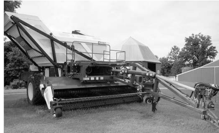
Twin Master edible bean combine standard features, H.D. drive train w/cam type cut-out clutch, over running clutch, 2.2 spd. trans. to threshing cyls., 1000 input, 540/390 output, optional trans. 500 & 350 output, in stock.