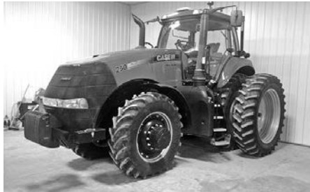
'14 Case IH 250 Magnum, deluxe cab, 4-rem., multi PTO, big pump, H.D. drawbar, susp. cab, wts., $139,900.