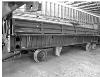
Spudnik 24', good box, doesn't fit operation anymore, $14,000.