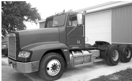
'94 FTL Columbia, 12F, 20R, L10 330 hp, 9 spd., new rear end, shocks & air spgs., runs great, $6,000.