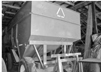
385 Box , w/18" extension, Killbros running gear w/10.00x20 tires, always been housed, $4,000.

Call us today for your best pricing on fertilizer & chemicals.