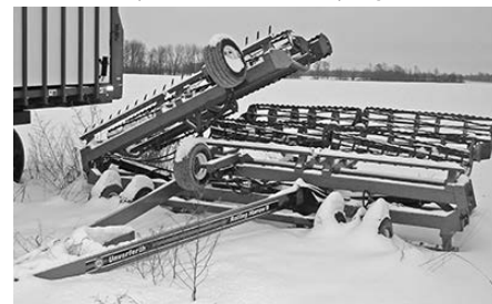
32' Unverferth 1225 rolling harrow, baskets are 80%, $8,500.