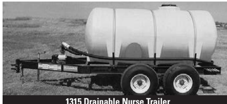
1315 Drainable Nurse Trailer