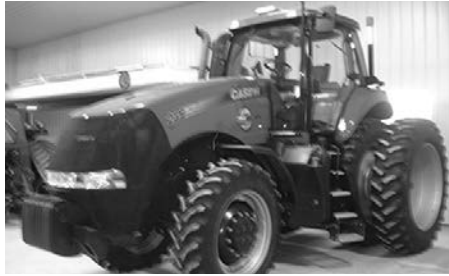
'12 Case IH Magnum 235, 1036 hrs., clean, 480/80R46 Firestone duals @ 90%, 380/85R34 Firestone @ 90%, (10) frt. wts., 540/1000/LG 1000 PTO, 4-rem., case drain, Auto Guidance ready, $119,500.