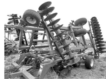
'05 Sunflower 4232-23' trash mulcher, 18.5" frt. blades, 11Lx15 tires @ 60%, S-tine leveler on back, rear hitch & hyd., (N.A.P.) $22,000