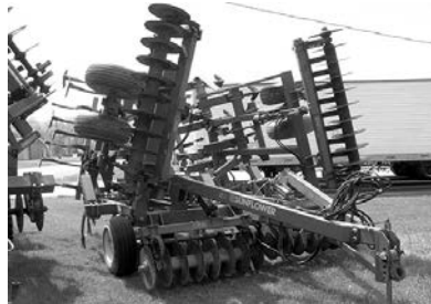
'96 Sunflower 4232-21 trash mulcher, frt. blades measure 17.5" S-tine leveler, rear hitch & hyd., $20,000.