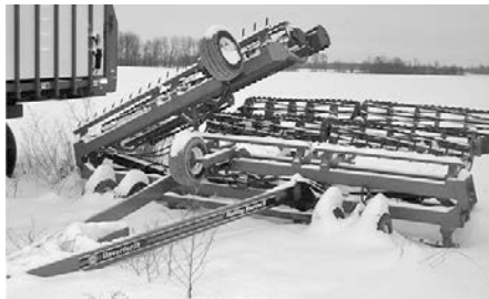
32' Unverferth 1225 rolling harrow, baskets are 80%, $8,500.