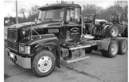
'00 Mack truck w/300 Mack eng. & 9 spd., like new rubber, wet kit, $15,000.