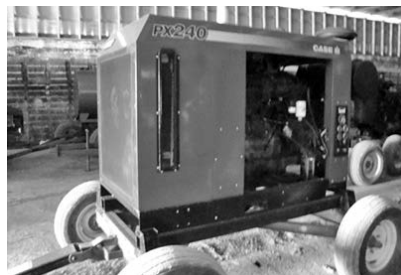
Case IH PX 240, 7806 hrs., mounted on Knowles running gear, $11,000.