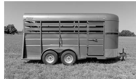
New '18 Valley 7x16 livestock trlr. in stock, call for your horse & livestock trailers - we will spec to your needs!