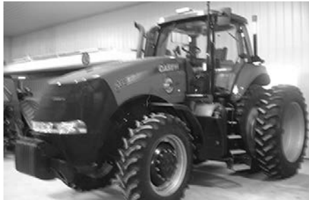
'12 Case IH Magnum 235, 1036 hrs., clean, 480/80R46 Firestone duals @ 90%, 380/85R34 Firestone @ 90%, (10) ft. wts., 540/1000/LG 1000 PTO, 4-rem., case drain, Auto Guidance ready, $117,500.

Bob Kade, Sales (231) 629-1347 Bob Elsea, Parts Amber Soper, Parts Full Line of Ag & Truck Parts