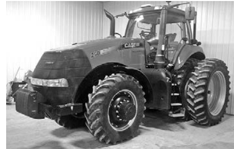
'14 Case IH 250 Magnum, deluxe cab, 4-rem., multi PTO, big pump, H.D. drawbar, susp. cab, wts., $129,500.