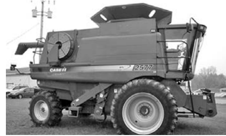
'08 Case IH 2577 combine, 1006 hrs., exc. cond., 480/80R42 duals @ 85%, 18.4x26 @ 65%, Pro 600, yield moisture, rock trap, reverser, field tracks, long perforated auger, chopper, mainly ran wheat, approx. 852S hrs., $125,000.