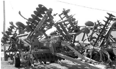
'11 Krause 4850, 21' Dominator, combo shanks, SSL tires, frt. blades, 20.5" middle blades 23", rear blades 23", round bar leveler, $36,000.