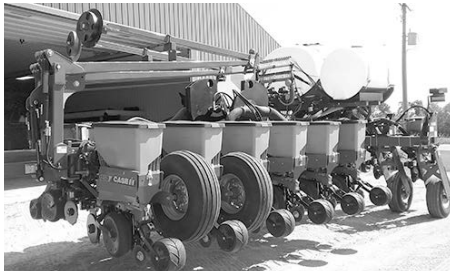
'12 Case IH 1250, 16R vacuum planter, individual hoppers, pneumatic down pressure, liq. fert. w/Sunco openers, 2x2 hyd. pump, starter fert. is in furrow w/totally tublar tubes, hyd. drive w/(2) section shut-offs, $42,500.