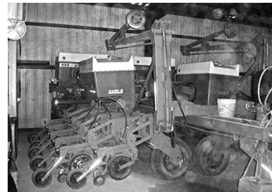
Case IH 955 planter, 16/31 15" row soybean planter, hyd. drive drums, Ag Leader Insight mon., large 1000 PTO pump, frt. fold, drawbar hitch, extra drums, $18,000 or best offer.